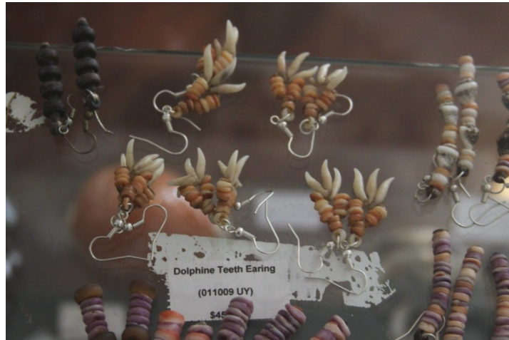
Figure 5: Earrings made of dolphin teeth for sale in an hotel of Honiara, Solomon Islands

In addition to the data collected during boat surveys, local markets, shops and communities were visited to purchase dolphin teeth from the traditional drive-hunt. The teeth were bought loose or on jewellery, including hearings, necklaces and headbands (Figure 5).