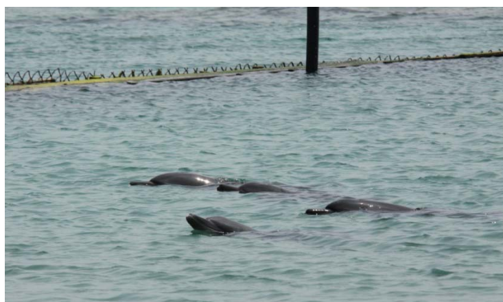
Figure 6: Typical posture of captive Indo-Pacific bottlenose dolphins at Gavutu holding facility

Contact was also initiated with the dolphin exporters holding T. aduncus in captivity in their facilities at Honiara (Guadalcanal) and Gavutu (Florida Islands). On request, they agreed to provide skin-swabbing samples from their captive dolphins. Equipment, including 5mL tubes filled with 70% ethanol and sterilized nylon scrub pads, was provided for the trainers to collect the samples. Unfortunately, it was not possible to attend and supervise the sampling and most samples turned out to be of poor quality for genetic analyses.