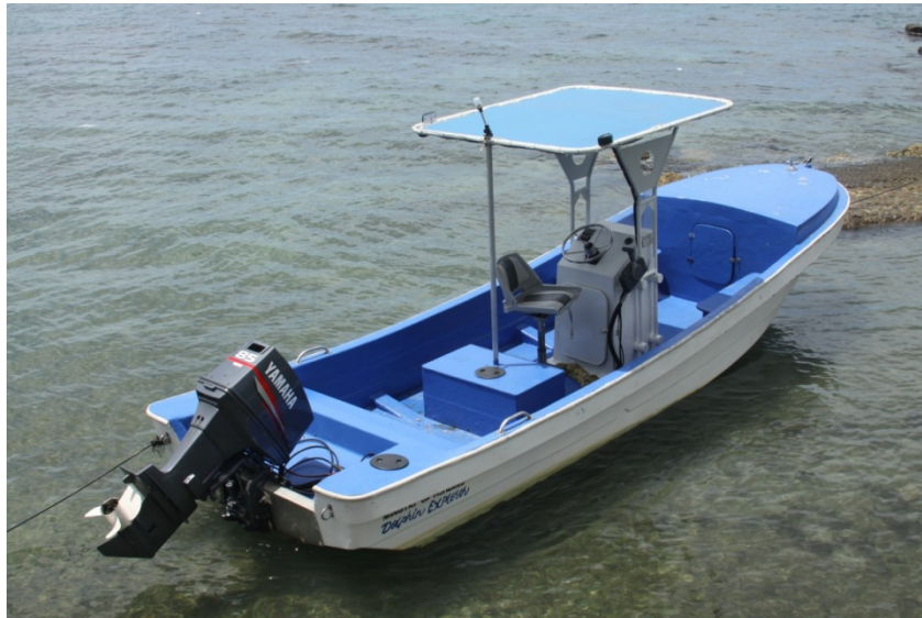
Figure 3: Research vessel for dolphin surveys in Solomon Islands

In this study, a “group” is defined as a spatial aggregation of animals that appears to be involved in a similar activity (e.g., foraging, socialising, resting or travelling, Shane et al. 1986). During each encounter with a marine mammal group (cetacean or dugong), the species was identified visually, GPS positions was recorded, group size was estimated by visual counts and general behaviour was noted. Group encounter rate was calculated for the most frequently sighted species ( Tursiops aduncus and Stenella longirostris ). It was estimated as the number of groups encountered for every 100NM of effort. When possible, photographs and/or biopsy samples were taken to confirm species identify. For dolphins, T. aduncus in particular, dorsal fin photographs were taken of as many individuals as possible using a digital SLR camera equipped with a 300 mm lens.