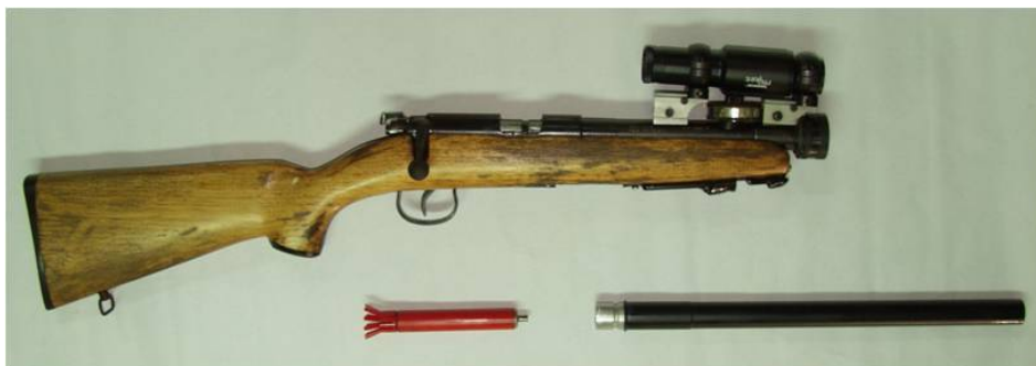
Figure 4: Paxarms biopsy system

In this study, a “group” is defined as a spatial aggregation of animals that appears to be involved in a similar activity (e.g., foraging, socialising, resting or travelling, Shane et al. 1986). During each encounter with a marine mammal group (cetacean or dugong), the species was identified visually, GPS positions was recorded, group size was estimated by visual counts and general behaviour was noted. Group encounter rate was calculated for the most frequently sighted species ( Tursiops aduncus and Stenella longirostris ). It was estimated as the number of groups encountered for every 100NM of effort. When possible, photographs and/or biopsy samples were taken to confirm species identify. For dolphins, T. aduncus in particular, dorsal fin photographs were taken of as many individuals as possible using a digital SLR camera equipped with a 300 mm lens.