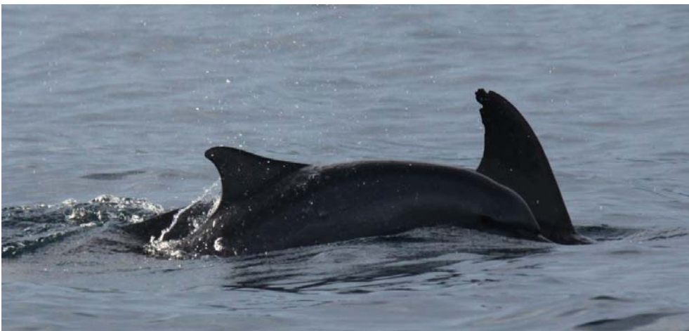
Figure 9: Juvenile of Stenella longirostris accompanying an adult Tursiops aduncus at Guadalcanal

S. longirostris and T. aduncus were observed at each of the four study sites. The group encounter rates for the S. longirostris and T. aduncus at each study site were roughly similar between the two surveys (Table 3). On the other hand, this pattern shows much variation between study sites and between species (Table 3). Groups of S. longirostris were more frequent at Guadalcanal and Florida Islands. Sightings were less frequent in Malaita, while they were rare at Santa Isabel. On the other hand, Santa Isabel is the study site where most T. aduncus were encountered. This was confirmed by the RAI around this island (Table 3). The number of groups encountered was fairly similar at Guadalcanal and Florida Islands. However, estimates of RAI suggest that many fewer dolphins were seen in the former, indicating that larger groups were found at Florida Islands. In fact, RAI at Guadalcanal was the smallest of all study sites despite group encounter rate being lower at Malaita. This indicates that fewer groups of T. aduncus are found at Malaita but that these groups were larger than in Guadalcanal.