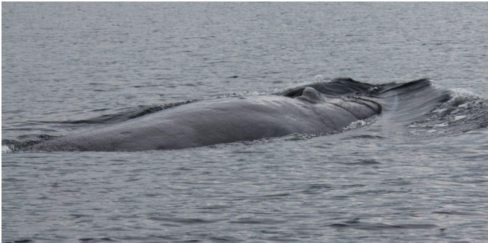
Figure 8: Balenoptera sp. sighted on the coast of Florida Islands, November 2010