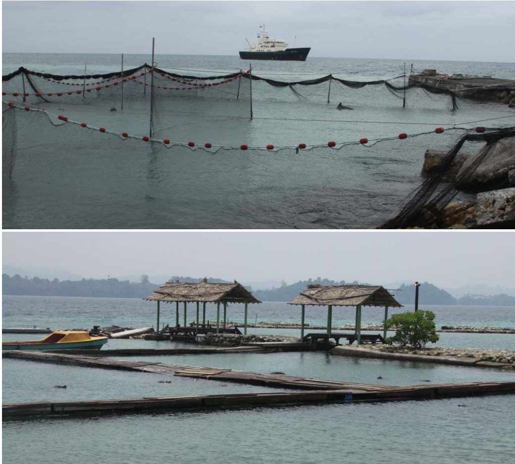
Figure 1: Solomon Islands dolphin holding facilities in Honiara, Guadalcanal (top) and Gavutu, Florida Islands (bottom).

different level of training. Seven dolphins were supposed to be exported soon, jointly with the two dolphins from Honiara's facility. Here again, we were told that all the dolphins in Gavutu were captured along the coast of Guadalcanal and then brought by boat at Gavutu. A trainer told us about an attempt years ago to keep and train some pantropical spotted dolphins, Stenella attenuata , captured around Malaita by local fishermen involved in drive-hunting. This attempt was not successful and many dolphins died during the experiment.