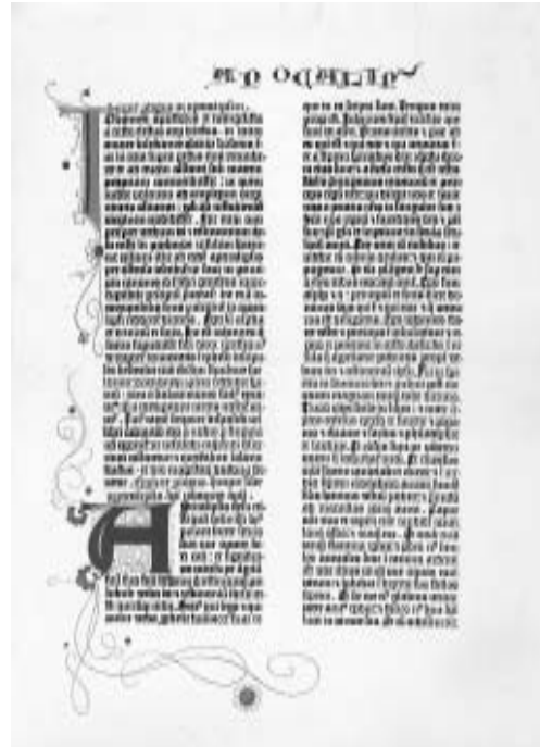
Pages like this one, the first page of the Bible book of Apocalypse (Revelation), were printed on Gutenberg's and other early presses. Note the hand-inserted illuminated text.

For the next 400 years, printers followed much the same process. While there were improvements in the mechanism of printing presses, letters were still set in place one by one, being assembled in a shallow hand-held tray called a "composing stick." After each line of type was spaced to fit snugly in the width allocated, a strip of lead, usually two points wide, was inserted between lines. If no lead was