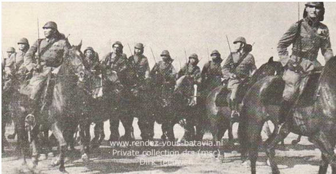
P.4 Charge of KNIL cavalry during parades in Batavia / Jakarta, Waterlooplein / Lapangan Banteng, 1930

In 1940 the mobilized KNIL counted 40.000 professional soldiers and 20.000 home reserves (landstorm) as well as conscripts. In the same year the army command tried to place orders for the delivery of 500 planes: bombers, dive bombers and fighters. The command already made a start with the motorization and mechanization of the troops on Java. The aim was to form five mobile brigades with 5.000 men and 90 tanks / armoured cars each.