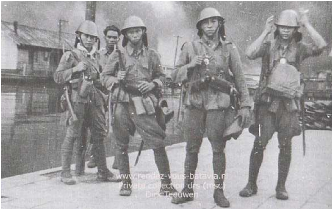
P.8 Sumatra 1942 KNIL soldiers after heavy fights with the Japanese near Palembang

1834 Lampong-expedition on Sumatra 1843 Efforts to destroy pirates in the archipelago 1846 First Bali-expedition 1848 Second Bali-expedition 1850 Riots at Bantam West-Java 1850 Revolt of Chinese on Borneo in the Western District (Wester Afdeling in Dutch) 1851 Expedition on Ceram (Moluccan Islands) against Amahay and Mahariko 1851 Revolt at Palembang 1851 Second Lampong-expedition on Sumatra 1853 Riots of Chinese on Borneo in the Western District (Wester Afdeling) 1854 Riots at Palembang and dependencies on Sumatra 1854 Expedition to Borneo, Western District 1856 Expedition to Tomiri (Moluccan Islands) 1856 Expedition to Mandar on Celebes / Sulawesi 1856 Riots among Chinese on Riouw