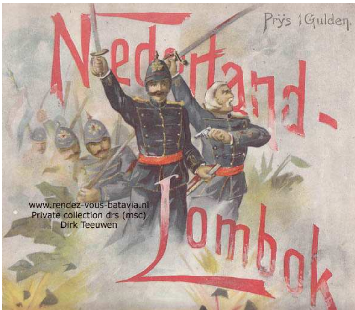
P.1 Poster 1894, Lombok Expedition, The Dutch East-Indies