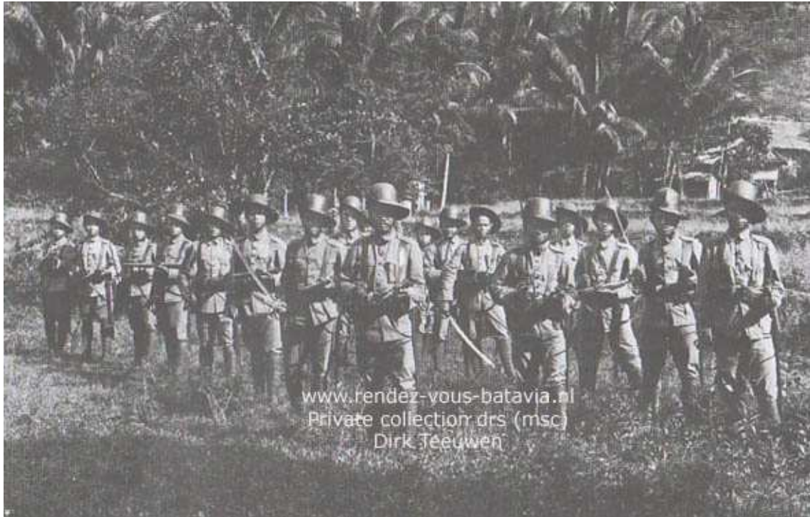
P.3 KNIL soldiers on patrol, 1930