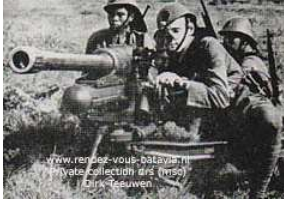
P.5 Manoeuvre, Java 1936

In accordance with these plans finally each brigade could consist of: