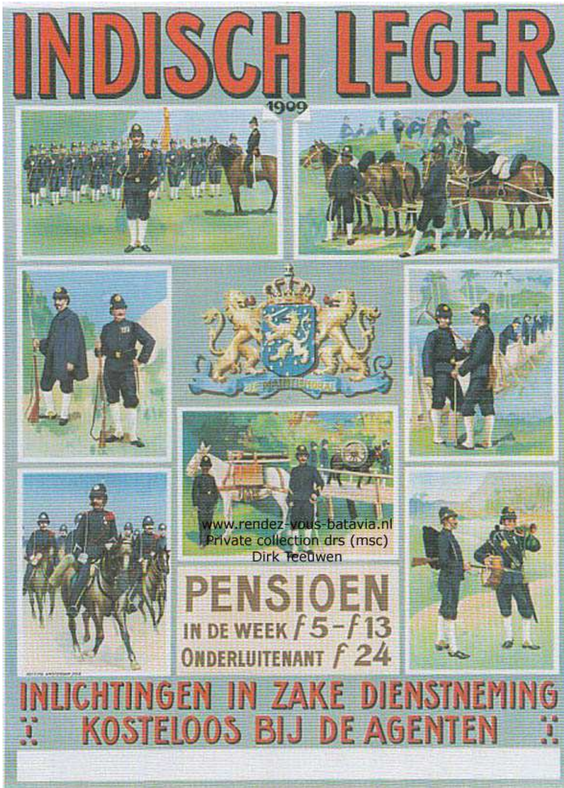
P.7 Recruitment poster