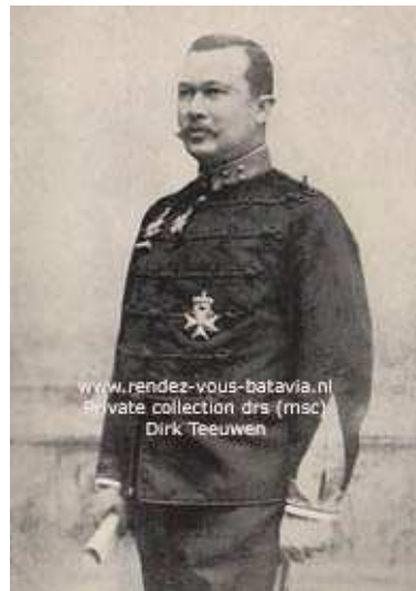
P.9 and 10 General Van Heutsz 1903 (left) Colonel Van Daalen 1903 Location: Kota Radja / Banda Aceh