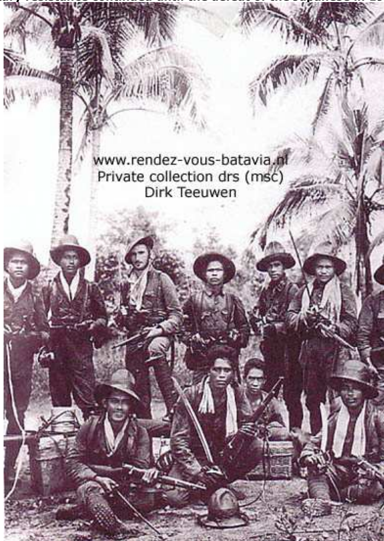
P.6 Around 1920 somewhere in the archipelago

The delivery of the military purchases came too late. British and Americans in the Far East tried to build up their strategic reserves as well. The market was supercharged with orders. Because of the Japanese attack of Pearl Harbour the Dutch East Indian government declared war to Japan 1941 December 8 and capitulated on Java 1942 March 8. Nevertheless Dutch colonial military on Sumatra, Sulawesi, Timor and New Guinea kept up fighting until 1942 December 18. As far as possible an evacuation of troops to Australia took place. On New Guinea Dutch military resistance continued until the defeat of the Japanese in 1945.