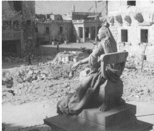
41. Queen Victoria statue, from Manduca, The Bonham-Carter Diaries

Complacent Victoria may have been but, as this extraordinary photograph shows, she was still sitting there when the Grand Palace to her right, the square in front of her, and the building opposite were bombed on Sunday 15 February 1942, and rubble strewn at her feet (Chapter 15). The long-established Caffè Cordina is a good place for people-watching and for the less nimble to settle with a book and a mini bottle of prosecco.