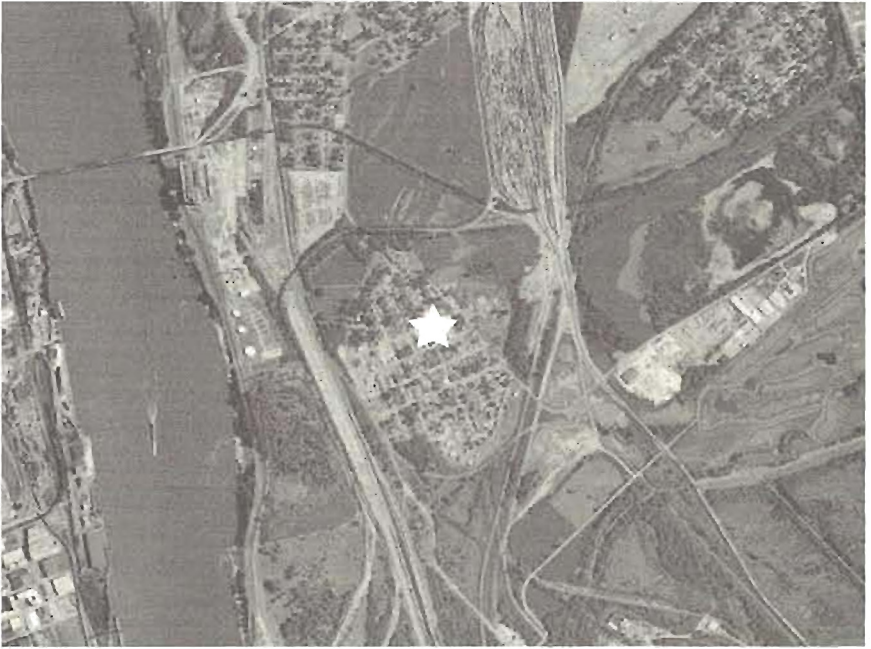
Aerial view of the Brooklyn area today, with the Mississippi River on the left (to the west) and the central residential area of Brooklyn marked by a star.