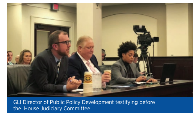
GLI Director of Public Policy Development testifying before the House Judiciary Committee