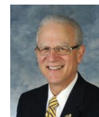
Senator Ernie Harris