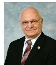
Senator Mike Nemes