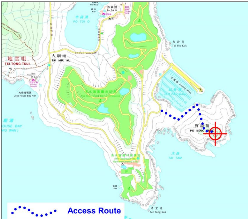
LOCATION MAP (Scale 1:20000)