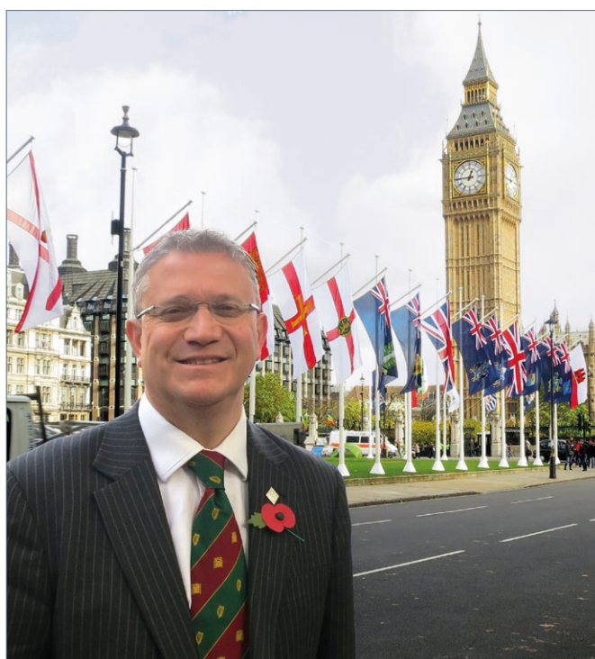
Andrew Rosindell MP in Parliament Square with the flags of the Overseas Territories and Crown Dependencies

I have no doubt that the Flag Institute's work on our flag will become the point of reference in years to come.