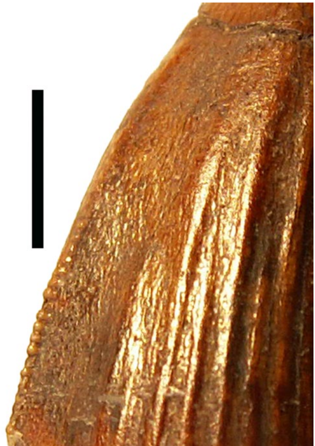
Fig. 2 - Close-up of lingual face of holotype of Ostafrikasaurus crassiserratus , MB.R. 1084, showing large serrations, finely wrinkled enamel and ribbing. Scale bar: 10 mm.