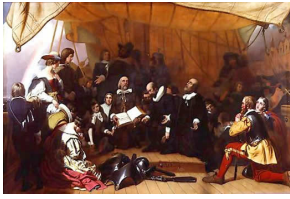
Figure 1. During the reigns of James I and Charles I, Puritans could not worship freely in England. Some migrated to America and founded Massachusetts Bay Colony (the American Puritans of history textbooks) and Plymouth Colony (the “Pilgrims”).

Eventually, civil war broke out. Supporters of Parliament, led by Puritans, raised an army, defeated the king’s forces, and executed him in 1649. The Puritans believed in a radically simple form of worship and an equally simple form of government. In place of the monarchy, they established a commonwealth — a republic ruled by an elected Parliament. But the civil war led to chaos, with factions continually fighting one another. For a time, England was ruled by a “Lord Protector,” Oliver Cromwell — essentially, a military dictator.