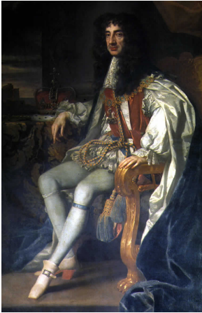
Figure 3. Charles II of England.

When Charles II took the throne in 1660, he wanted to reward men who had stayed loyal to him during his exile. Eight of them requested land in America and received a huge tract of land: all the land between 31° and 36°N from the Atlantic to the Pacific Ocean. Two years later, the grant was extended to include the Albemarle region already settled by Virginians as well as additional territory south into Florida — including the Spanish town of St. Augustine. Charles I had named the region Carolana , after the Latin form of his own name; his son now renamed it Carolina.