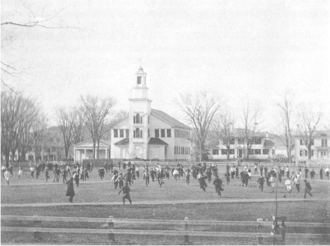
Players run toward the western goal, off the left edge of the photograph, in a football match of 1874.