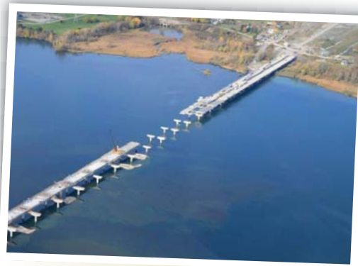
Aerial view of the North shore of the St. Lawrence Bridge.

We thank you for your interest in the completion of Autoroute 30.