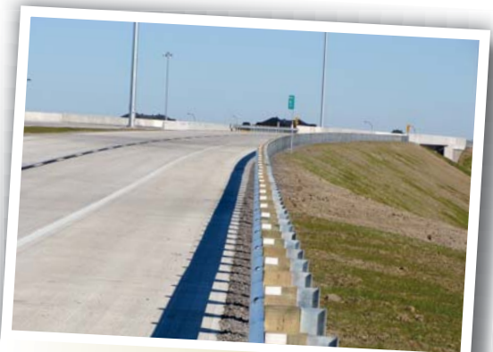
Jean-Leman segment: Autoroute 30 West overpass.

Remember that the final segment is still under construction. The western section of Autoroute 30 from Vaudreuil-Dorion to Châteauguay, built in a public-private partnership with Nouvelle Autoroute 30, S.E.N.C., should be completed for December 2012.