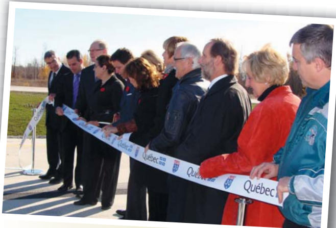
Cutting of the ribbon in the company of the Members and mayors of the region.