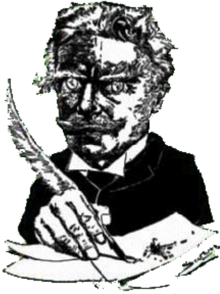
Caricature of Ambrose Bierce (circa 1900)