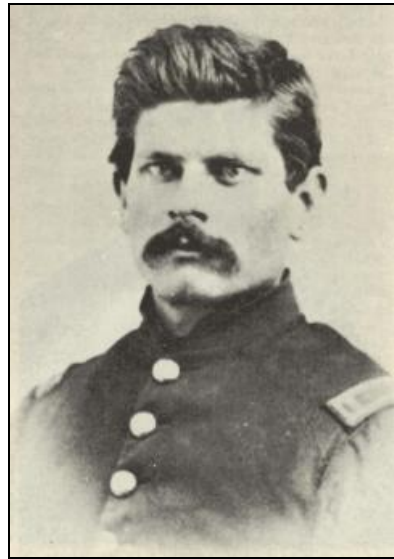
Ambrose Bierce as a young officer

Driving Stand #1 – Pittsburg Landing: The driving tour begins at the bottom of the bluff on the site of Pittsburg Landing. This is also Tour Stop #1 of the Shiloh National Military Park driving tour.