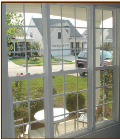
Acoustical Window Inserts.