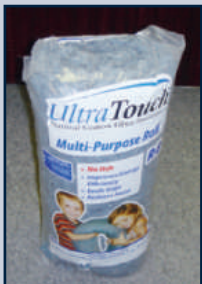
UltraTouch Multipurpose Roll.