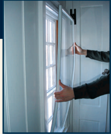
Attachments Made Easy.

Many other competitive retrofit window products require a permanent secondary layer, which we feel is restrictive and excessive. Because of its unique magnetic attachment method, the Noise S.T.O.P. Climate Seal™ Acoustic Series Window Insert is easily removed in seconds for access to the window for cleaning or maintenance. Reattaching the window