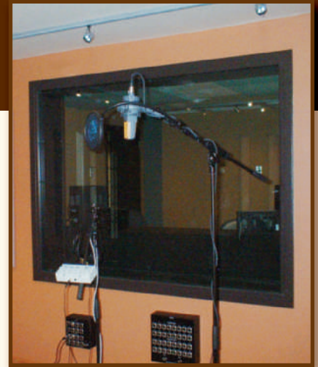
Studio 6 Installed.