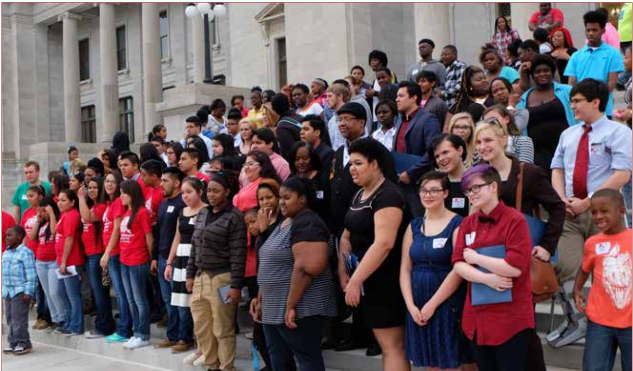
CFC Youth Advocacy Day 2015.