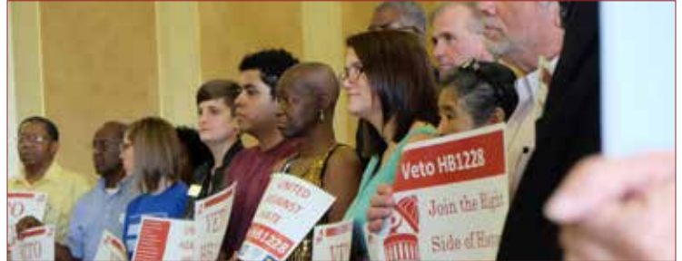
CFC press conference against HB1228.

Adds to the non-discrimination provisions of the Arkansas Civil Rights Act the right to be free from discrimination because of sexual orientation or gender identity.