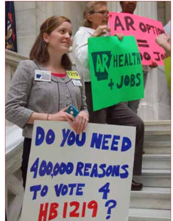
600 people from organizations across the state gathered at the Capitol in 2013 to support health care expansion.