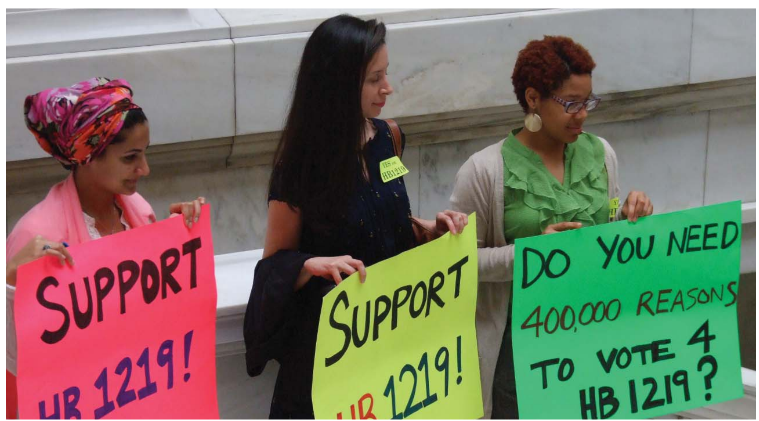
Supporters of helth care expansion, which would save lives, help small businesses and rural hospitals, and create 6,200 new jobs.