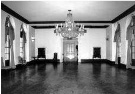
living room, 1990