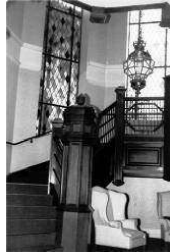
main staircase, 1990