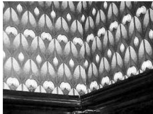
wallpaper replacement of Hunt Room friezes, 1990