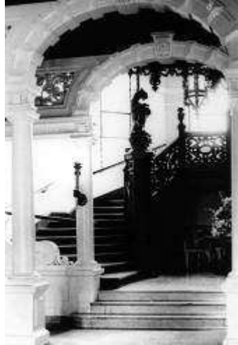
main staircase, c. 1903

men's smoking lounge, c. 1903 William Kissam