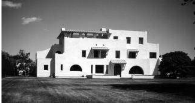
front facade, 2006