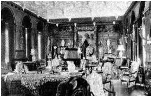
living room, c. 1903