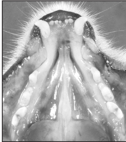
Figure 19-2. Maxillary dentition and hard palate of a cat (Left). Mandibular dentition and sublingual mucosa of the same cat (Right). These photographs demonstrate tooth anatomy associated with a carnivorous eating behavior. The canine teeth are slightly curved and taper to a pointed tip suitable for grasping and puncturing prey. The premolar and molar teeth are conical and sharply pointed, making them suitable for shearing and tearing flesh. There are no grinding (flat, table) surfaces present. (Adapted with permission from Harvey CE, Emily PP, eds. Function, formation, and anatomy of oral structures in carnivores . In: Small Animal Dentistry . St. Louis, MO: Mosby-Year Book, 1993.)

that can affect preferences throughout life. Cats accustomed to a specific texture or type of food (i.e., moist, dry, semi-moist) may refuse foods with different textures. This becomes an important consideration when feeding cats novel foods.