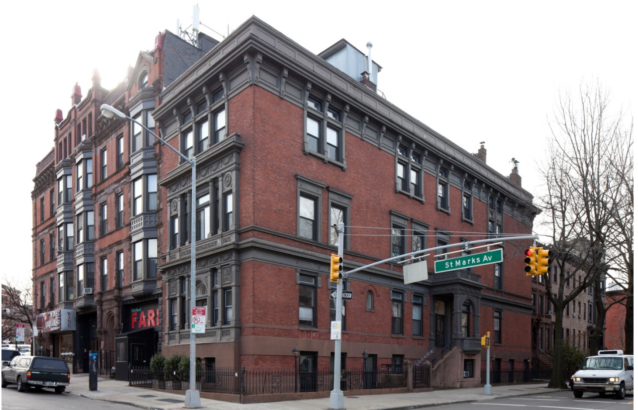
Illustration 9: The Carlton Club, 85 6 th Avenue, built 1890, Mercein Thomas architect, Renaissance Revival style. Photo: Donald G. Presa, 2015