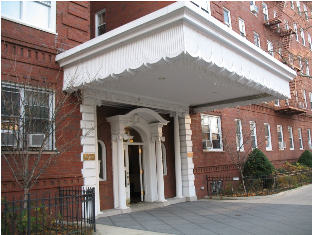
Illustration 11: 25 Plaza Street West, built 1941, architect not determined, Colonial Revival style.