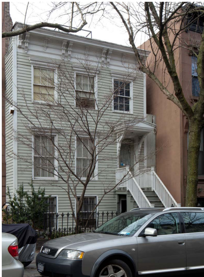
Illustration 3: 22 Berkeley Place, built c.1850-69, architect not determined.