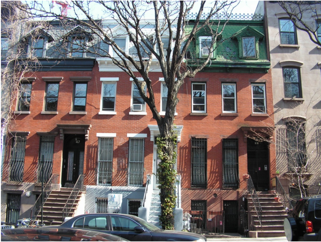
Illustration 2: 47 to 51 St. Marks' Avenue, built 1874-75, architect not determined, Second Empire style.