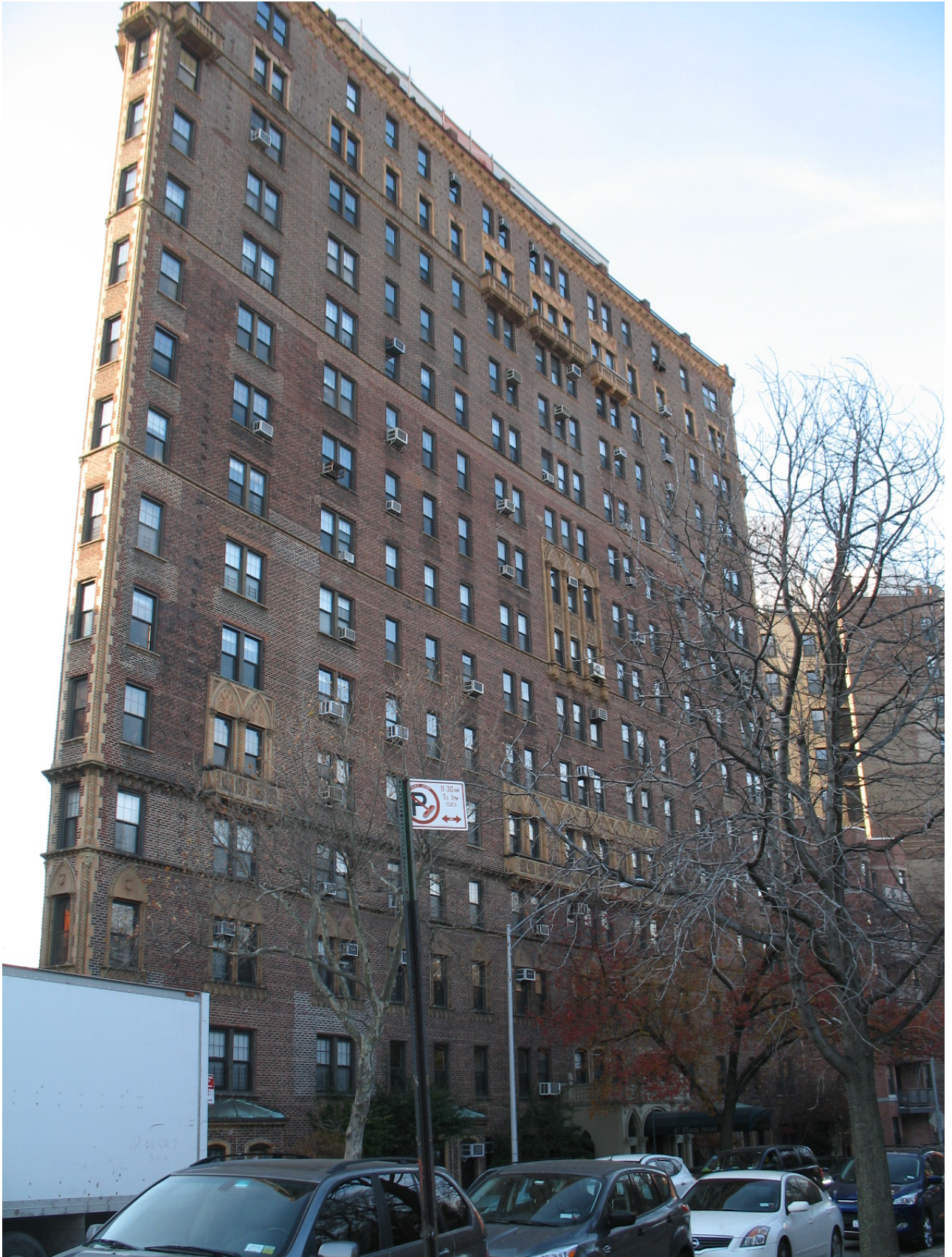
Illustration 12: 47 Plaza Street West, built 1927, Rosario Candela architect, Medieval Revival style.