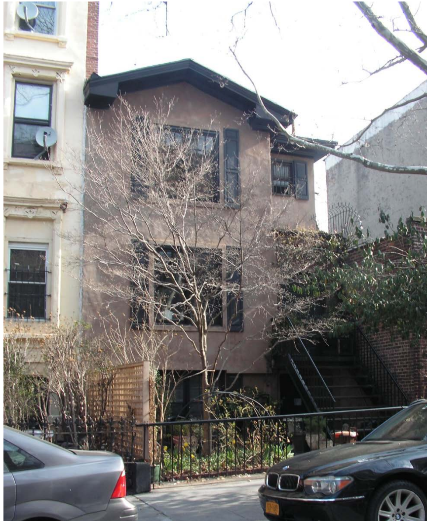
Illustration 4: 85 Sterling Place, built c.1869-80, architect not determined.