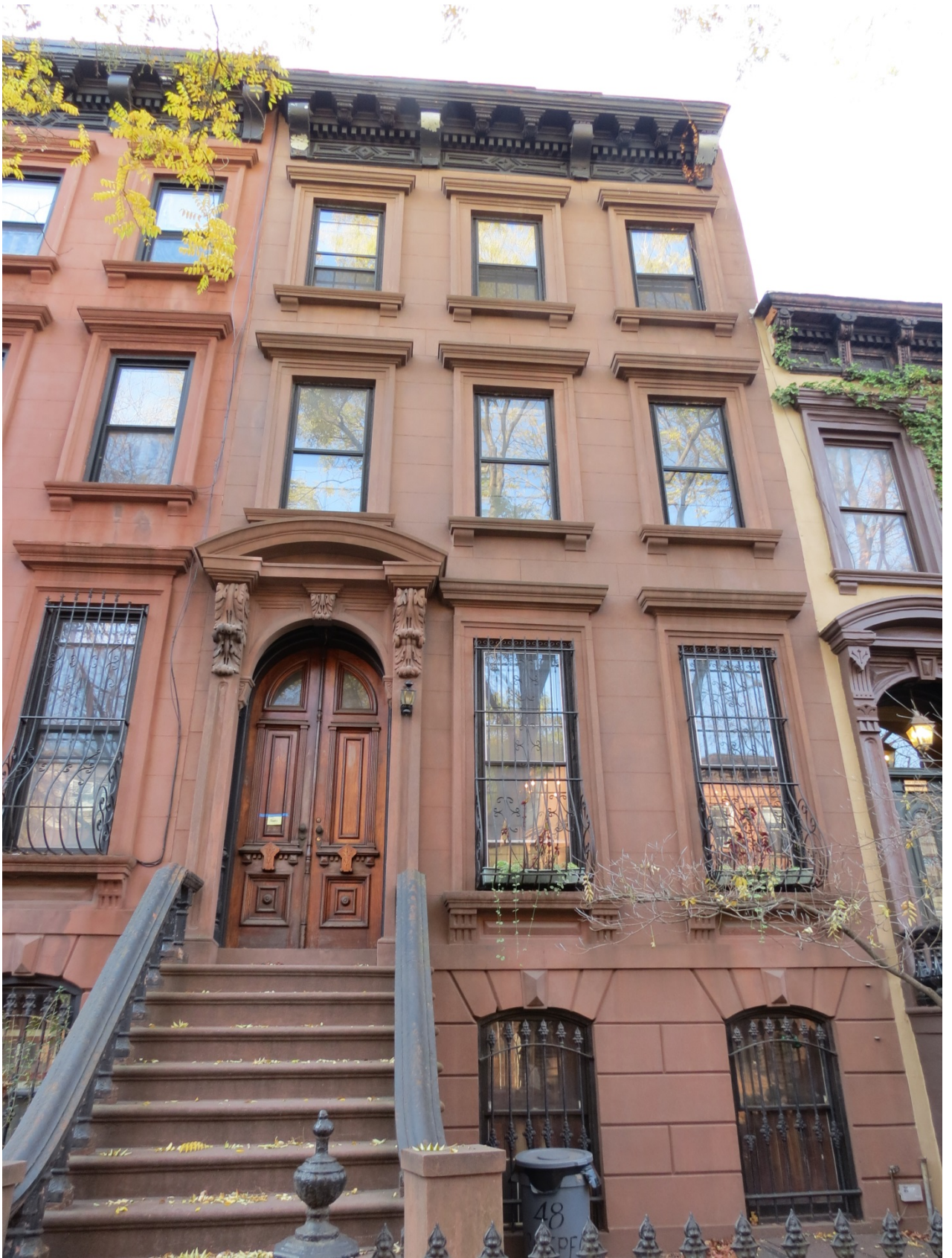
Illustration 1: 48 Prospect Place, Italianate style, built in the 1870s, architect not determined. Photo: Jessica Baldwin, 2016