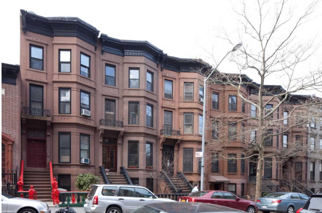
Illustration 5: 52 to 62 Sterling Place, built 1883, Cevdora B. Sheldon architect, neo-Grec style.