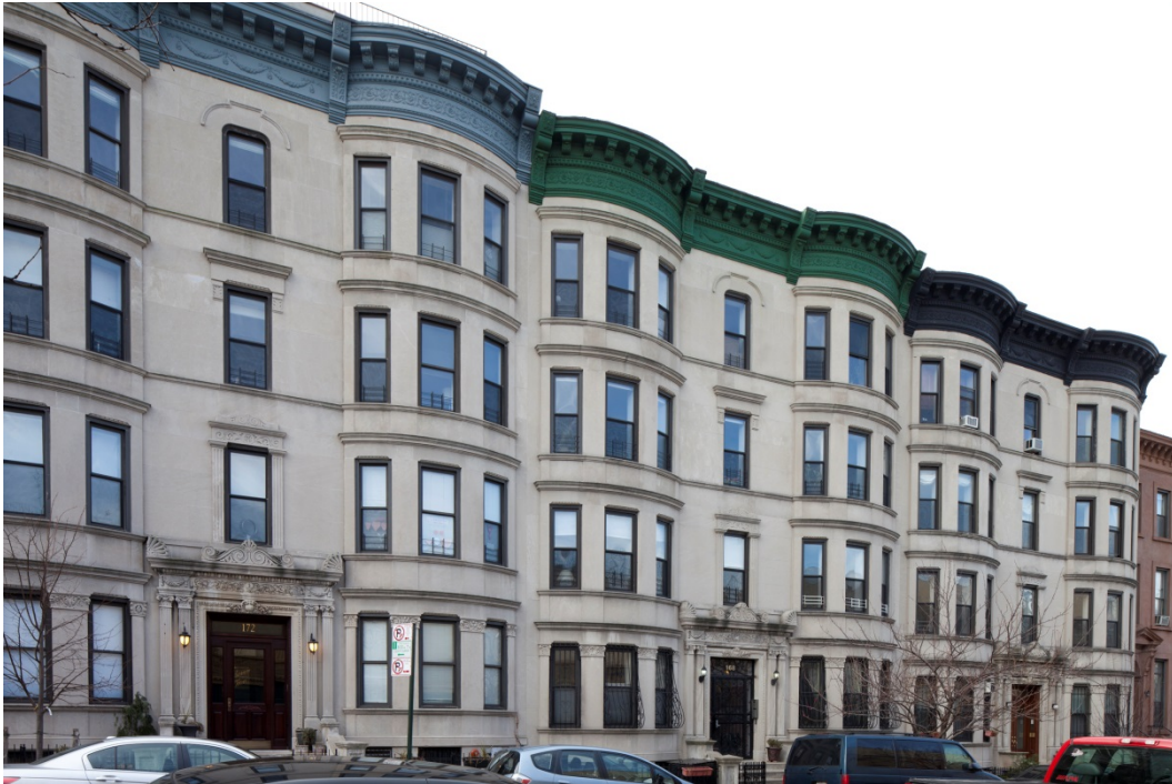
Illustration 10: 166 to 180 Sterling Place, built 1906, Henry Polhmann architect, Beaux Arts style. Photo: Donald G. Presa, 2015