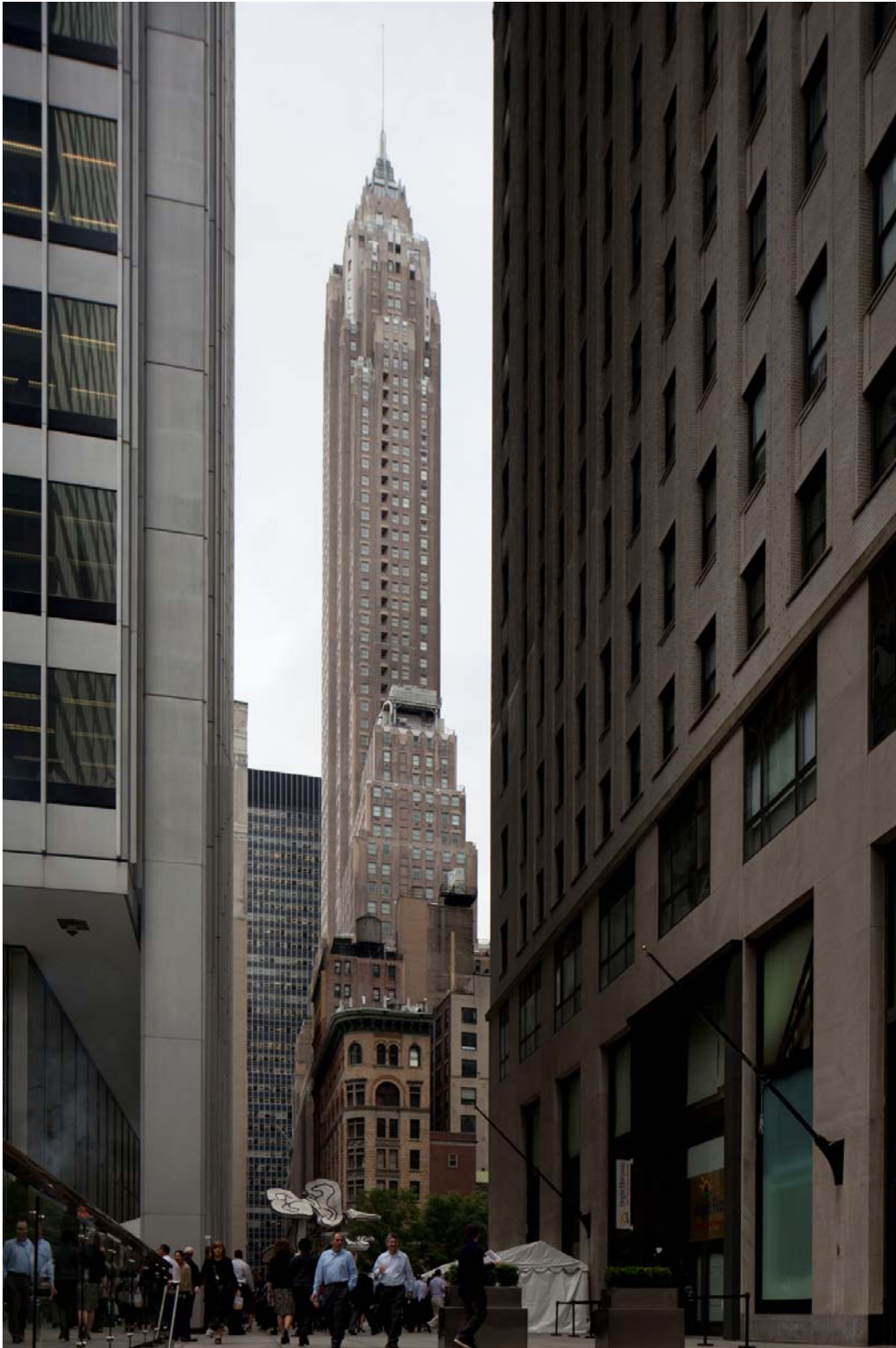
Cities Service Building 70 Pine Street (aka 66-76 Pine Street, 2-18 Cedar Street, 171-185 Pearl Street) Borough of Manhattan Block 41, Lot 1 West façade from Nassau Street Photo: Christopher D. Brazee, 2011