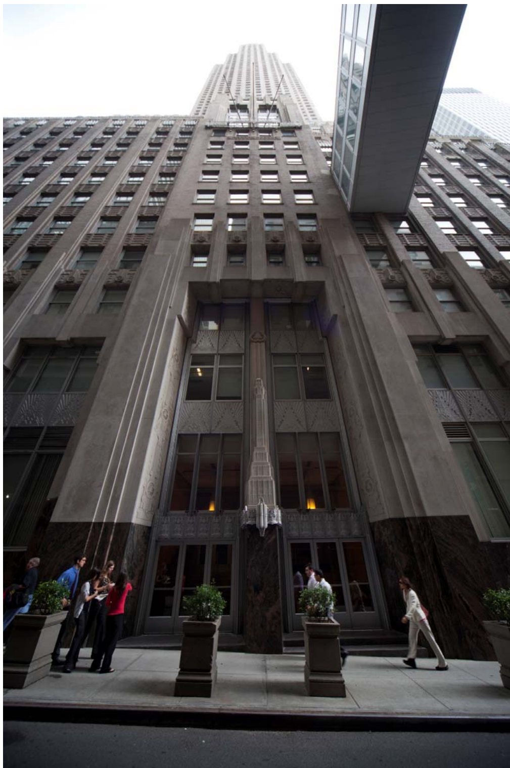
Cities Service Building Pine Street, east entrance