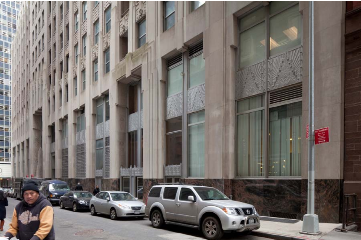
Cities Service Building Cedar Street, view west, view east Photos: Christopher D. Brazee, 2011