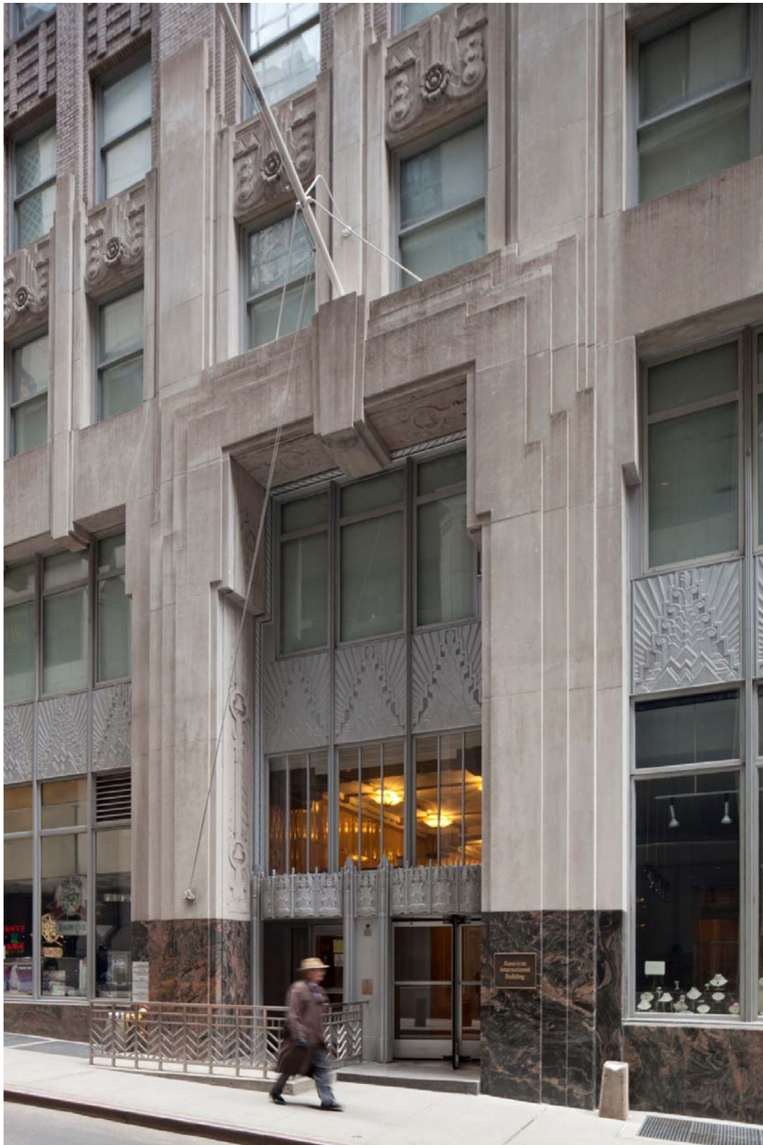
Cities Service Building Pine Street, west entrance portal Photo: Christopher D. Brazee, 2011