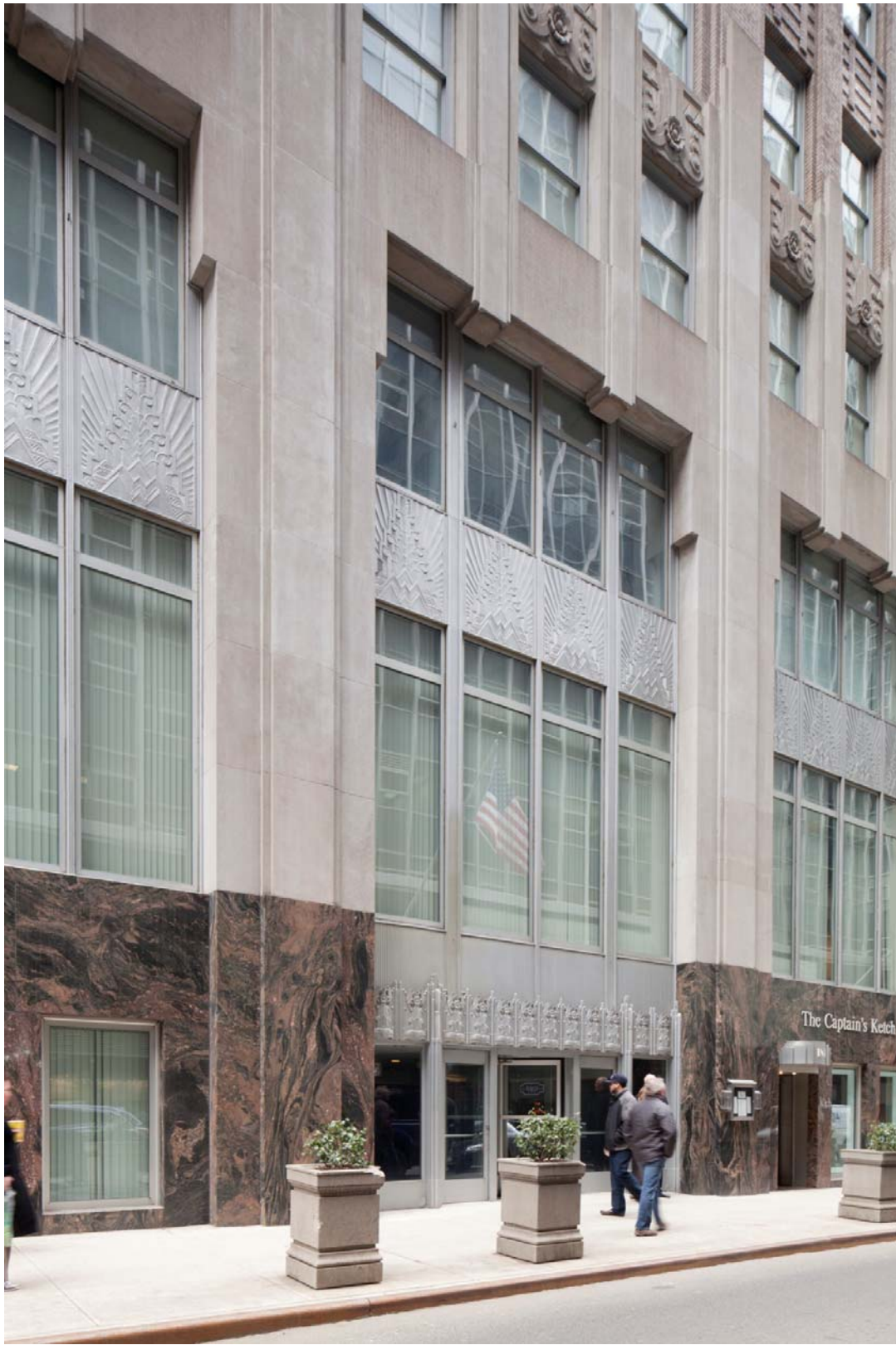
Cities Service Building Pearl Street entrance Photo: Christopher D. Brazee, 2011