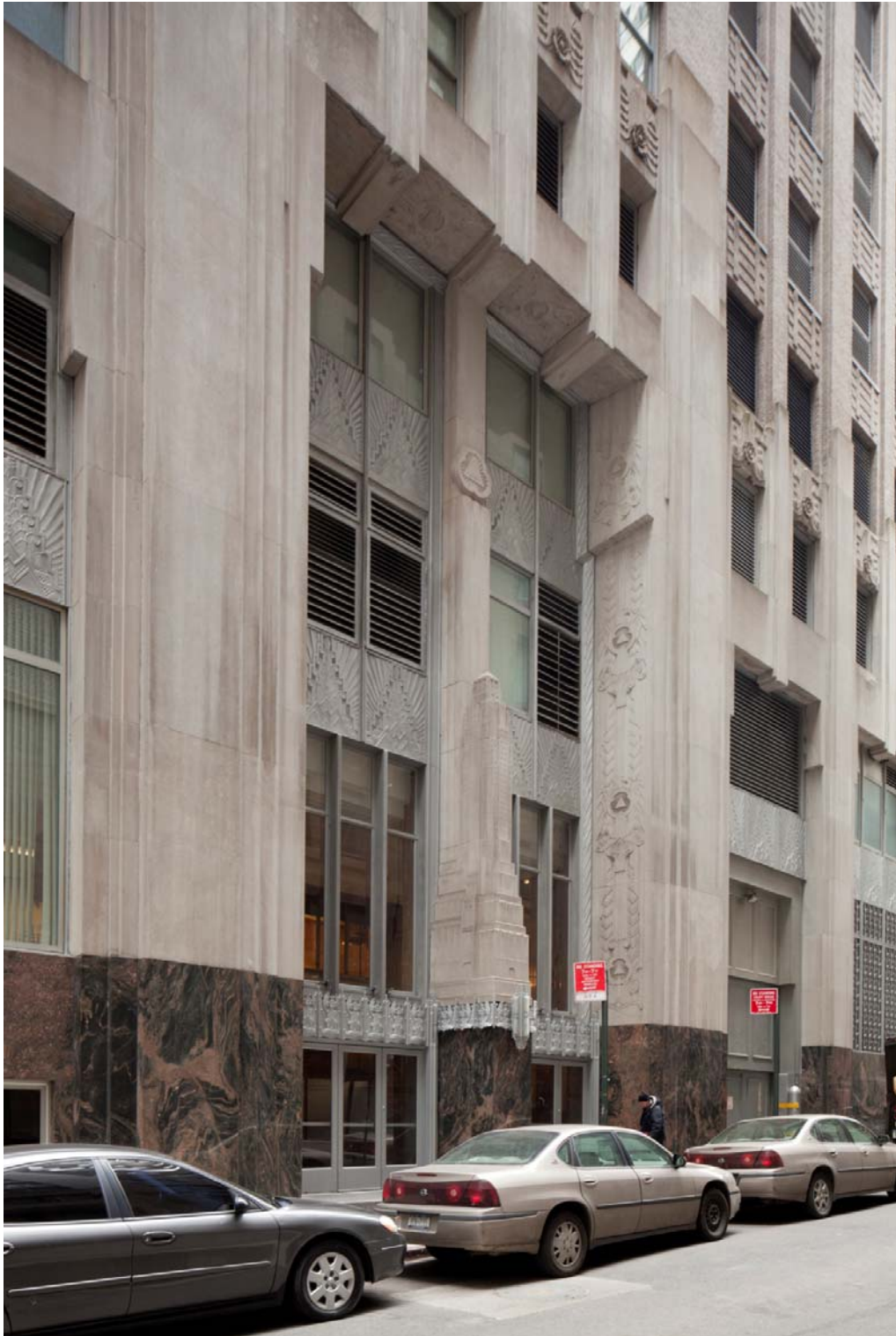
Cities Service Building Cedar Street, east entrance portal