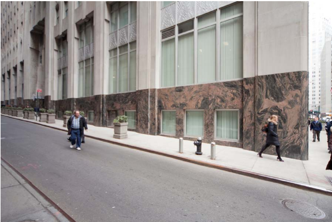
Cities Service Building Pine Street, looking east, looking west Photo: Christopher D. Brazee, 2011