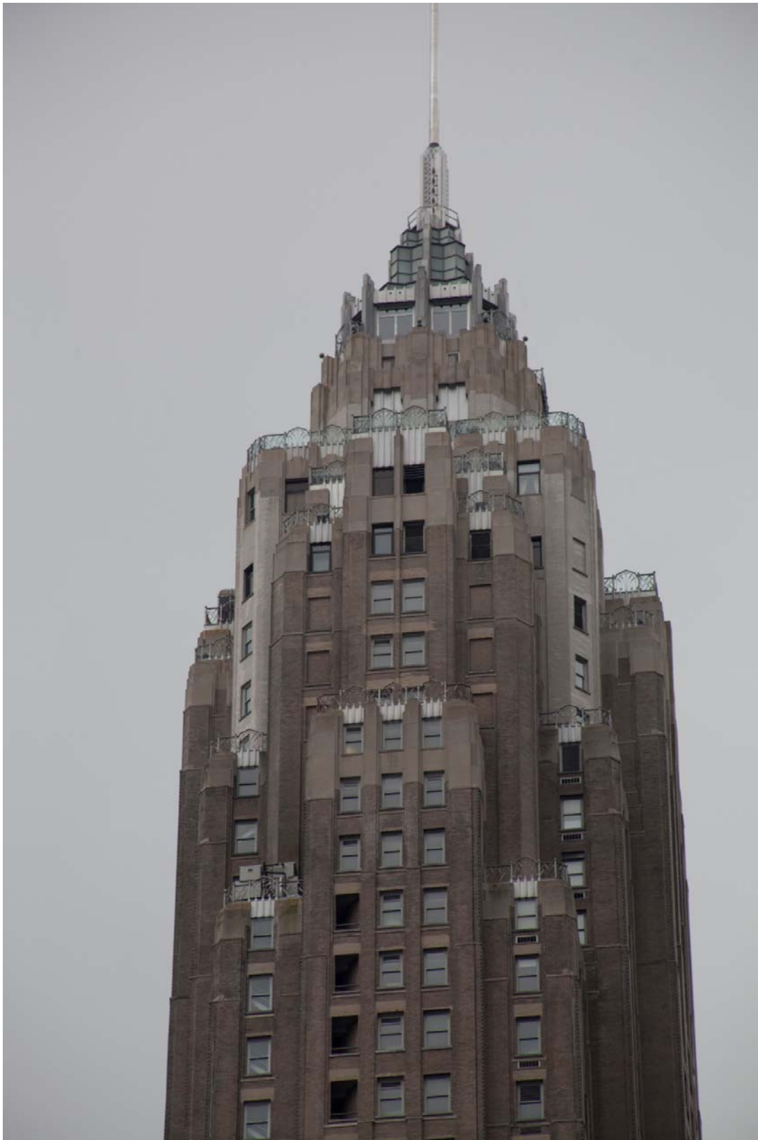
Cities Service Building Spire, west elevation