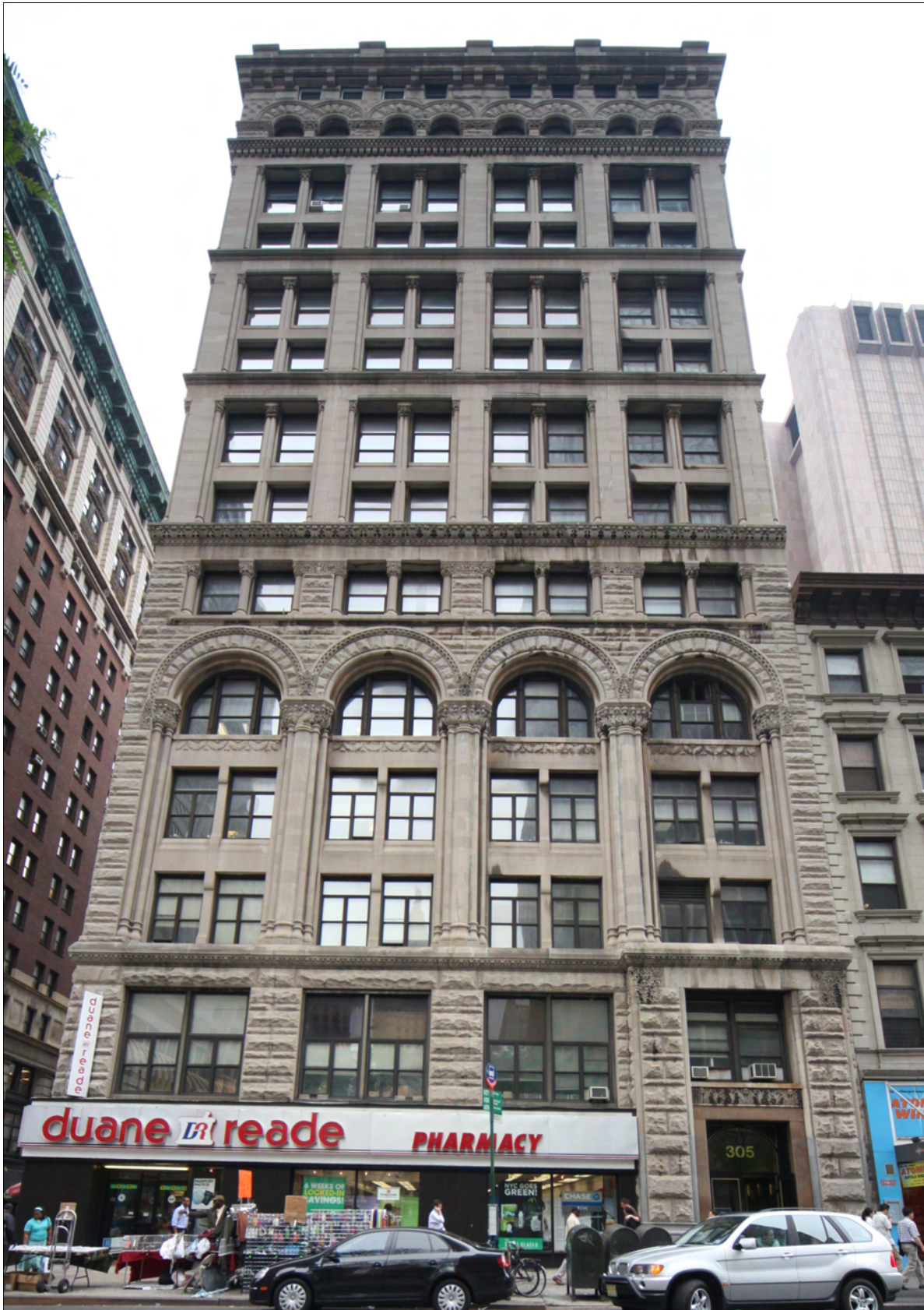
Mutual Reserve Building , Broadway facade