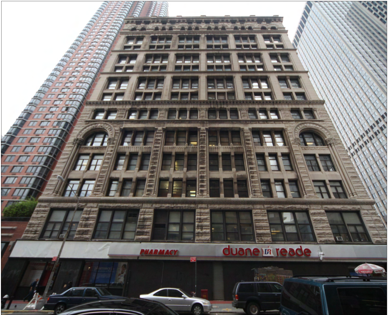
Mutual Reserve Building , Duane Street facade