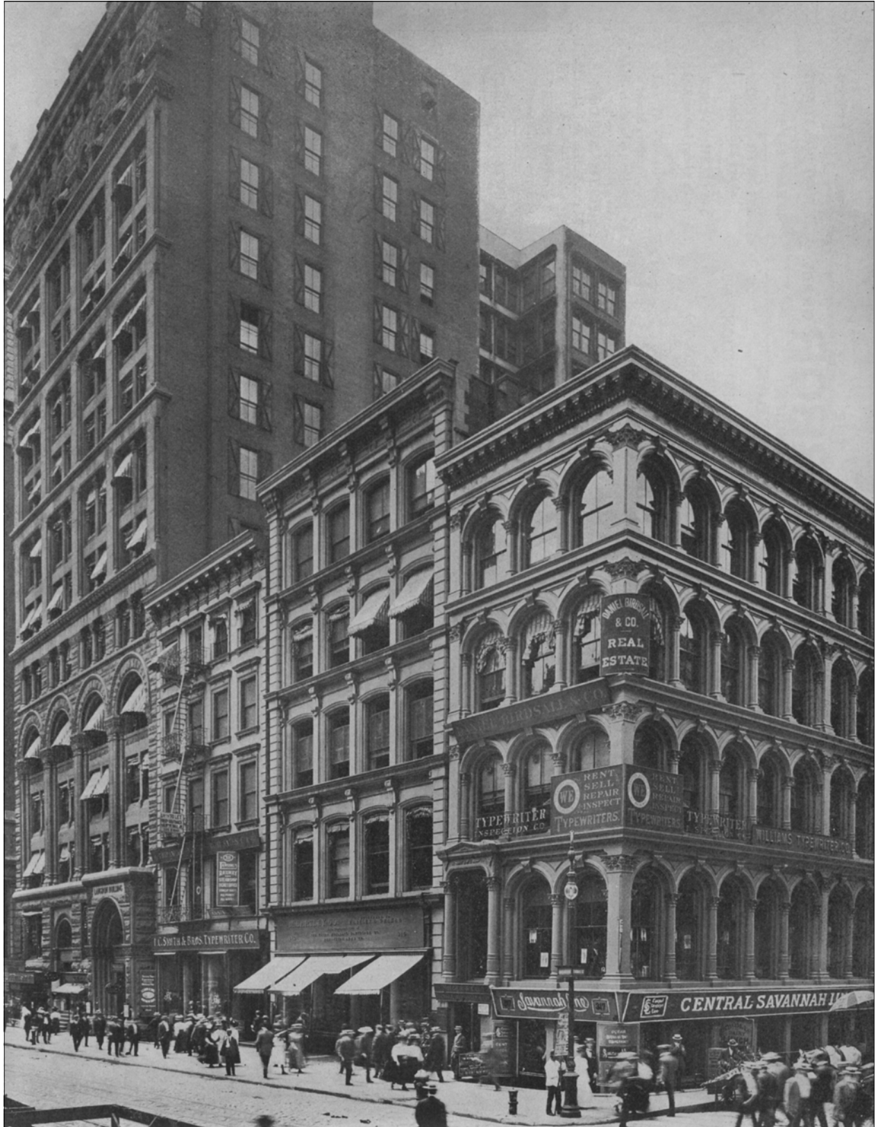
Mutual Reserve Building (left)