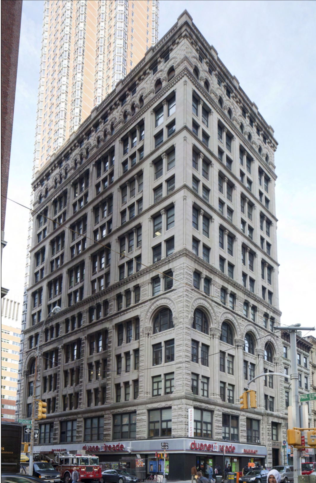
Mutual Reserve Building , 305 Broadway, Manhattan