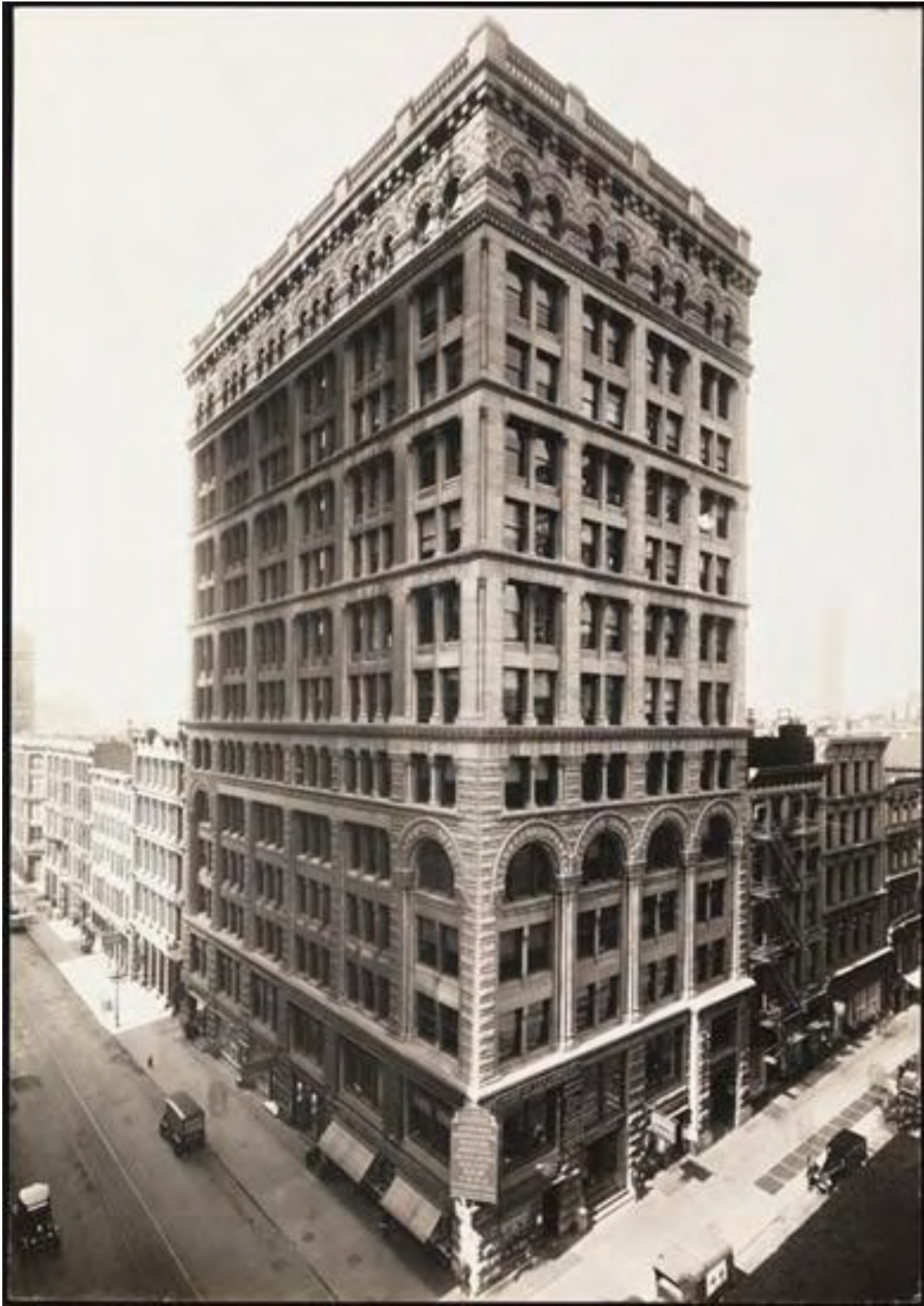
Mutual Reserve Building (later the Langdon Building) (c. 1925)