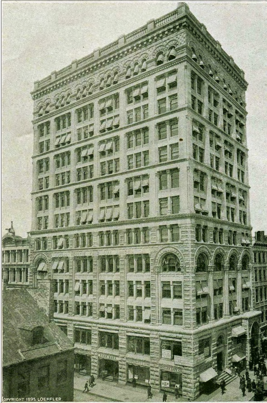
Mutual Reserve Building

Photo: A Few Office Buildings in New York (1895)