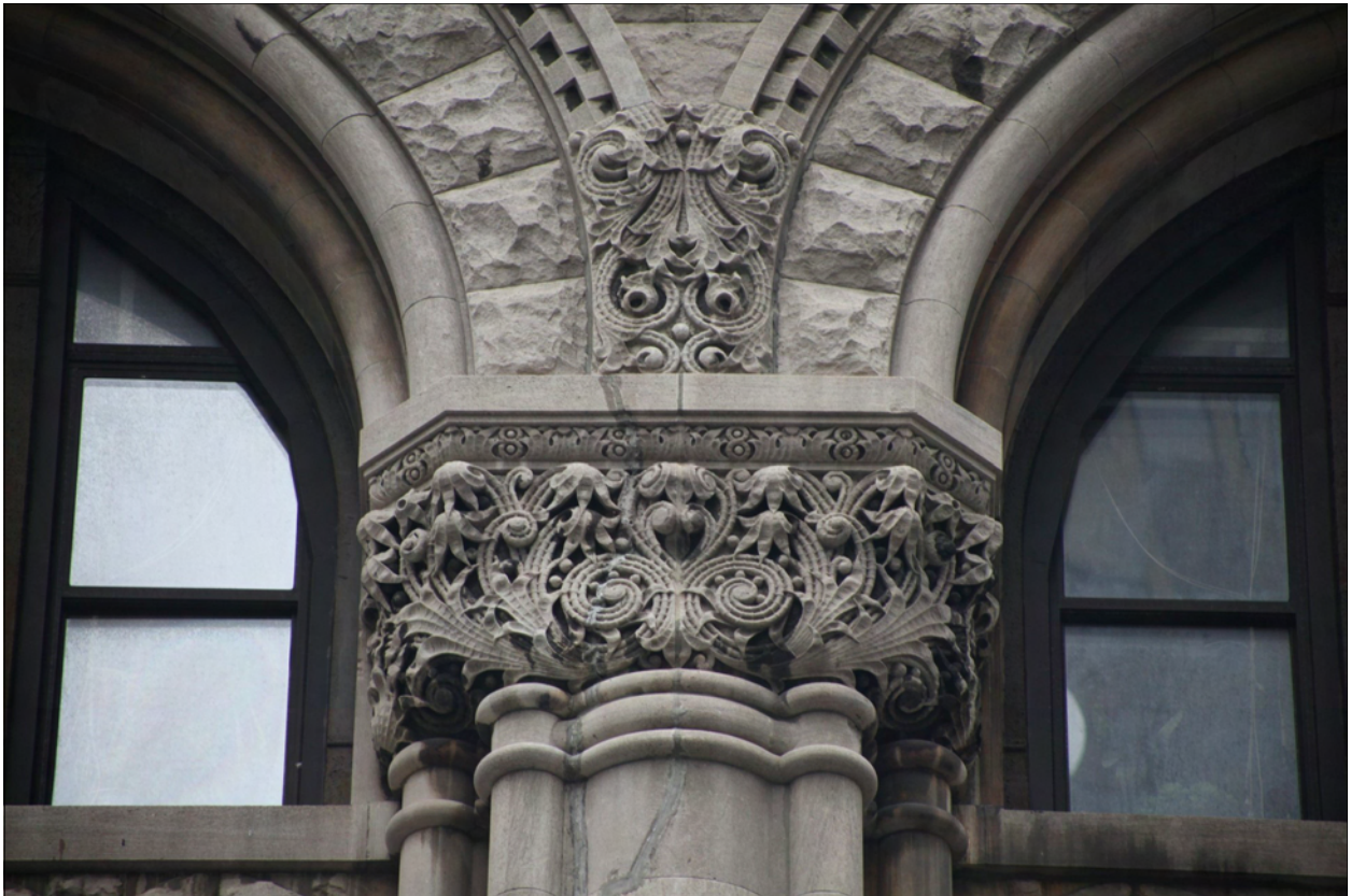
Mutual Reserve Building , ornamental details