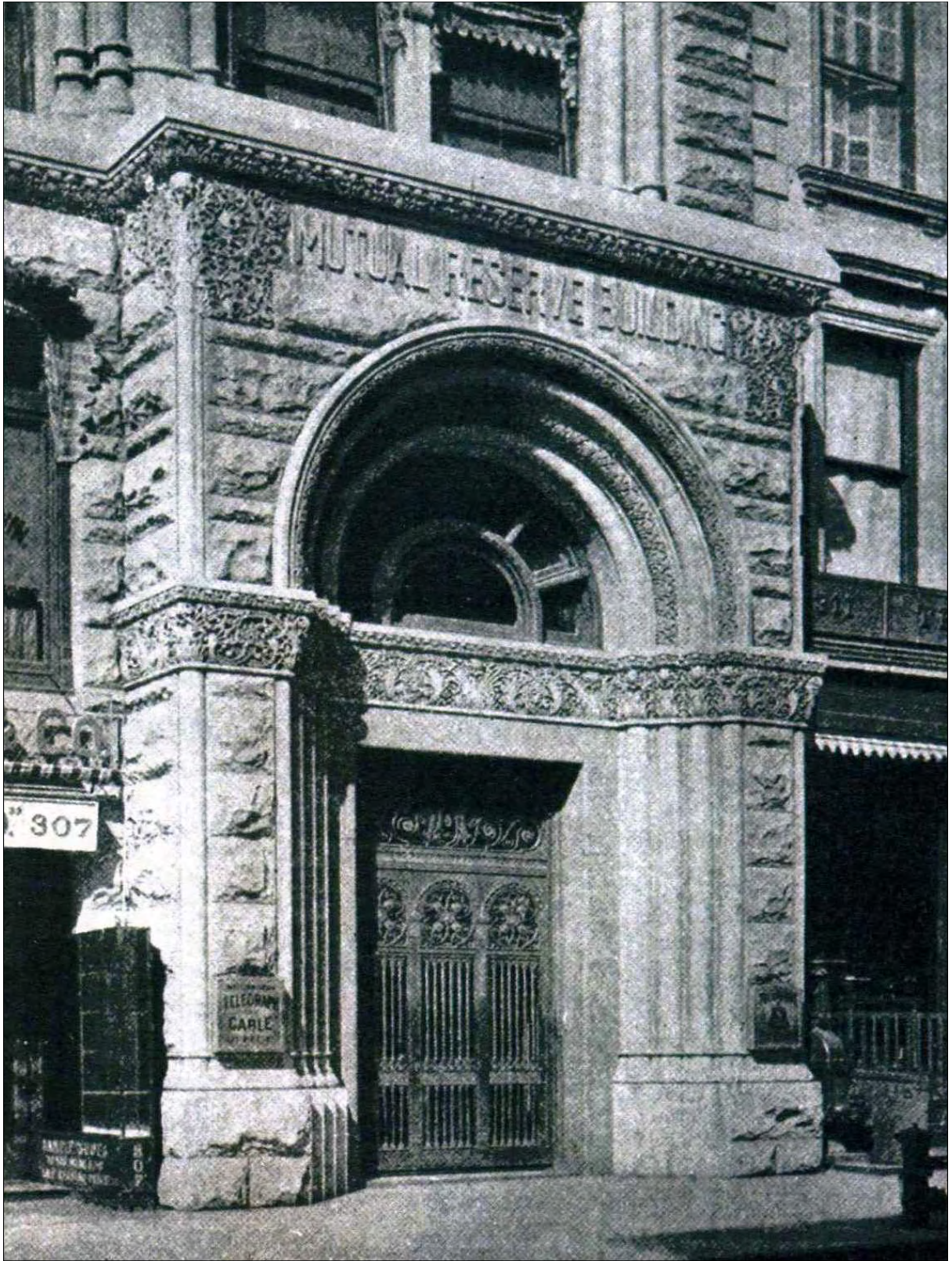
Mutual Reserve Building , original main entrance

Photo: Architecture & Building , March 11, 1899