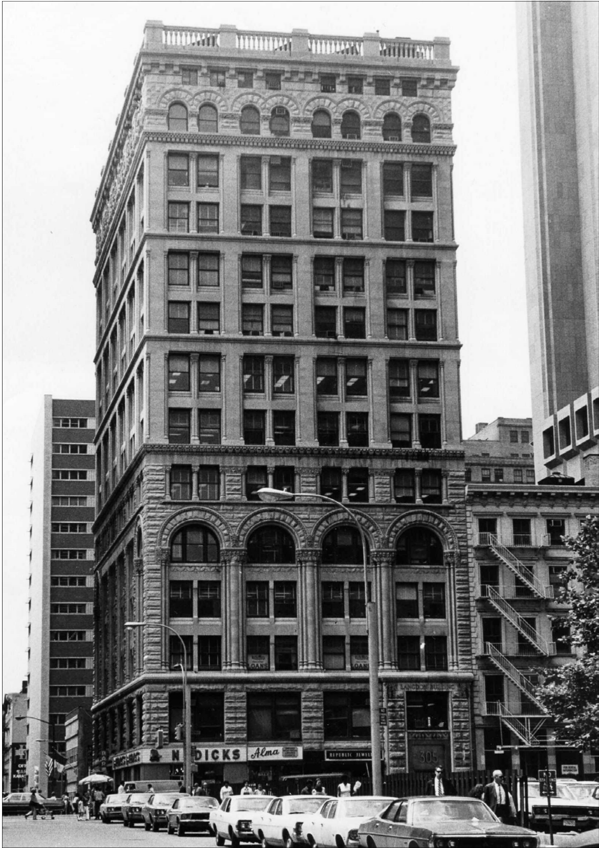
Mutual Reserve Building