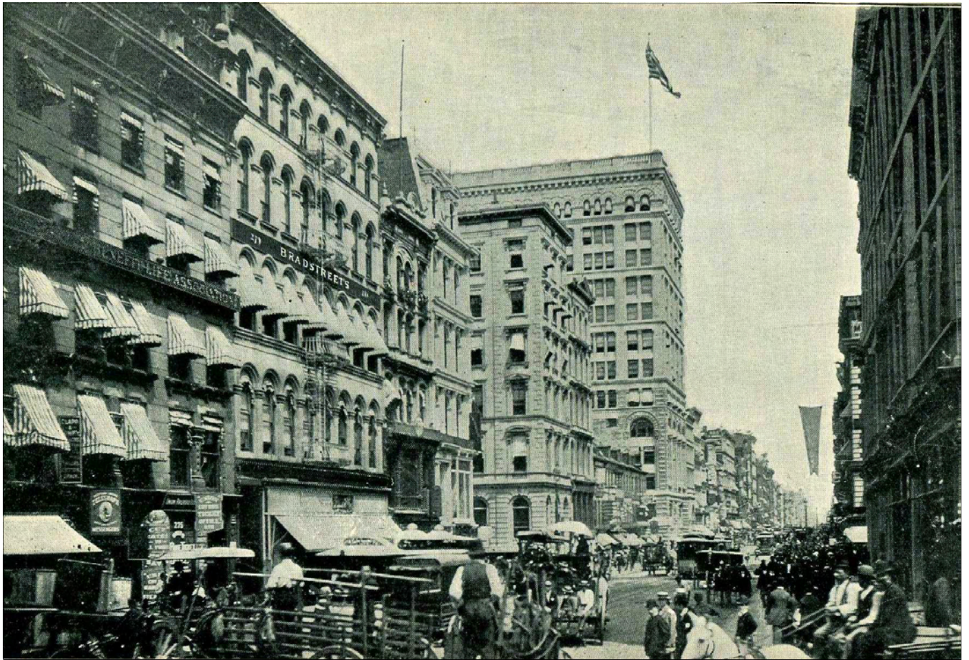
Mutual Reserve Building , shown from Chambers Street