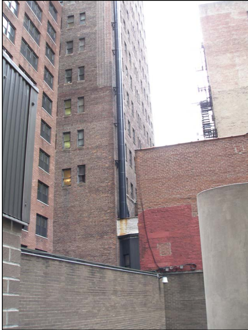
North Elevation: Detail