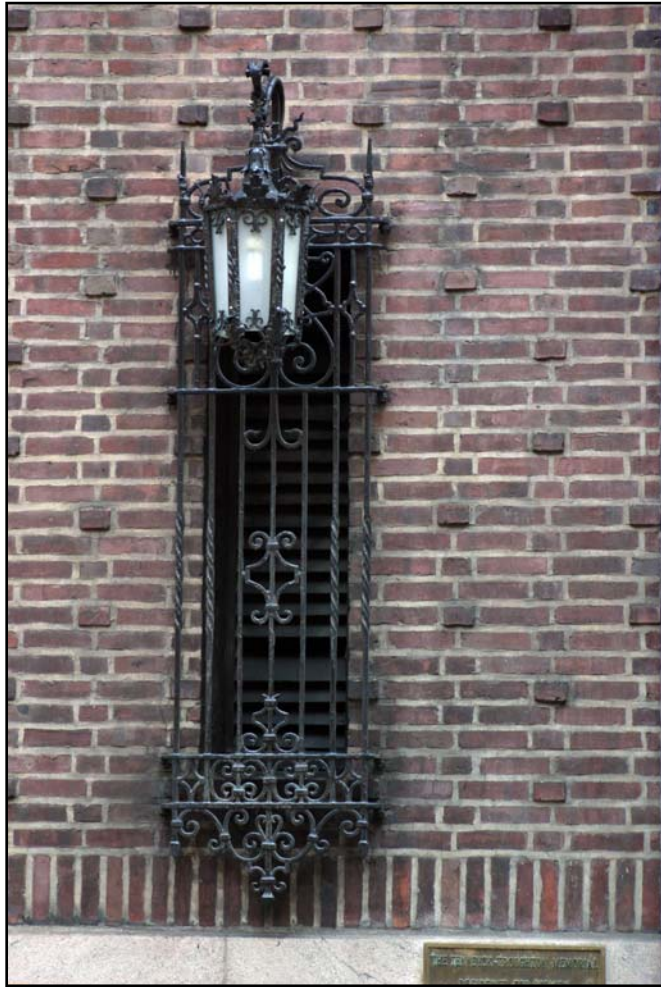
South Elevation: Historic wrought-iron grille/light fixture