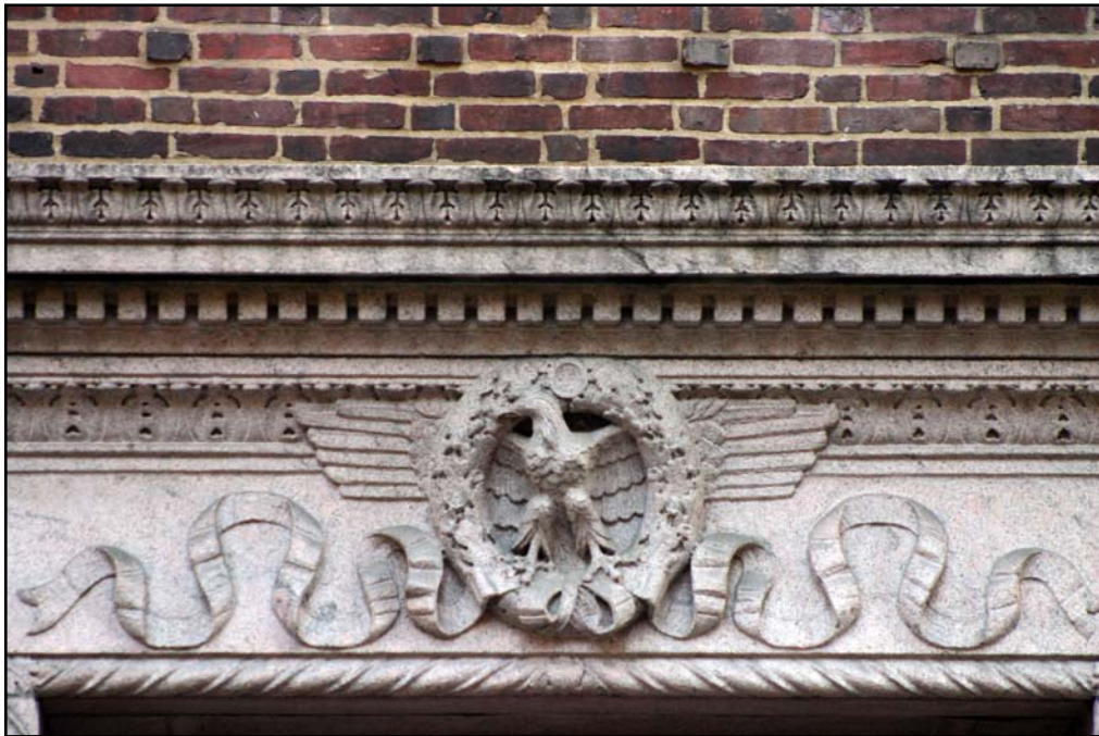
South Elevation: detail