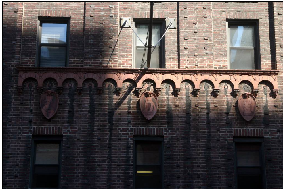
South Elevation: terra-cotta detail