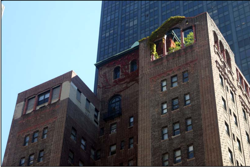
West Elevation: Central tower and roof garden