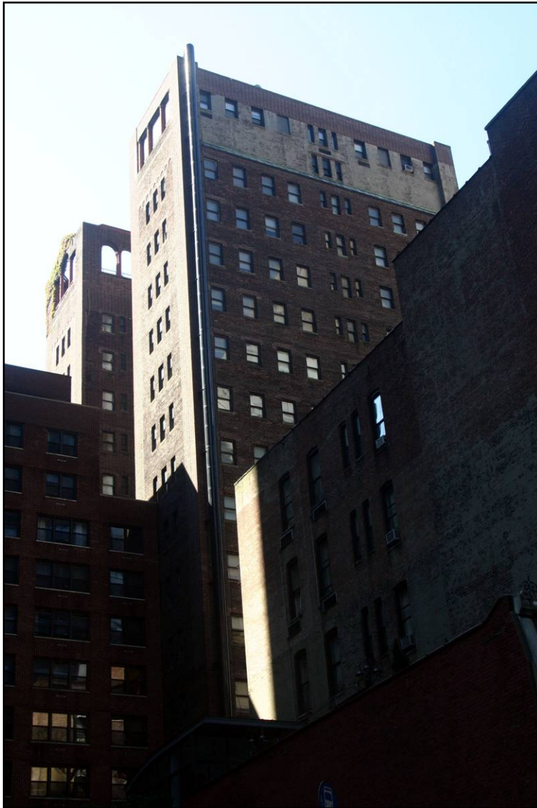
North Elevation