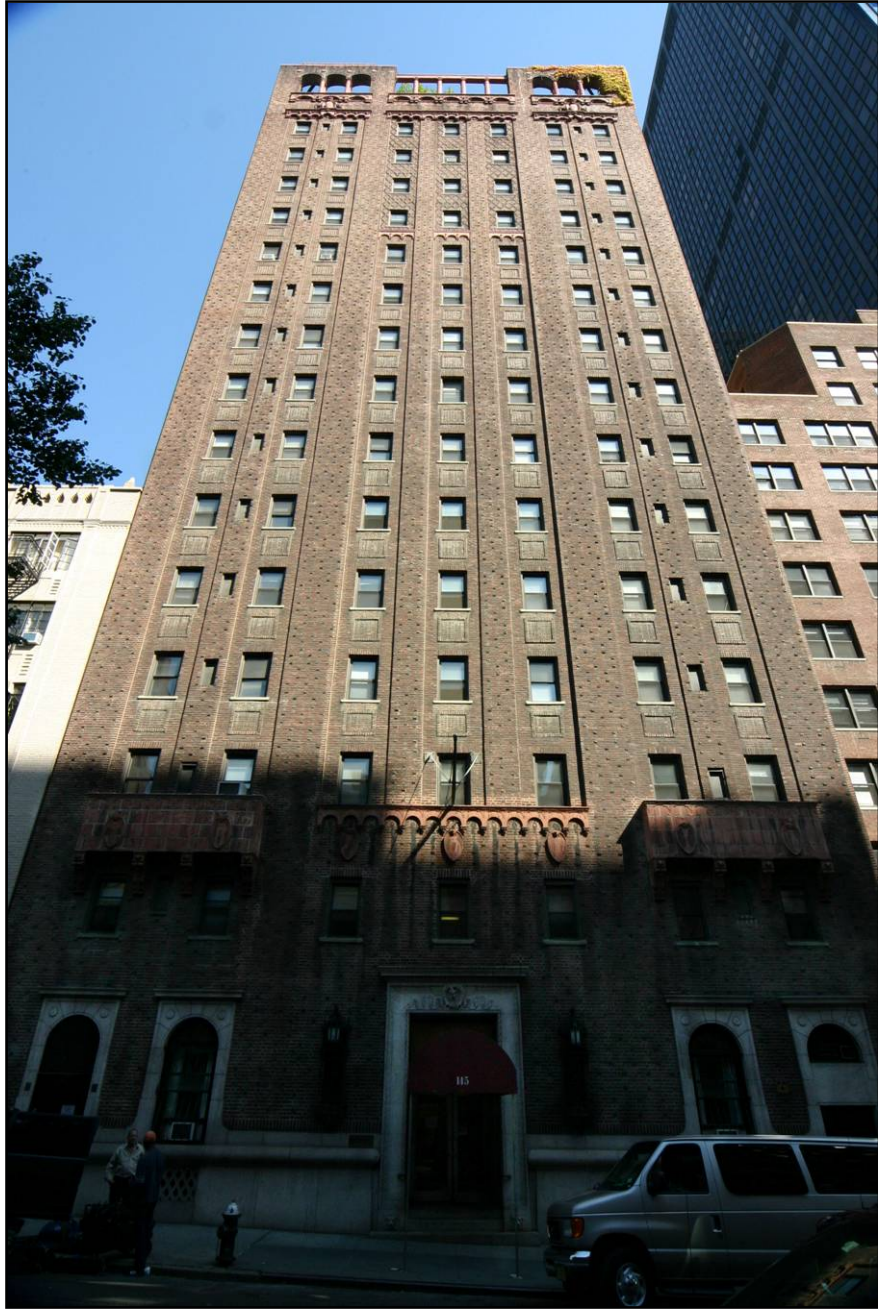
South Elevation 145 East 39 th Street