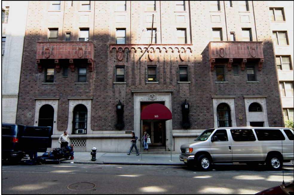
South Elevation 145 East 39 th Street