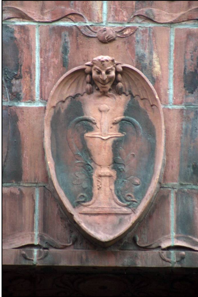
South Elevation: terra-cotta detail