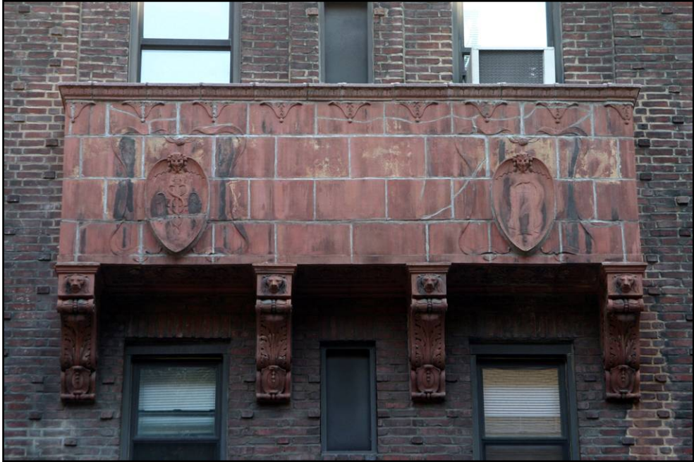
South Elevation: terra-cotta detail