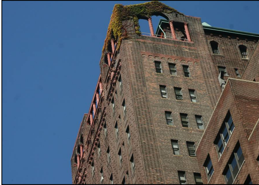
East Elevation: Roof garden and core tower