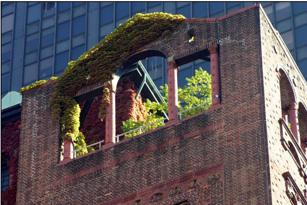
West Elevation: Roof garden