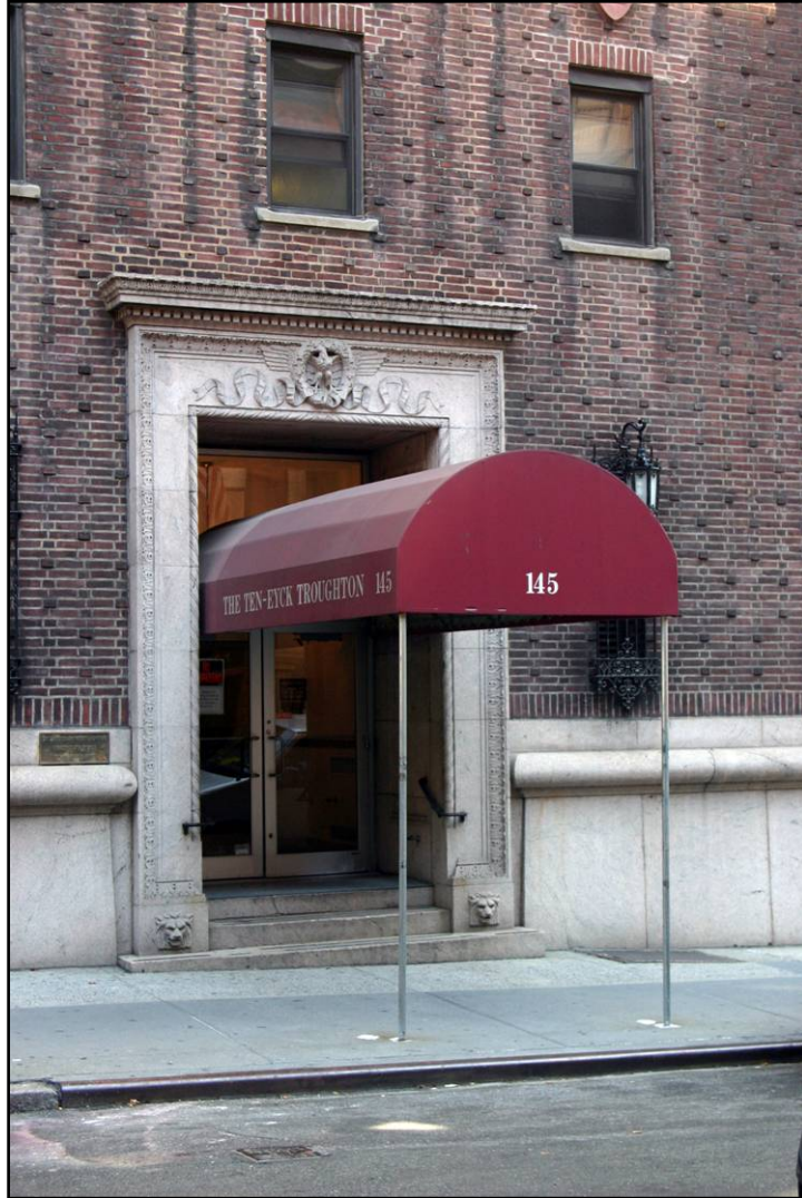
South Elevation: Entrance detail