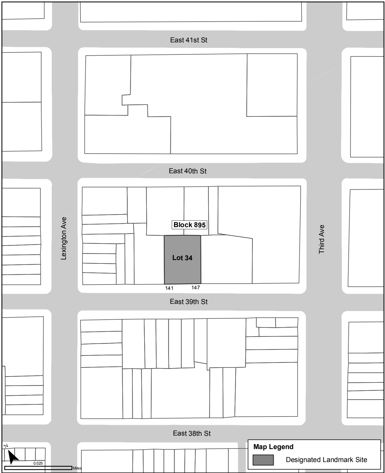
THE ALLERTON 39TH STREET HOUSE (LP-2296), 145 East 39th Street (aka 141-147 East 39th Street). Borough of Manhattan, Tax Map Block 895, Lot 34.