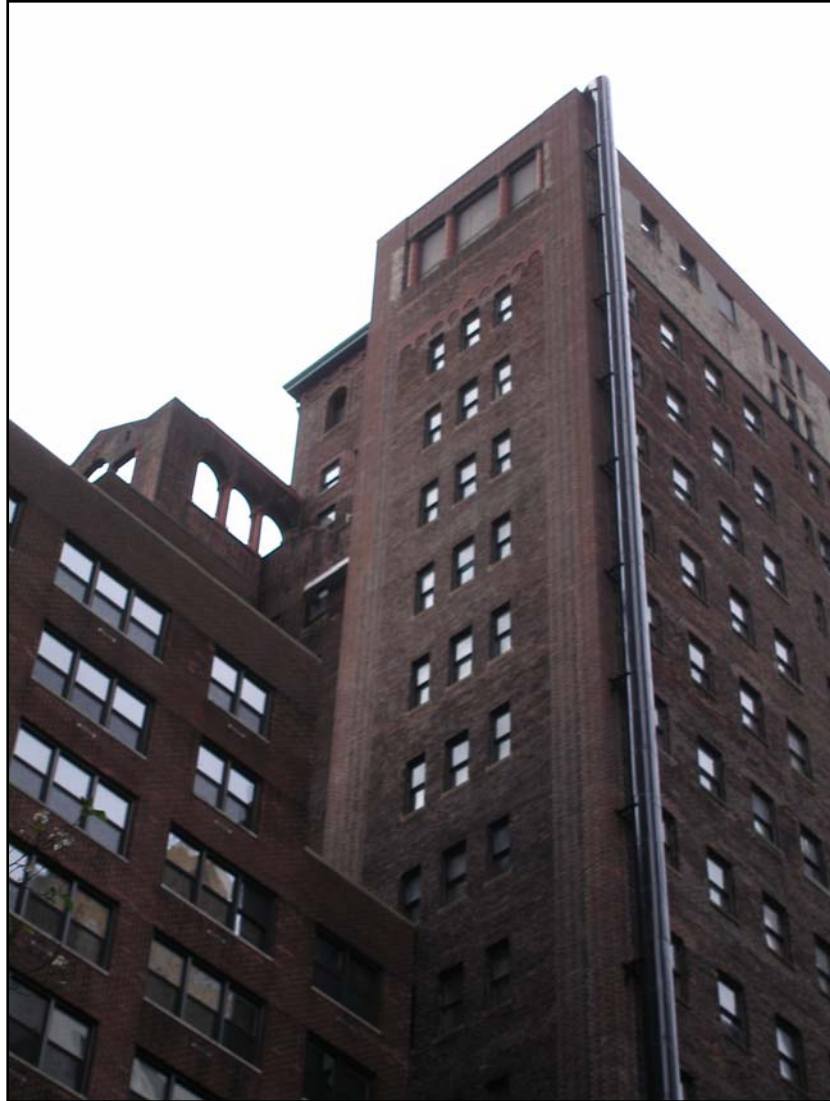
North Elevation: Detail