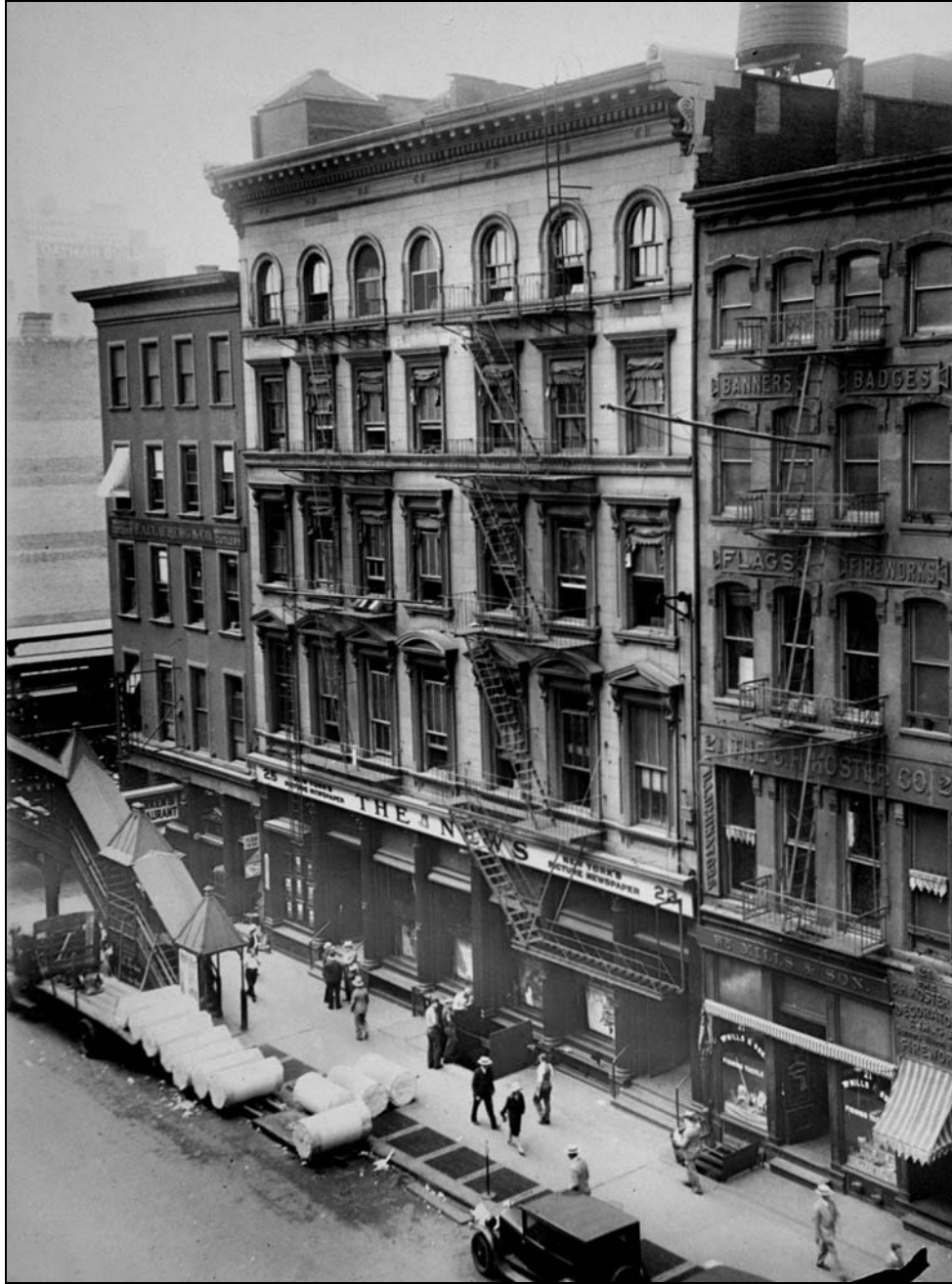
25 and 23 Park Place Buildings, ca. 1920s