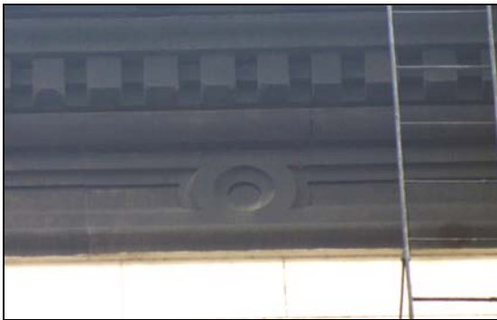
23 Park Place Building , Park Place façade details