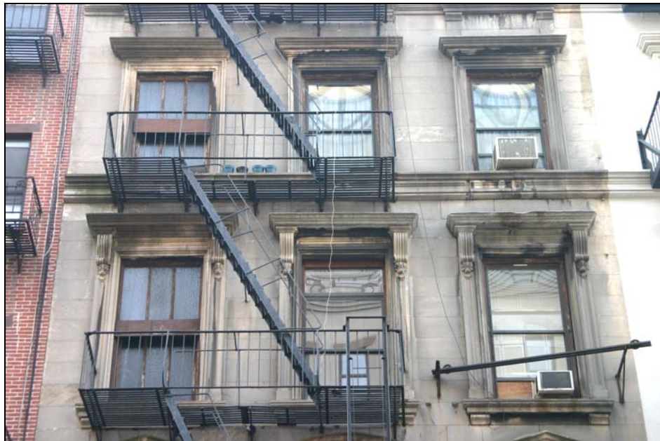
23 Park Place Building , 20 Murray Street elevation, details