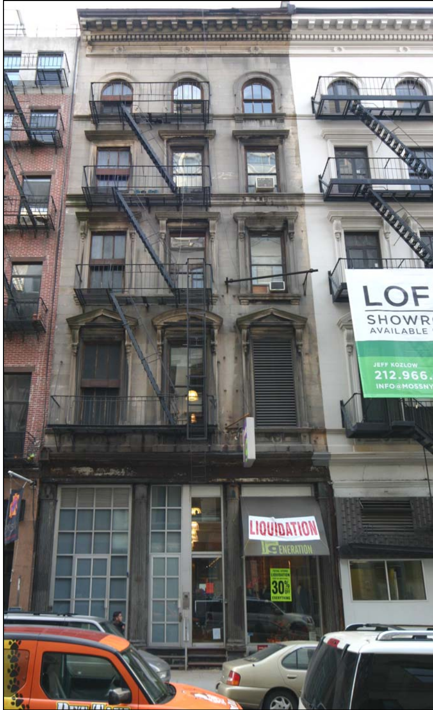
23 Park Place Building , 20 Murray Street elevation