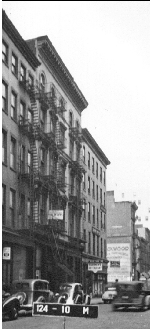
23 and 25 Park Place Buildings, 20 and 22 Murray Street elevations