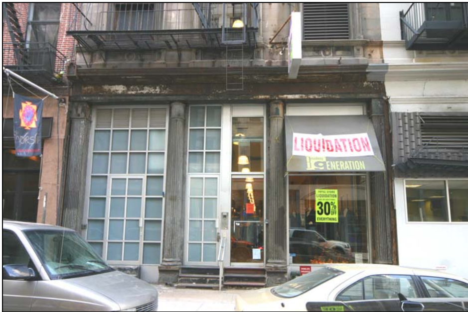
23 Park Place Building , 20 Murray Street elevation, details