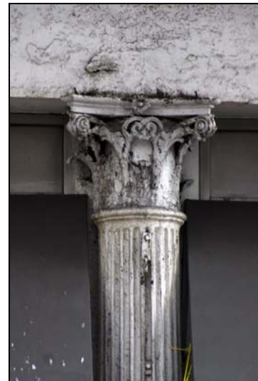
23 Park Place Building , Park Place storefront and details