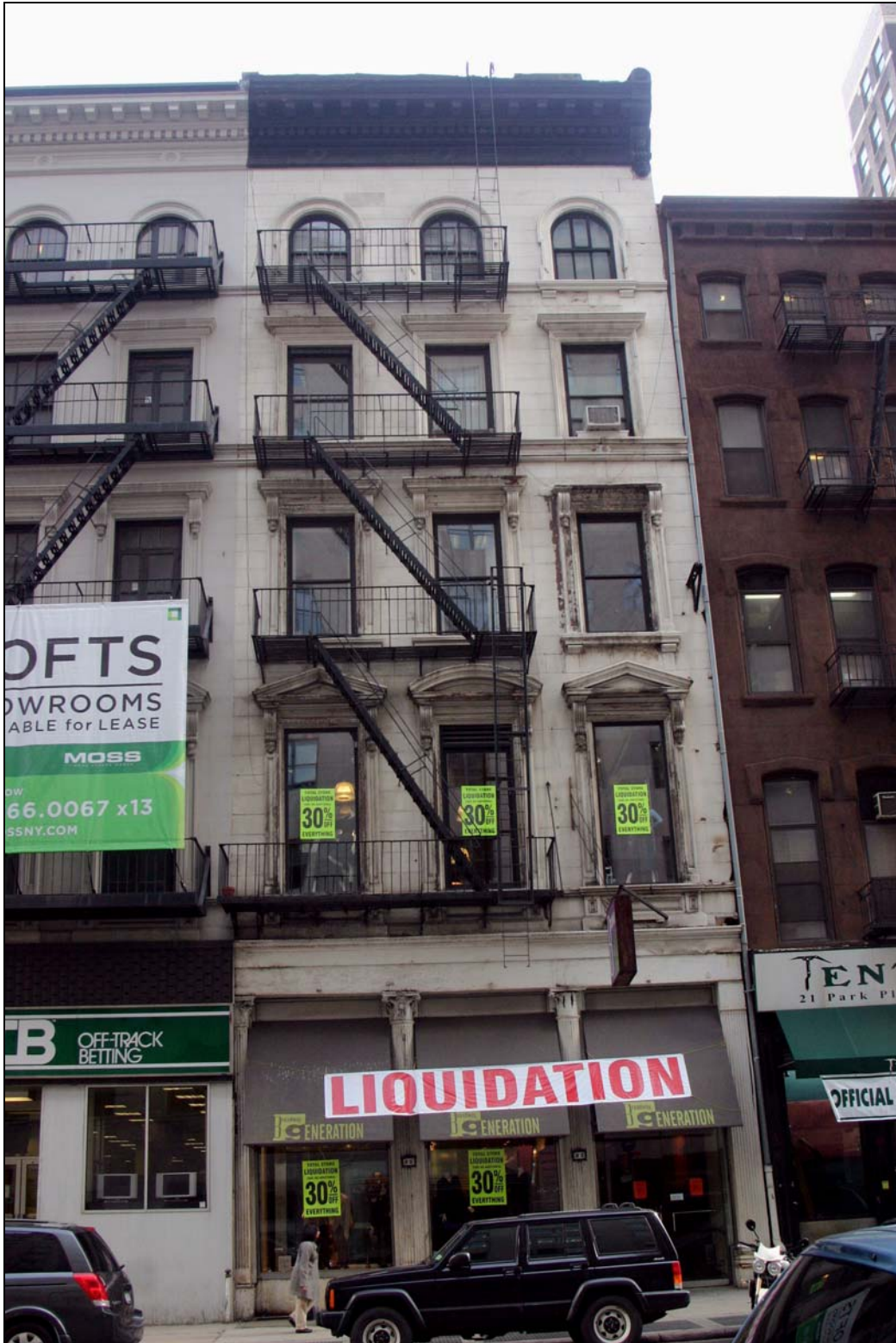
23 Park Place Building , Park Place elevation