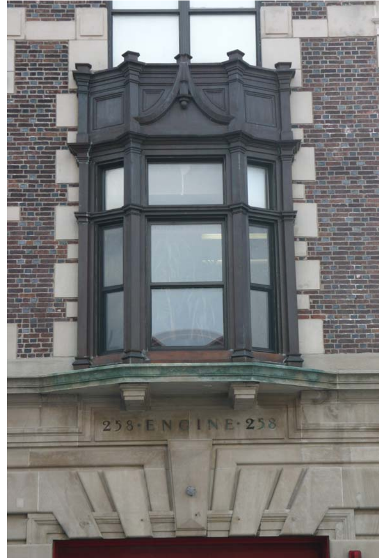
Fire Engine Company No. 258, Hook and Ladder Company No. 115 View of step gable and bay window