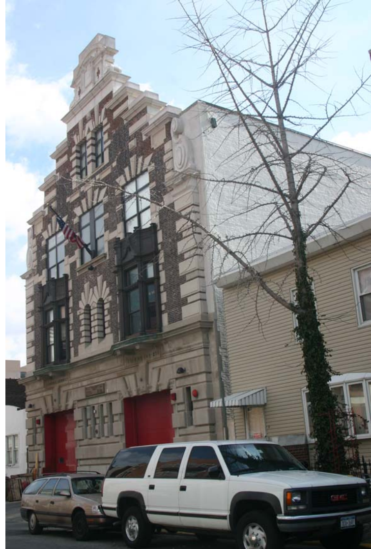
Fire Engine Company No. 258, Hook and Ladder Company No. 115 View from east and west