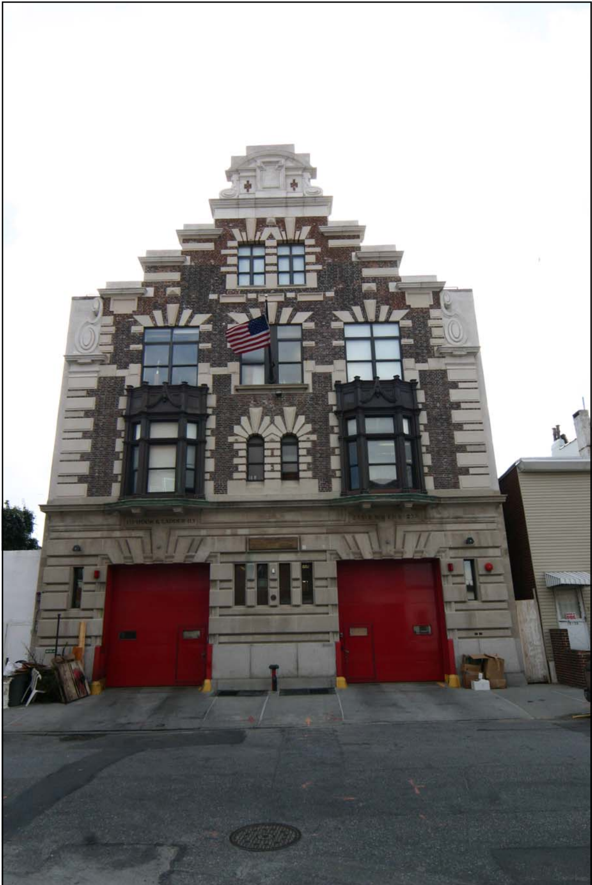
Fire Engine Company No. 258, Hook and Ladder Company No. 115 10-40 47th Avenue (aka 10-38 to 10-40 47th Avenue) Queens