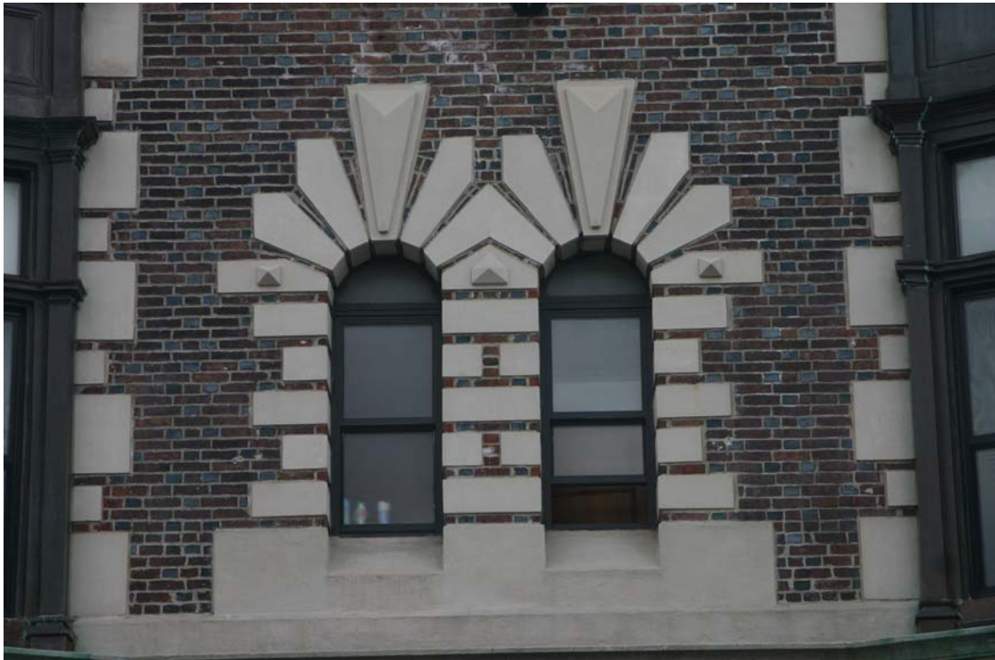
Fire Engine Company No. 258, Hook and Ladder Company No. 115 Step gable and window details