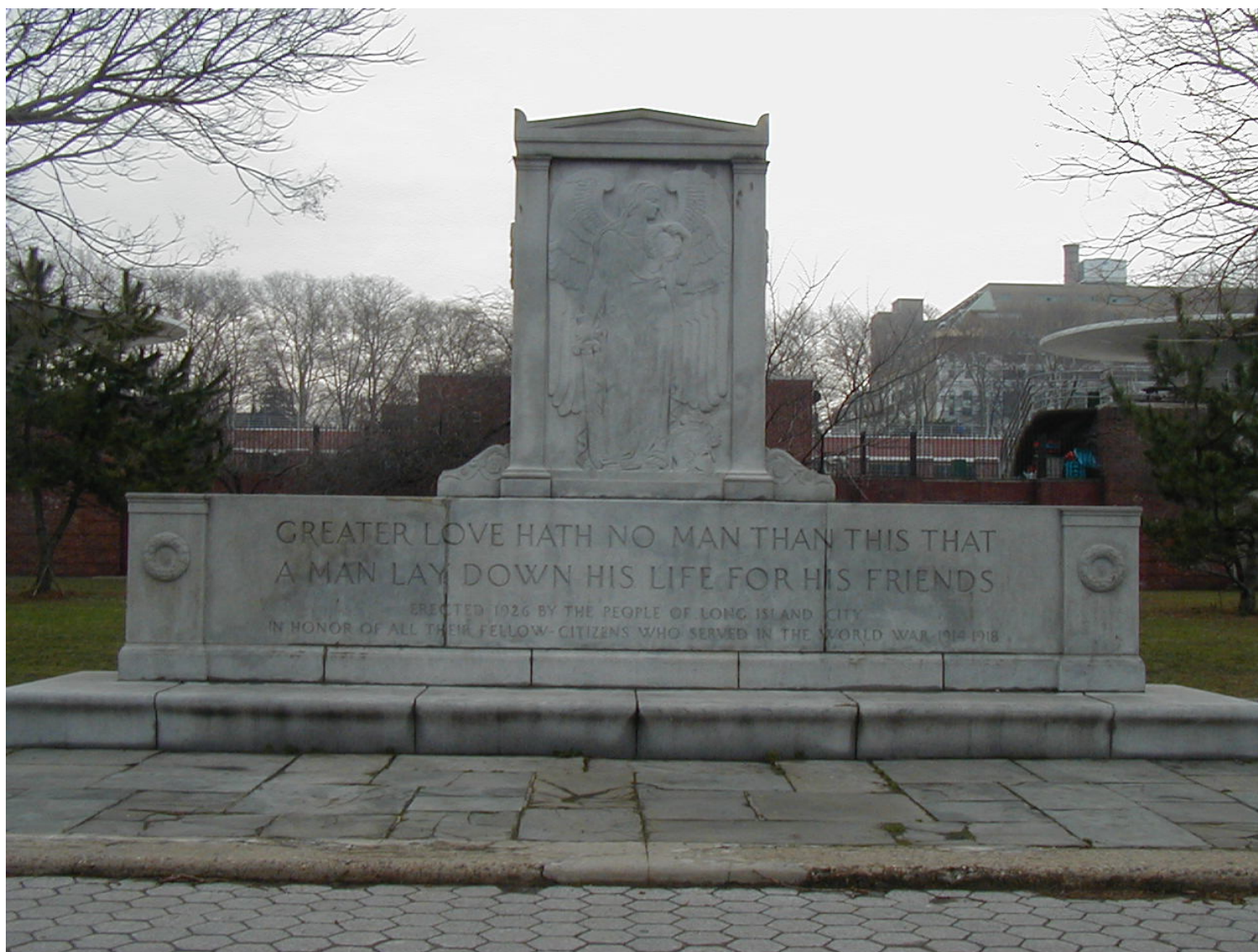
Astoria Play Center, 19 th Street, Borough of Queens: World War I Monument