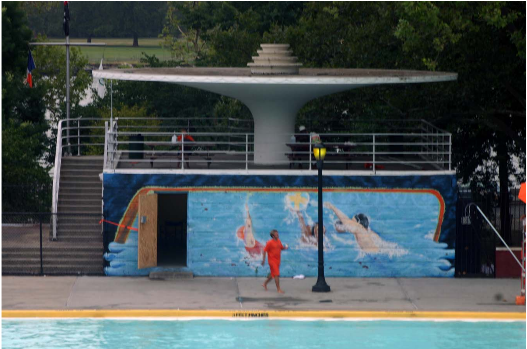
Astoria Play Center, 19 th Street, Borough of Queens: Filter House (east façade)