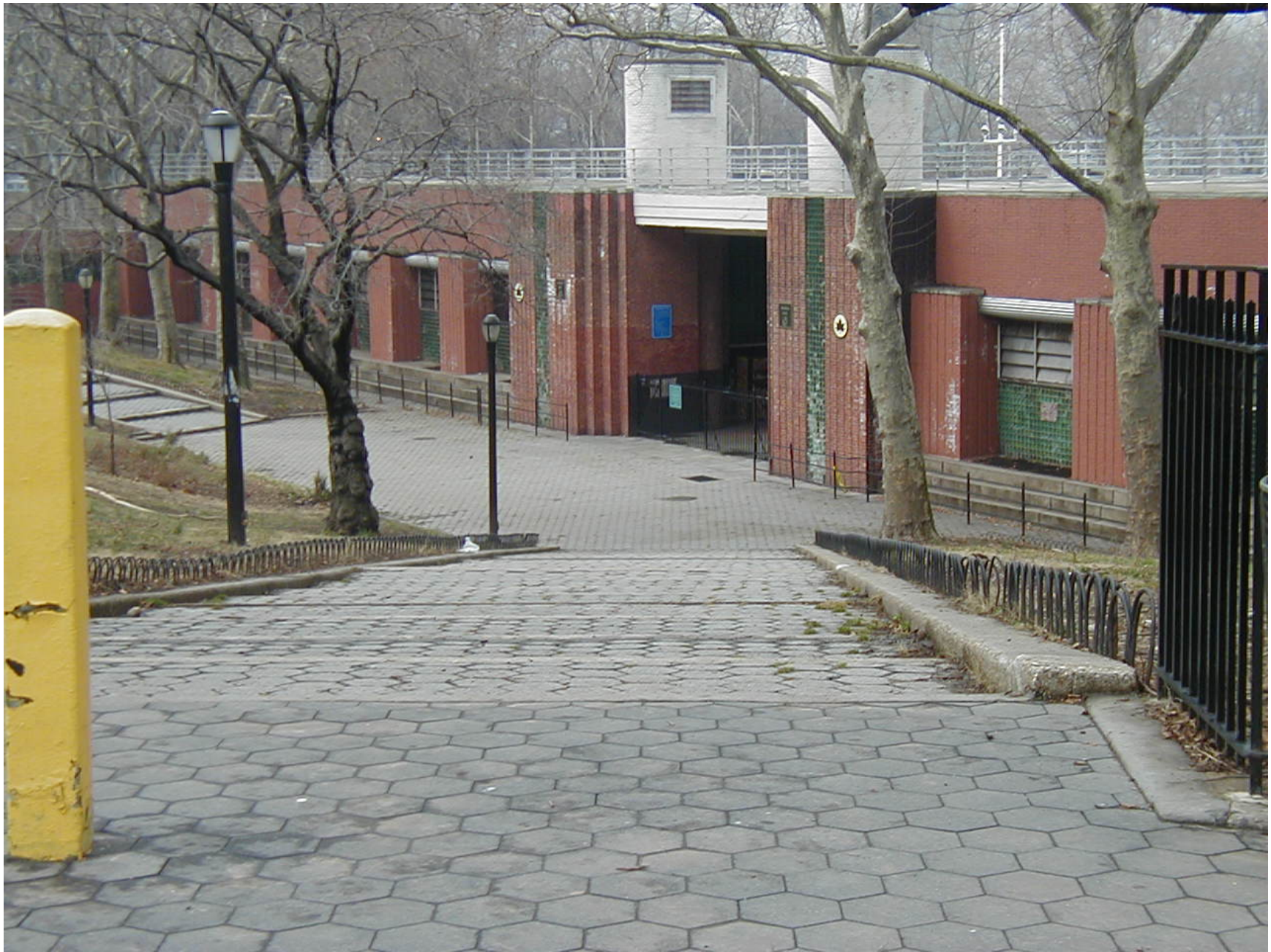
Astoria Play Center, 19 th Street, Borough of Queens: East Facade