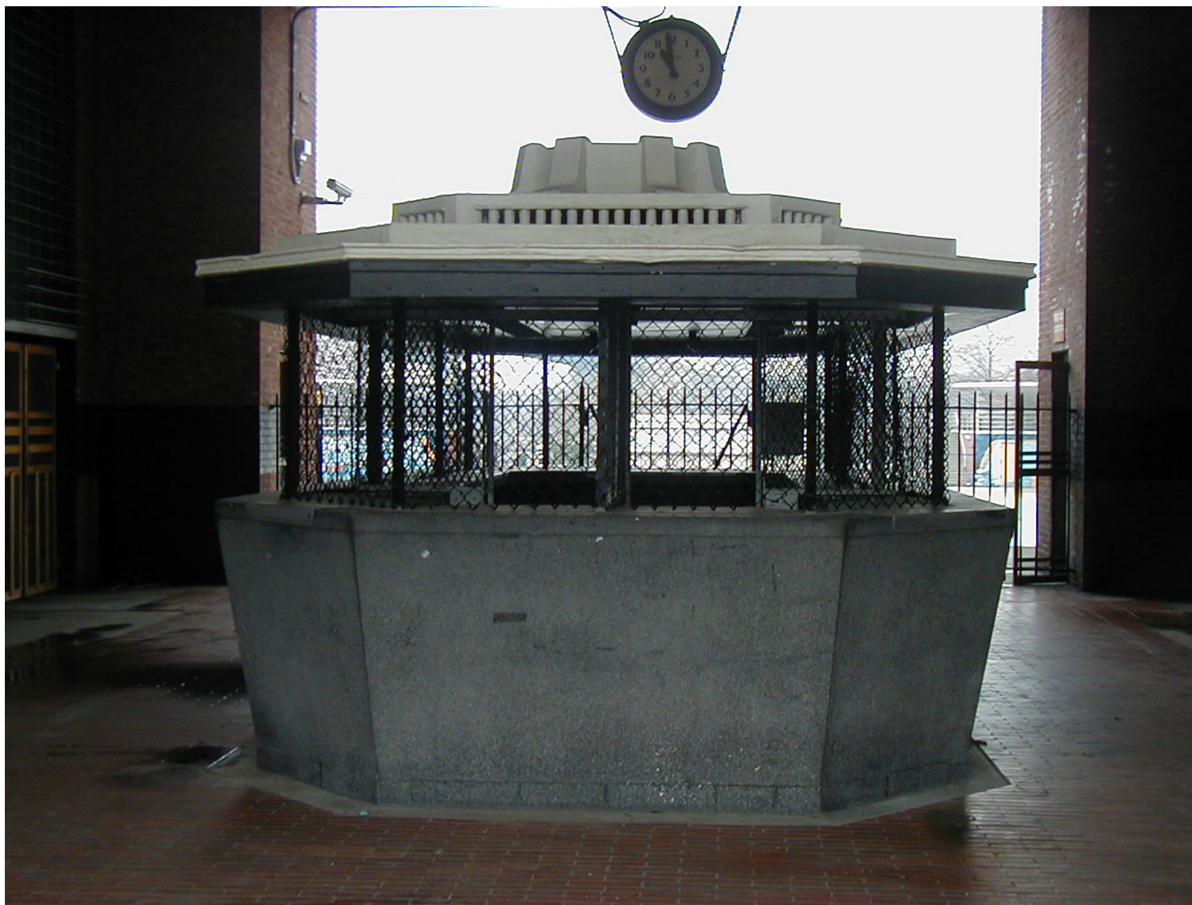
Astoria Play Center, 19 th Street, Borough of Queens: Ticket Booth