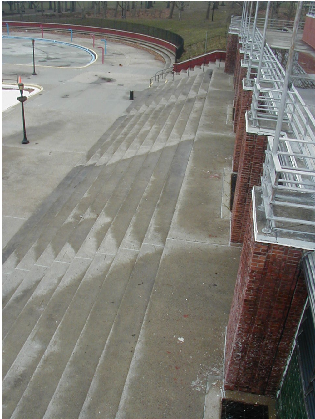
Astoria Play Center, 19 th Street, Borough of Queens: Bleachers