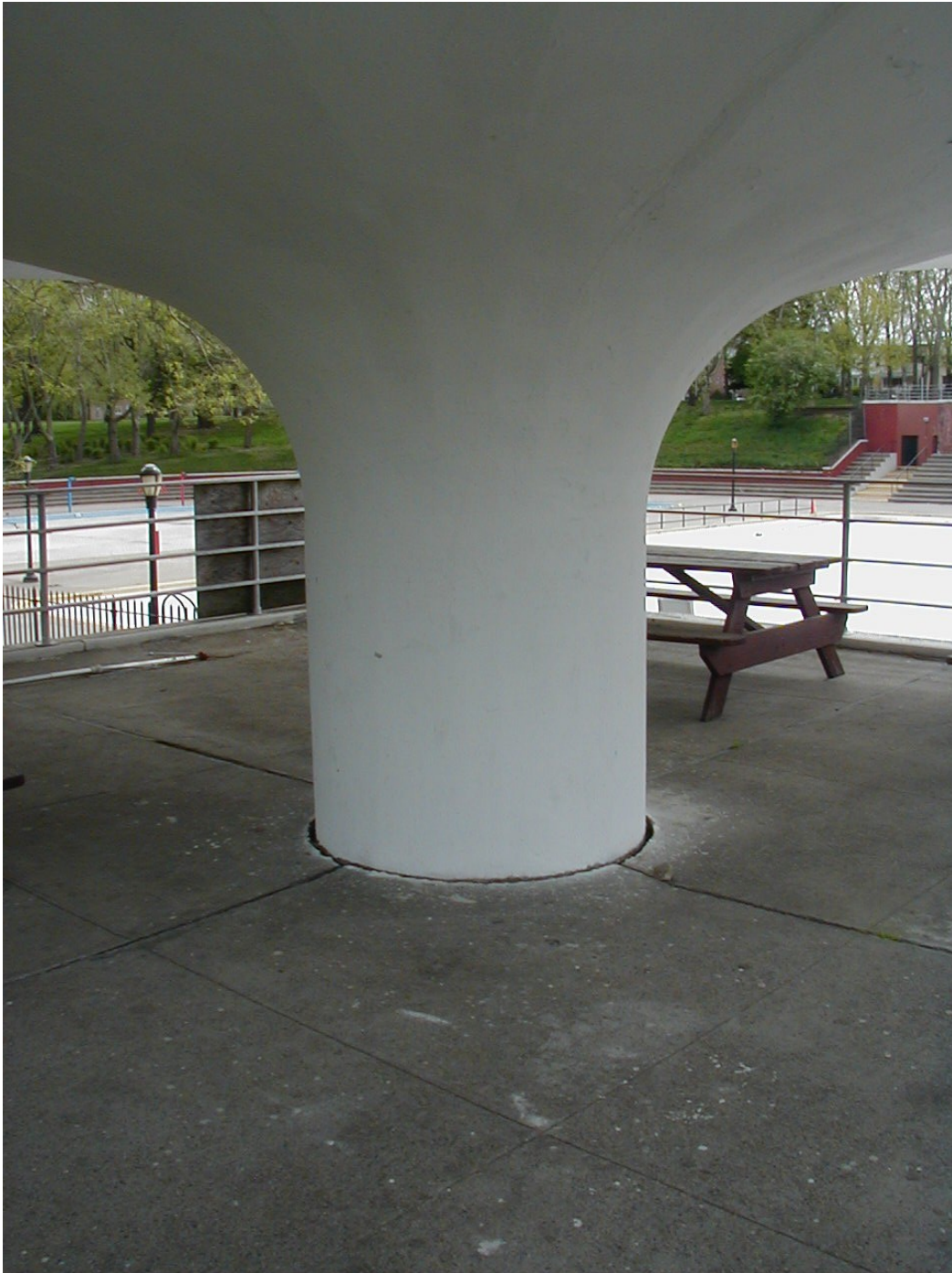
Astoria Play Center, 19 th Street, Borough of Queens: Viewing Platform