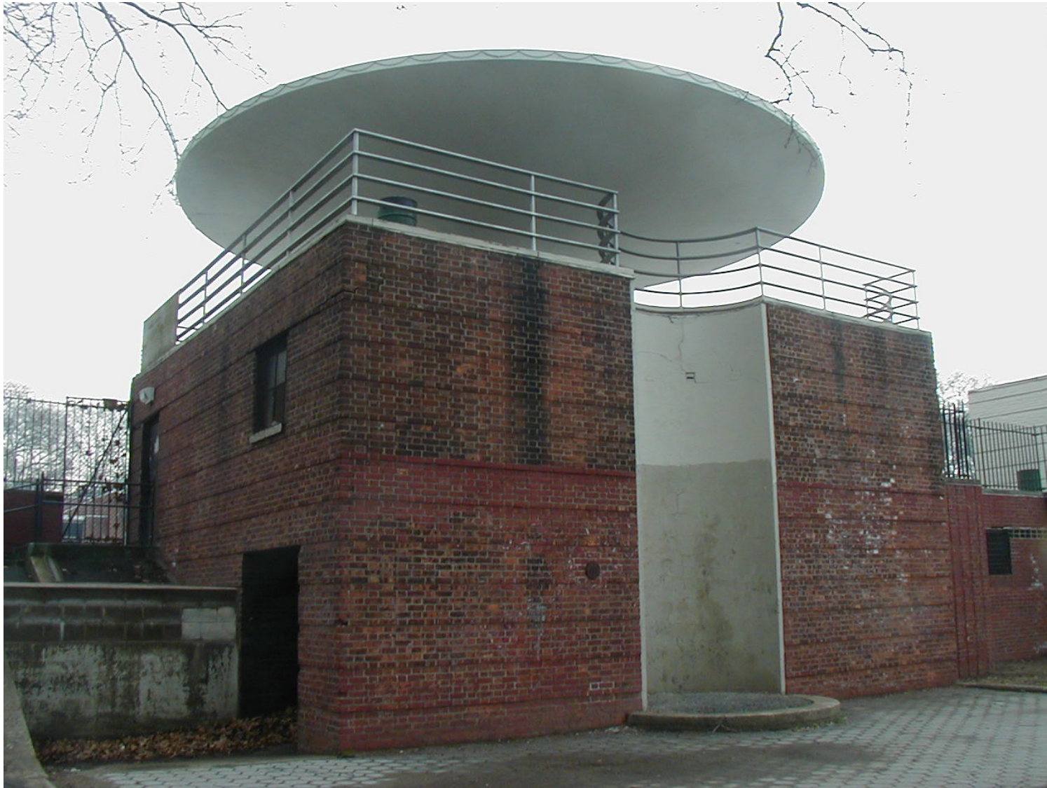
Astoria Play Center, 19 th Street, Borough of Queens: Filter House (west façade) Photo: Donald G. Presa, 2006