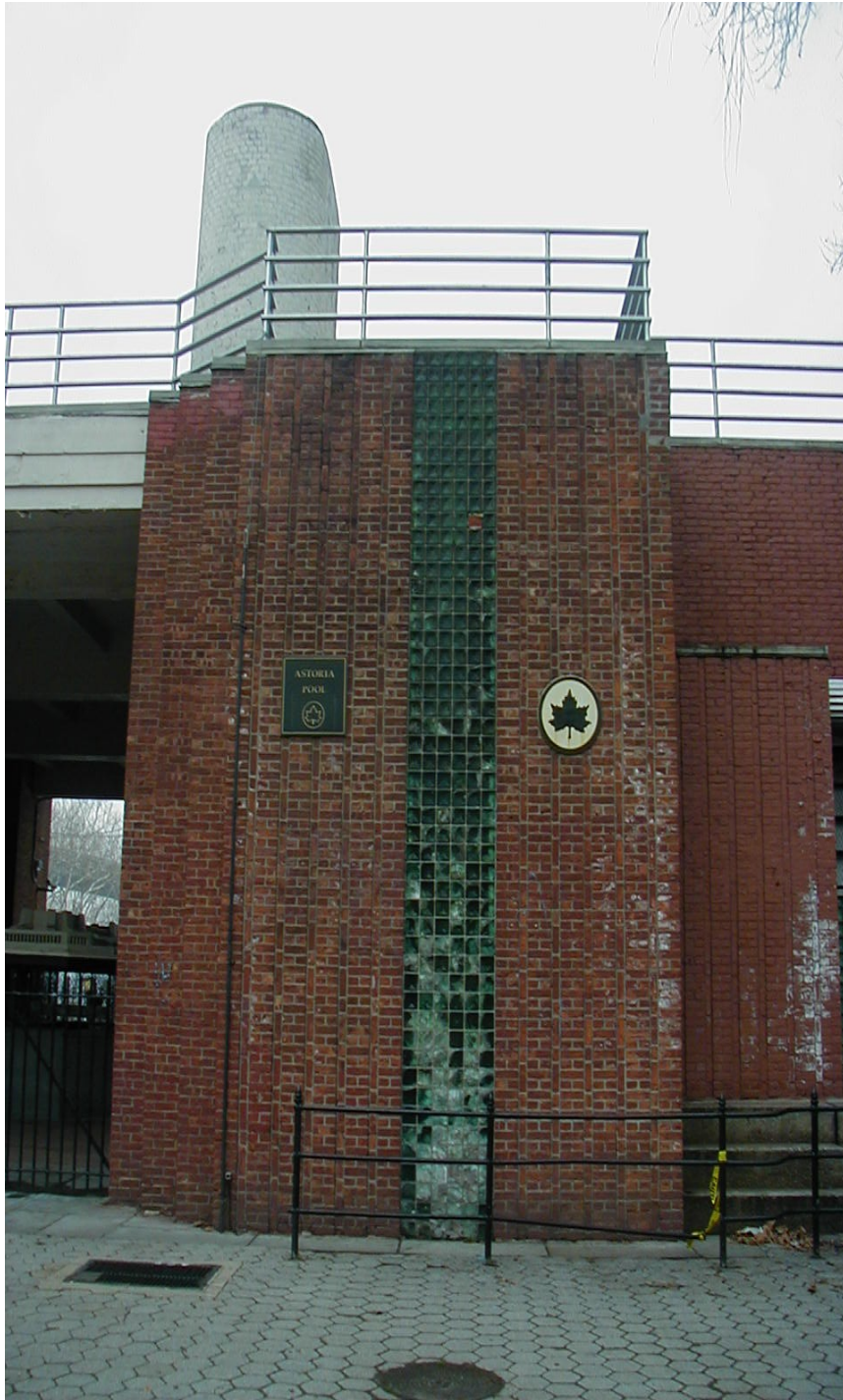
Astoria Play Center, 19 th Street, Borough of Queens: Pier Detail