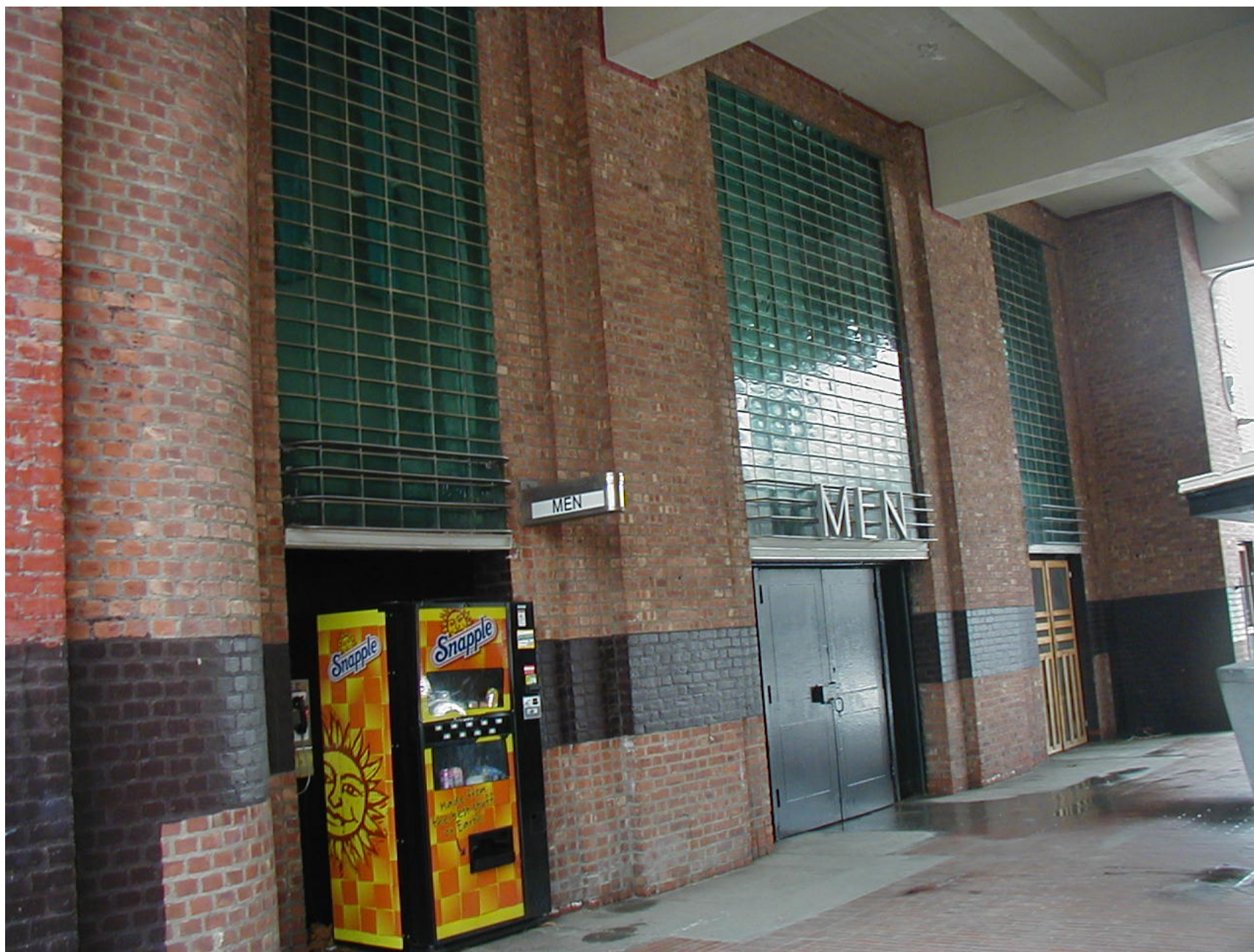
Astoria Play Center, 19 th Street, Borough of Queens: Lobby