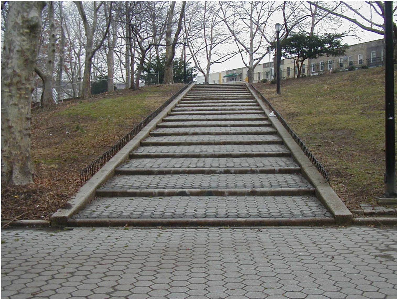
Astoria Play Center, 19 th Street, Borough of Queens: East Entry Ramp