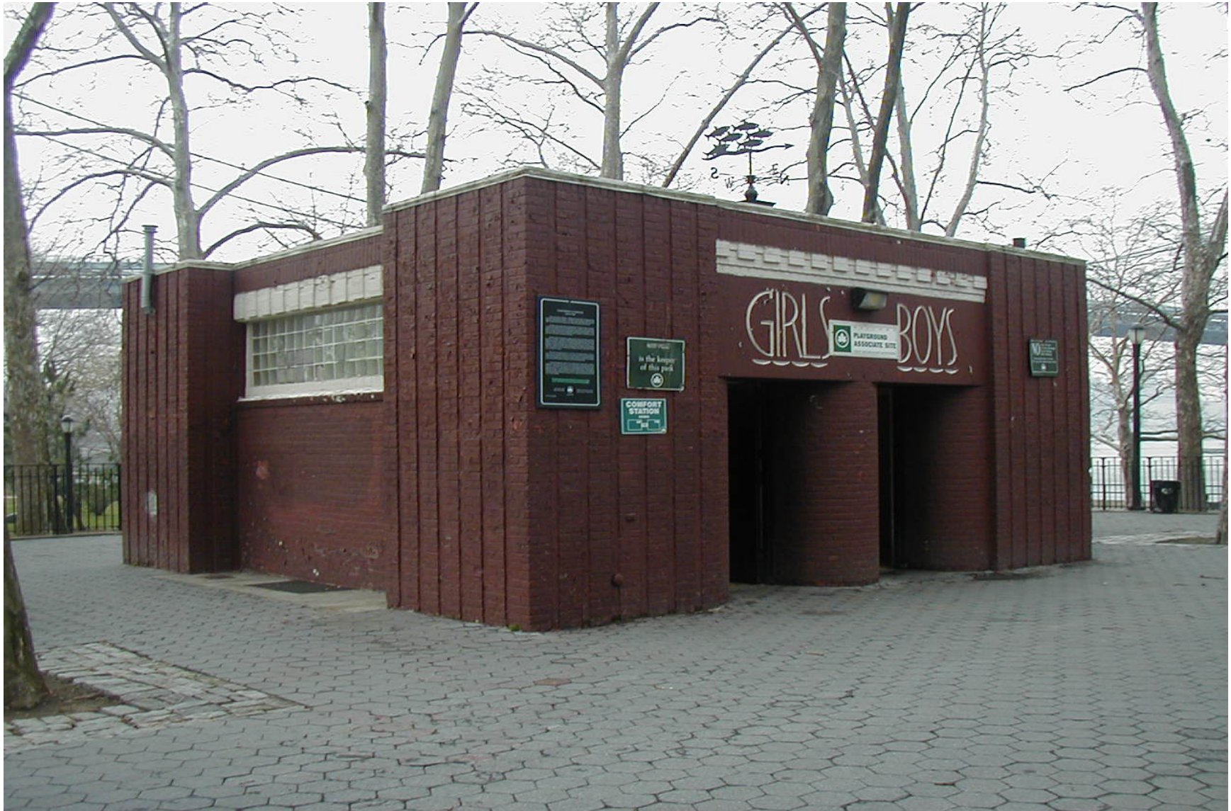
Astoria Play Center, 19 th Street, Borough of Queens: Comfort Station