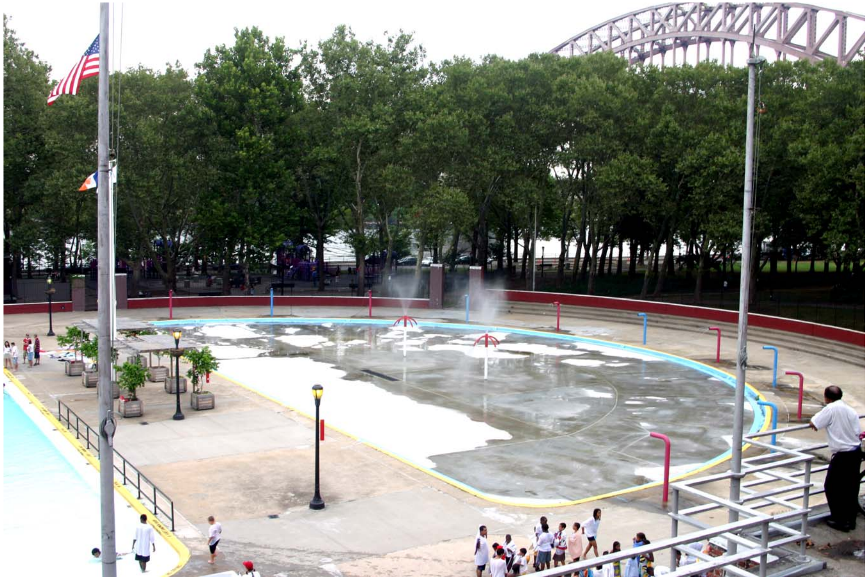
Astoria Play Center, 19 th Street, Borough of Queens: Wading Pool