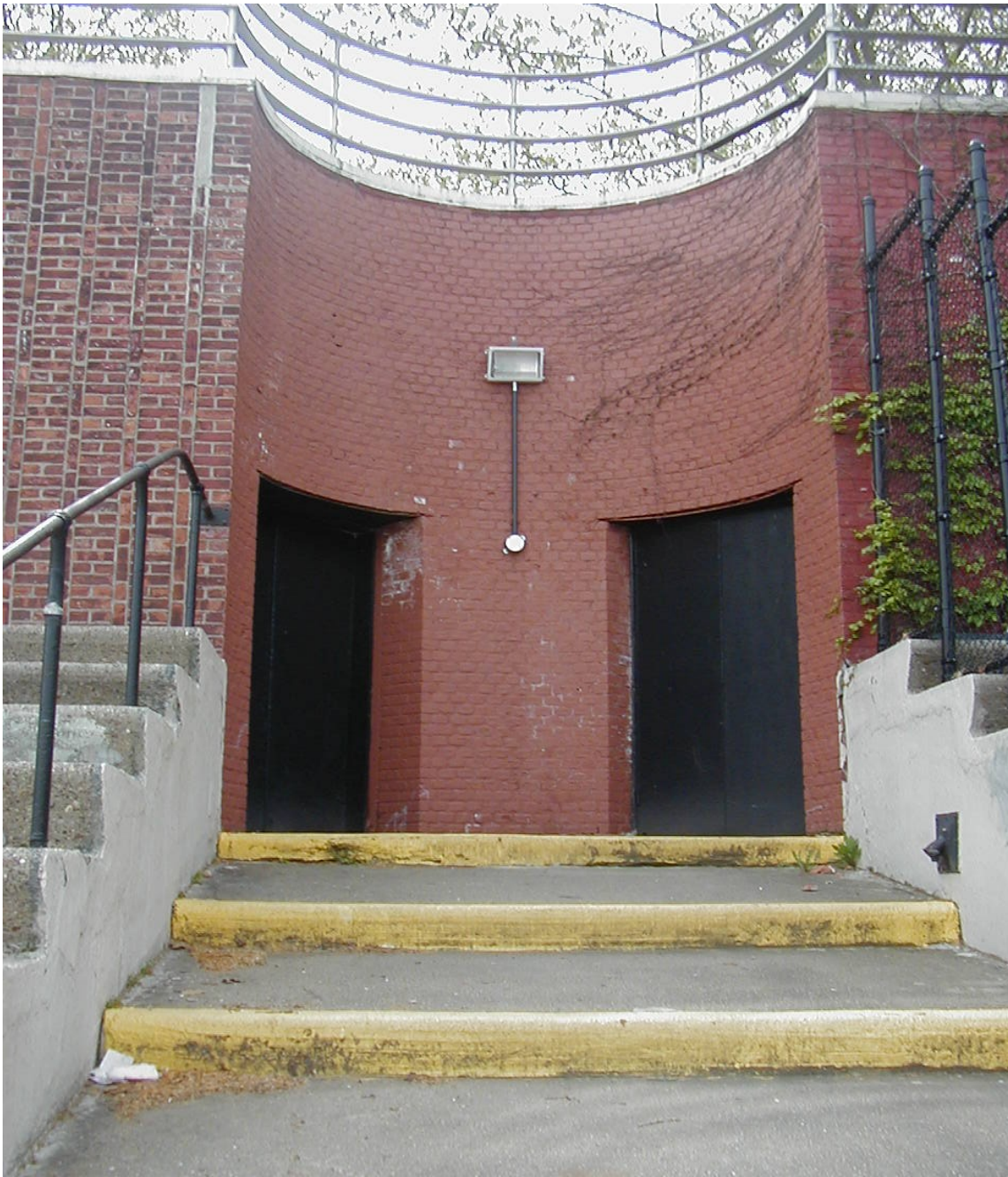
Astoria Play Center, 19 th Street, Borough of Queens: Locker Entryways Photo: Donald G. Presa, 2006