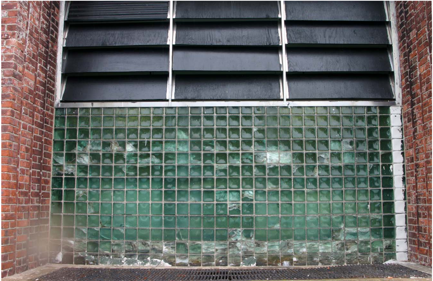
Astoria Play Center, 19 th Street, Borough of Queens: Louver and Glass Block Detail