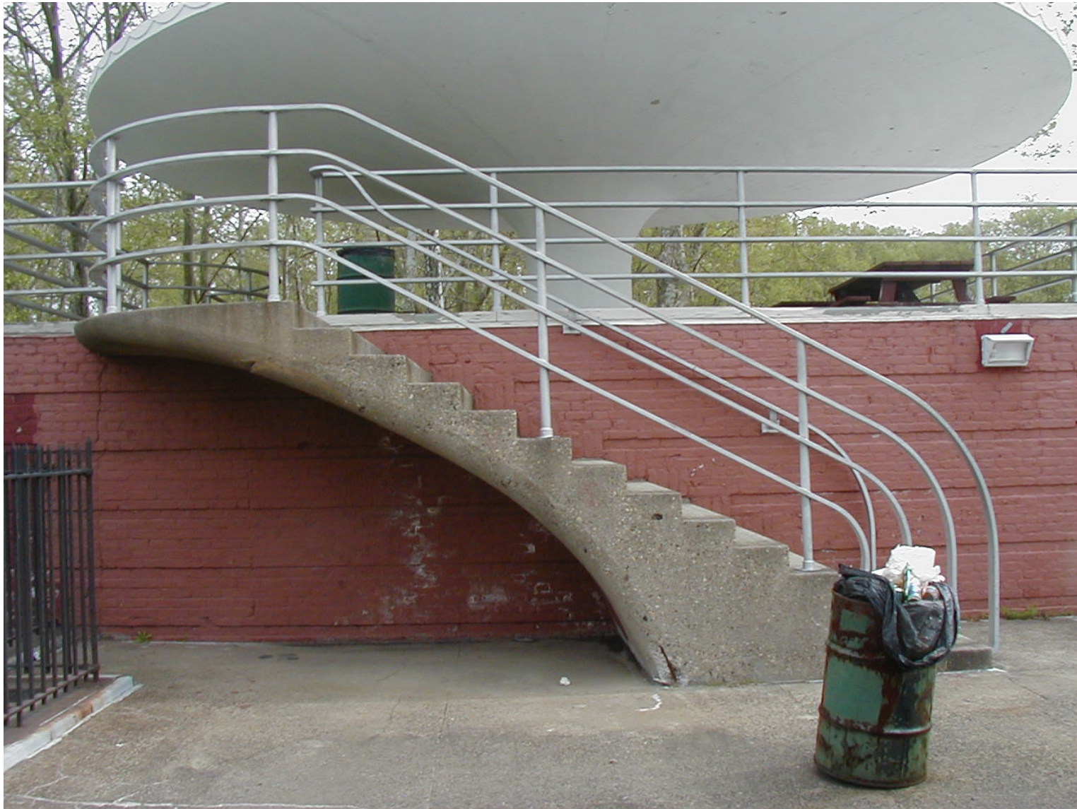
Astoria Play Center, 19 th Street, Borough of Queens: Stair Detail at Filter House Photo: Donald G. Presa, 2006