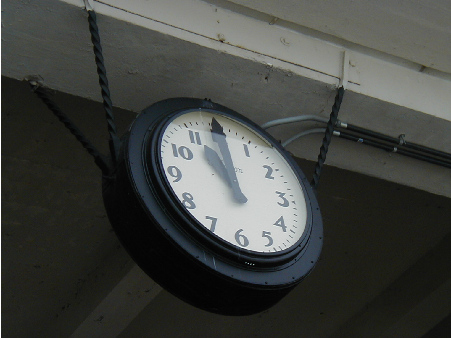
Astoria Play Center, 19 th Street, Borough of Queens: Clock