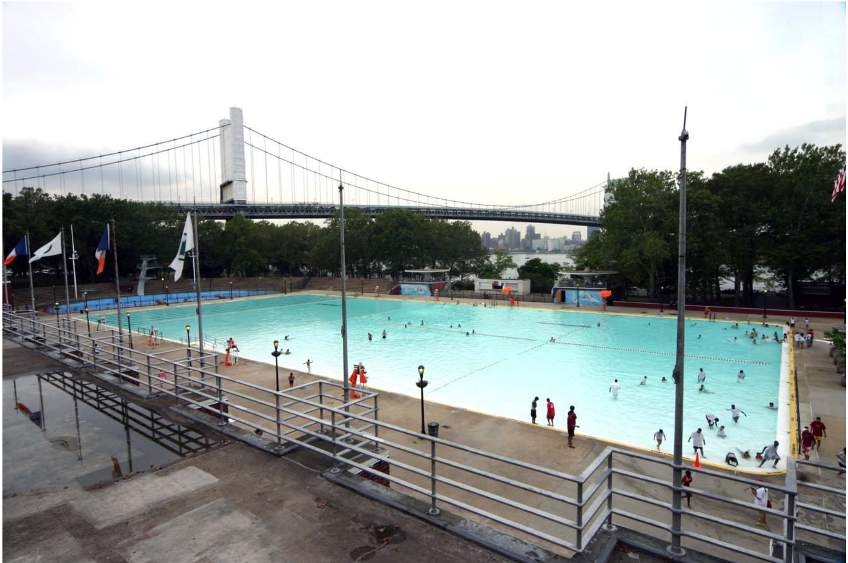
Astoria Play Center, 19 th Street, Borough of Queens: Swimming Pool