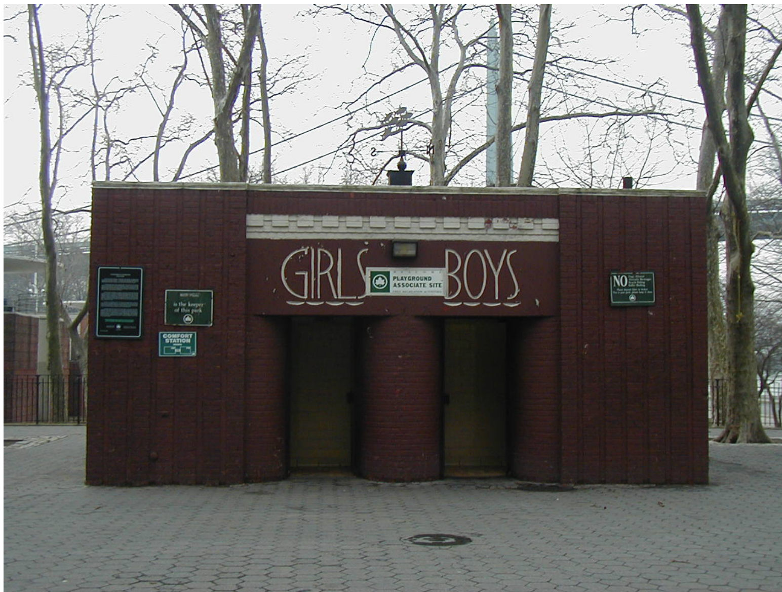
Astoria Play Center, 19 th Street, Borough of Queens: Comfort Station