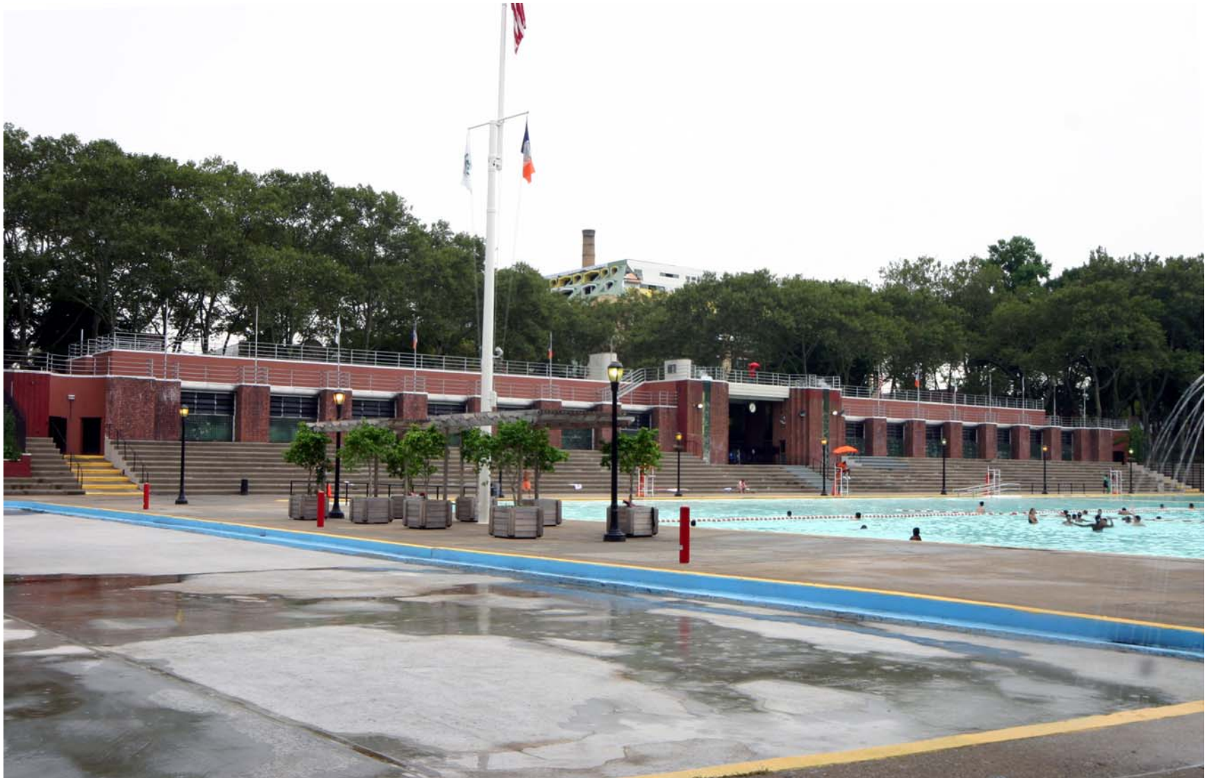
Astoria Play Center, 19 th Street, Borough of Queens: West Facade