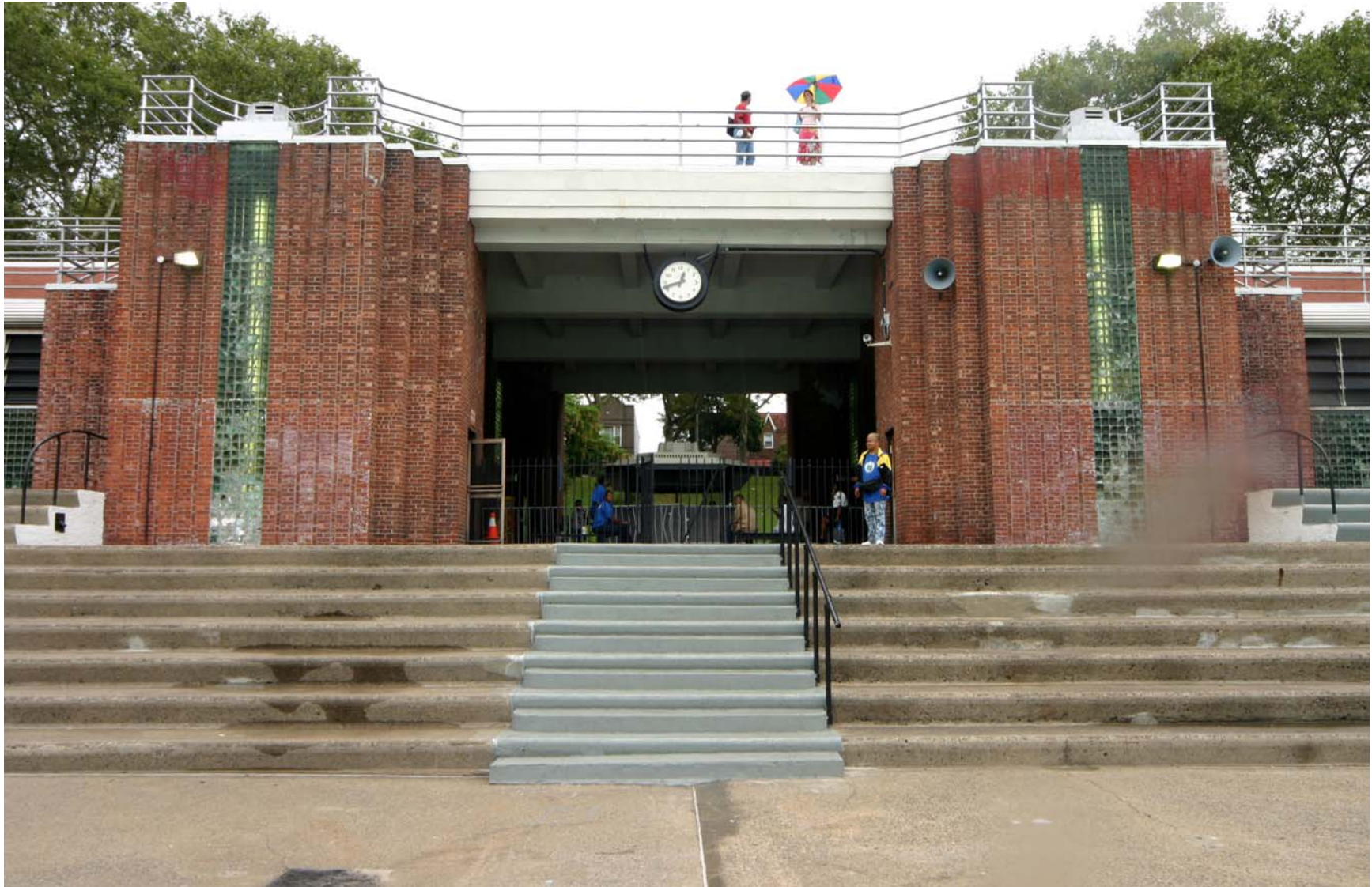
Astoria Play Center, 19 th Street, Borough of Queens: Main Entrance