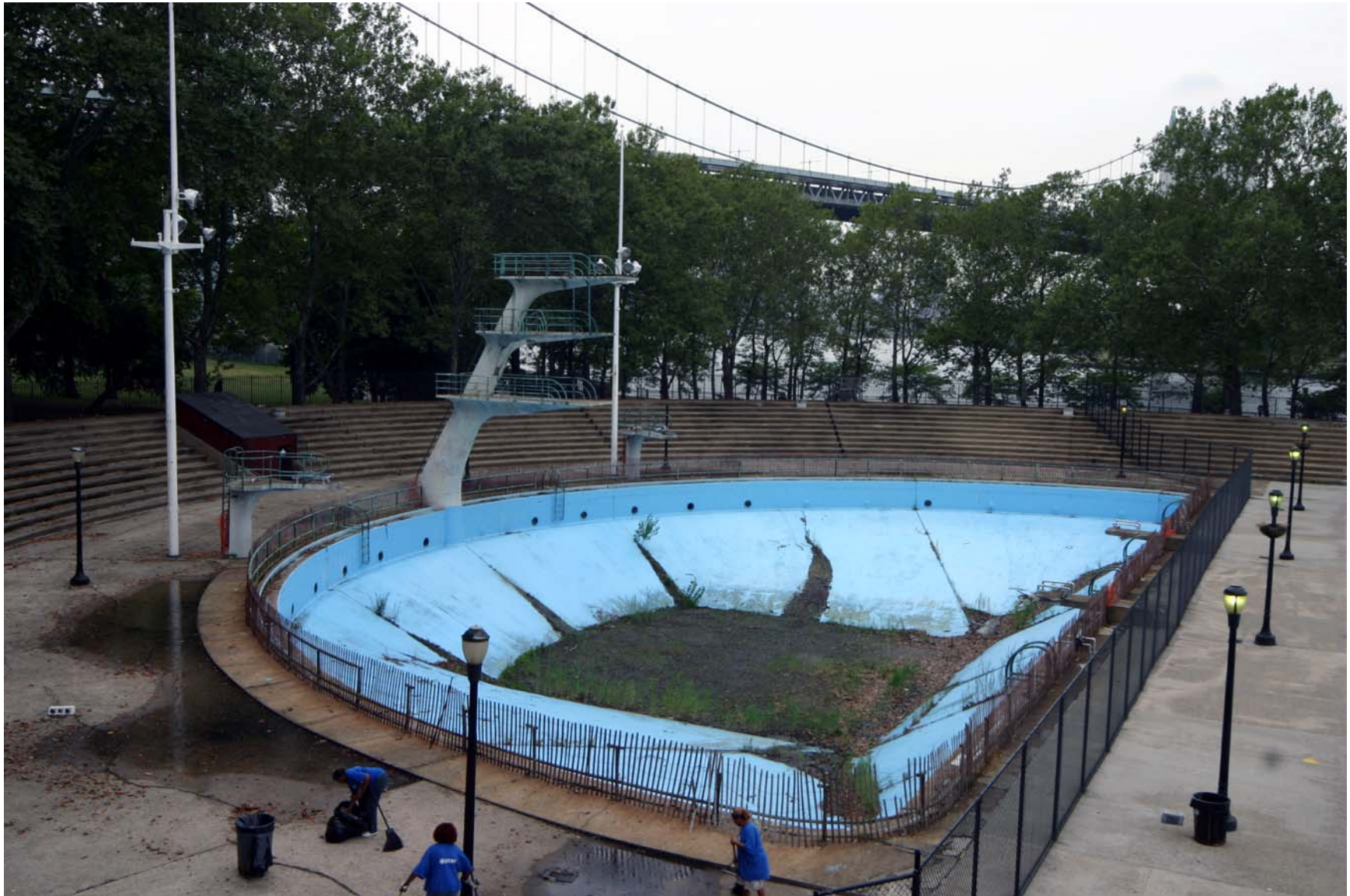
Astoria Play Center, 19 th Street, Borough of Queens: Diving Pool