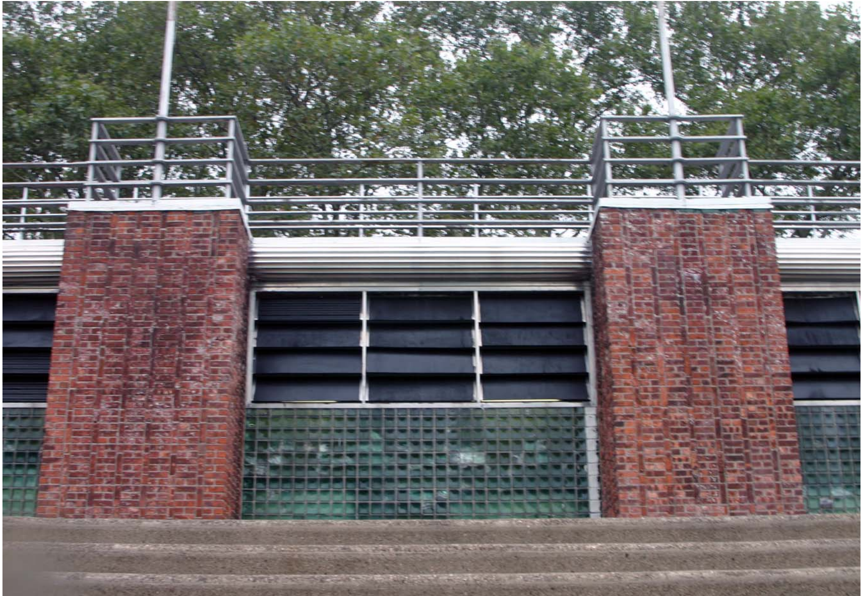
Astoria Play Center, 19 th Street, Borough of Queens: Bay Detail