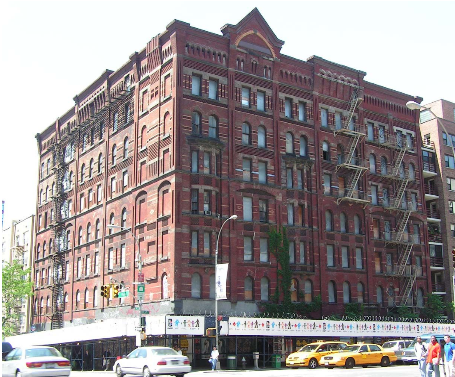
The Windermere, Ninth Avenue (left) and West 57 th Street (right) facades