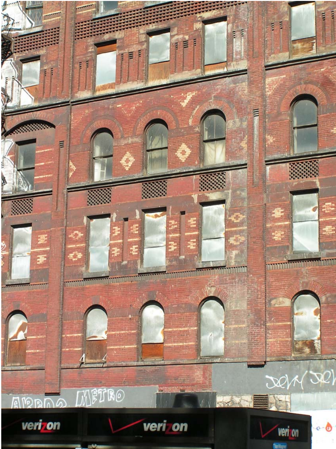
The Windermere, second through fifth stories, central portion of Ninth Avenue façade