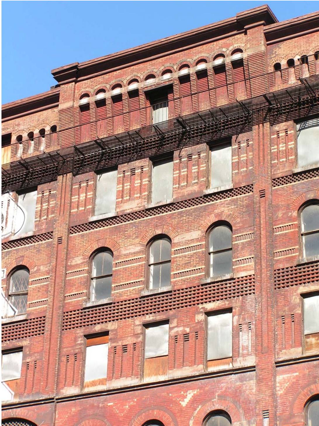
The Windermere, upper stories, central portion of Ninth Avenue façade