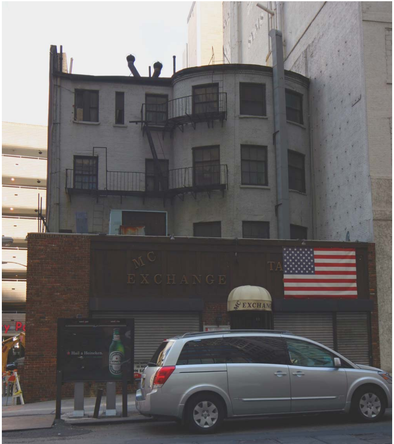
Robert and Anne Dickey House, rear façade