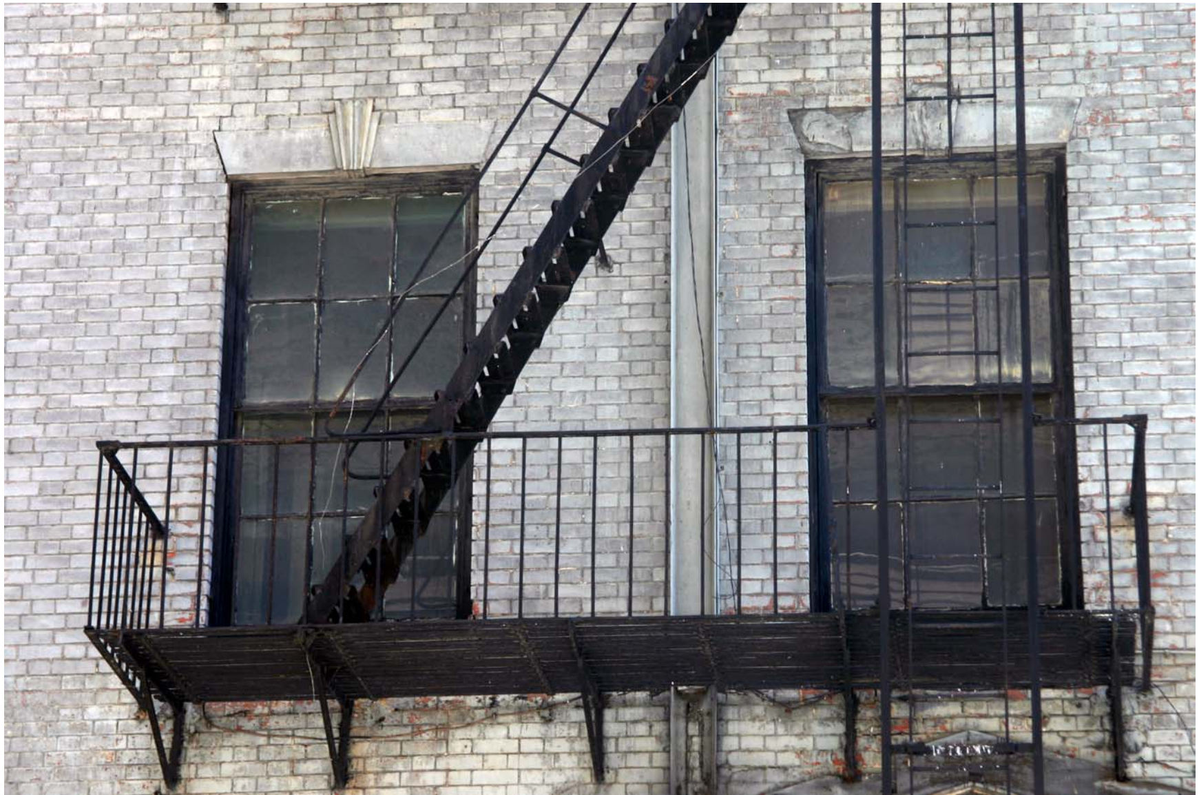
Robert and Anne Dickey House, front façade center windows with splayed lintels with fluted keystones