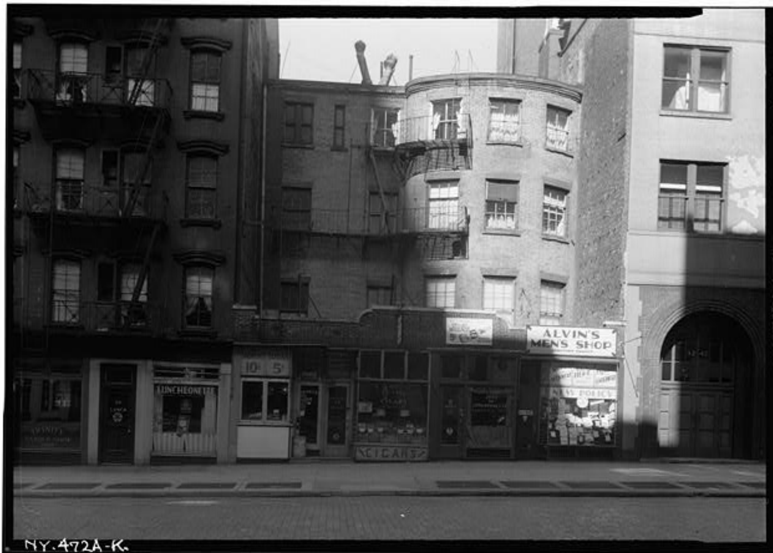
Robert and Anne Dickey House, 67 Greenwich Street, rear façade