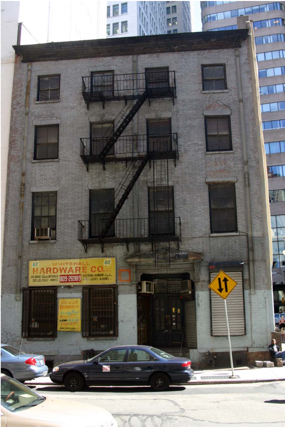
Robert and Anne Dickey House, front façade