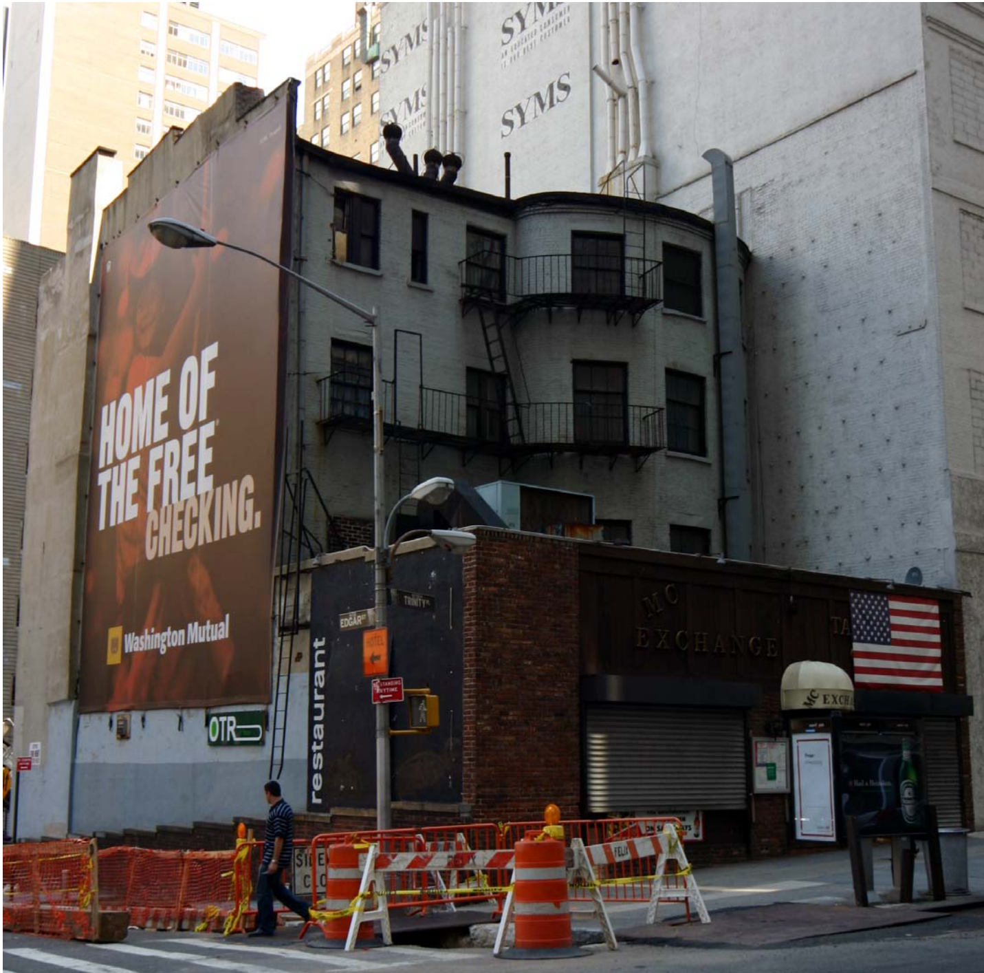
Robert and Anne Dickey House, rear and south façades