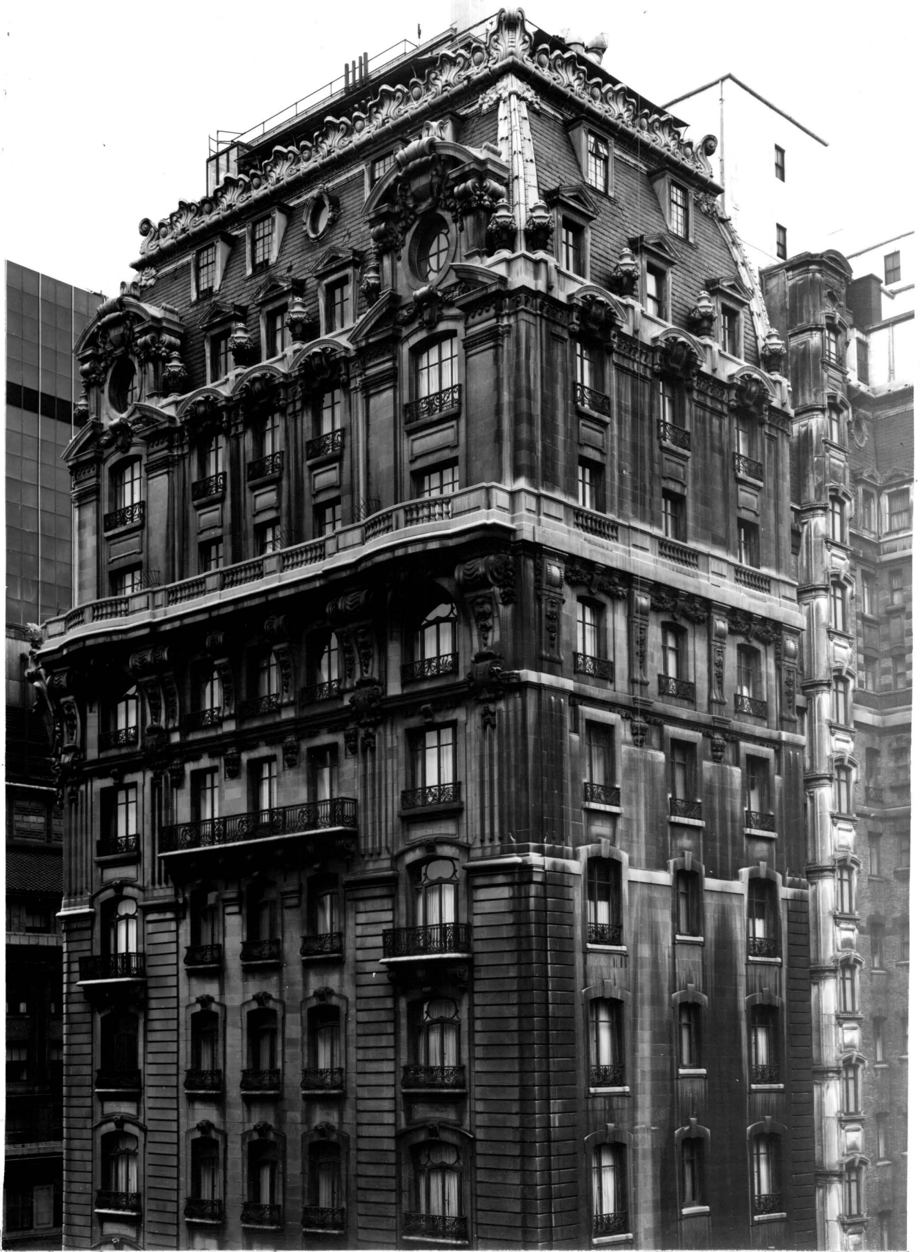
HOTEL ST. REGIS Mansard