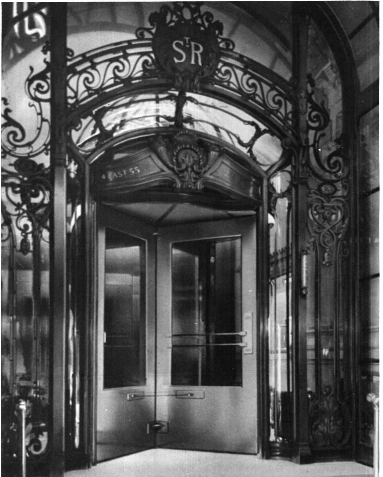
HOTEL ST. REGIS Doorway