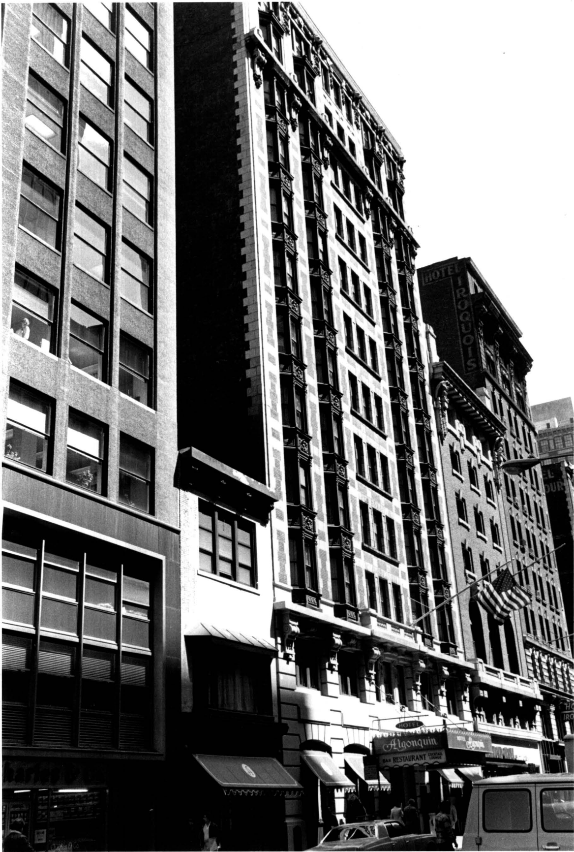
Algonquin Hotel