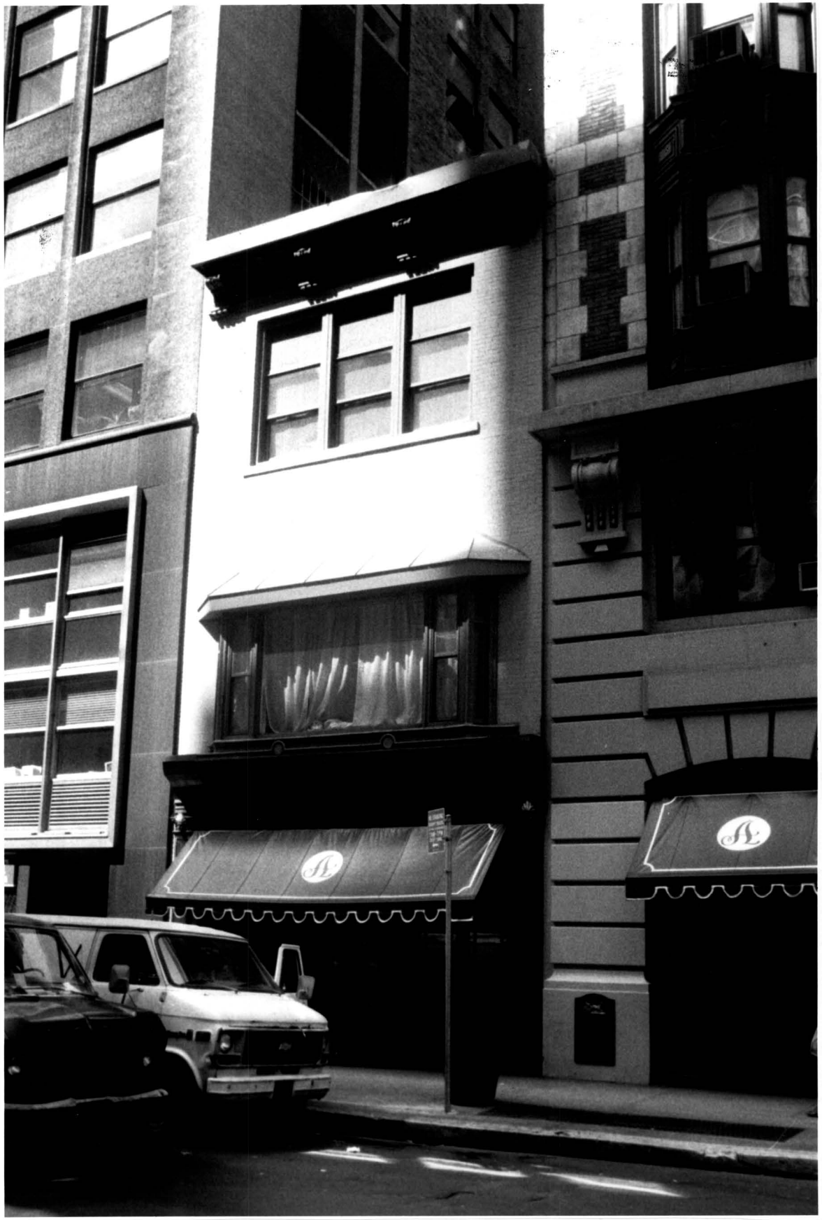
Algonquin Hotel