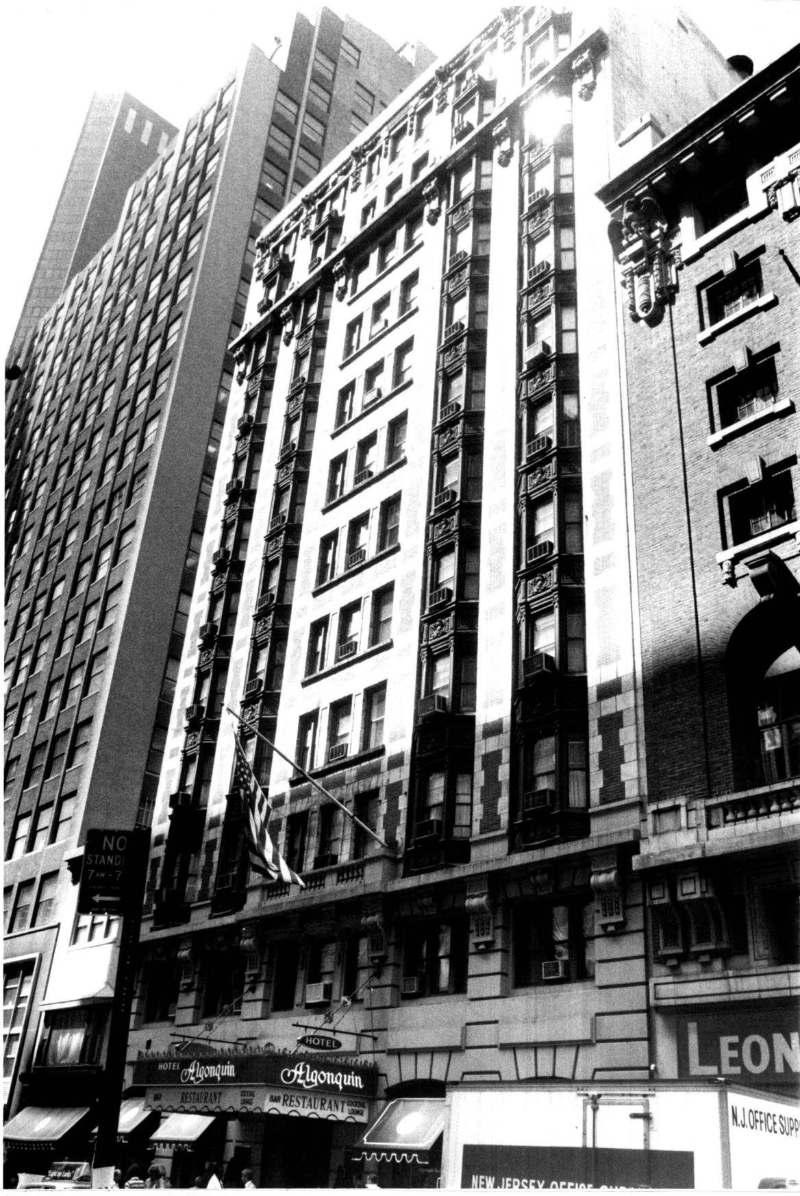
Algonquin Hotel 59-61 West 44th Street