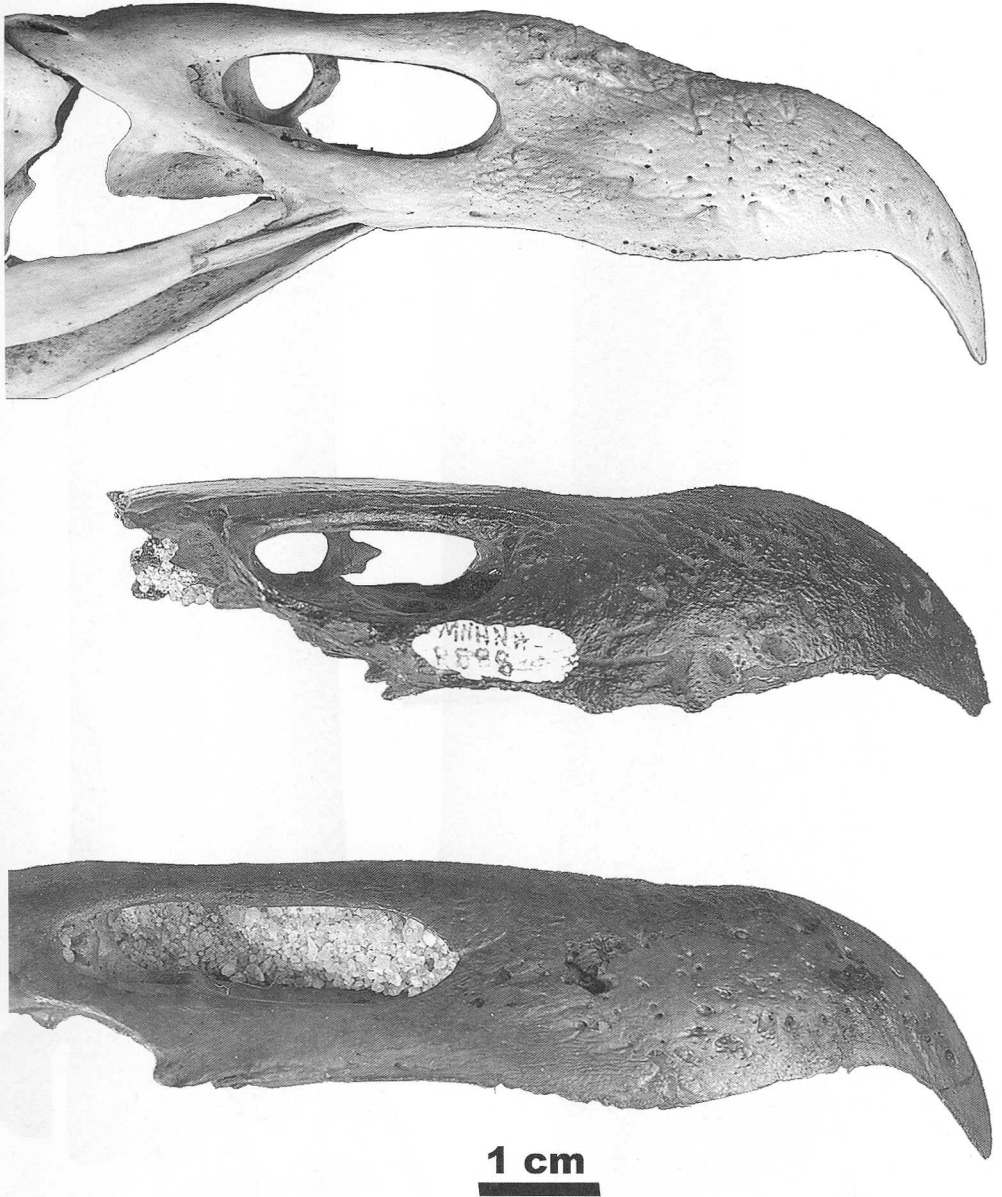
Fig. 2. Lateral view of the rostrum (upper mandible; MNHNCu P4613) of Gymnogyps varonai (middle) in comparison with the equivalent element in living (top, USNM 492447) and fossil (bottom) G. californianus . Scale bar = 1 cm.

21); temporal breadth, 43.2; cranial height, 38.8; postorbital position 51.9; postorbital breadth, 43.0; occipital breadth, 33.7. Pre-maxilla (MNHNCu P4613, formerly P588): breadth, 26.5; narial length, 21.9; narial breadth, 8.1; least breadth of nasal bar, 10.4; breadth of interpalatal space, 8.7;