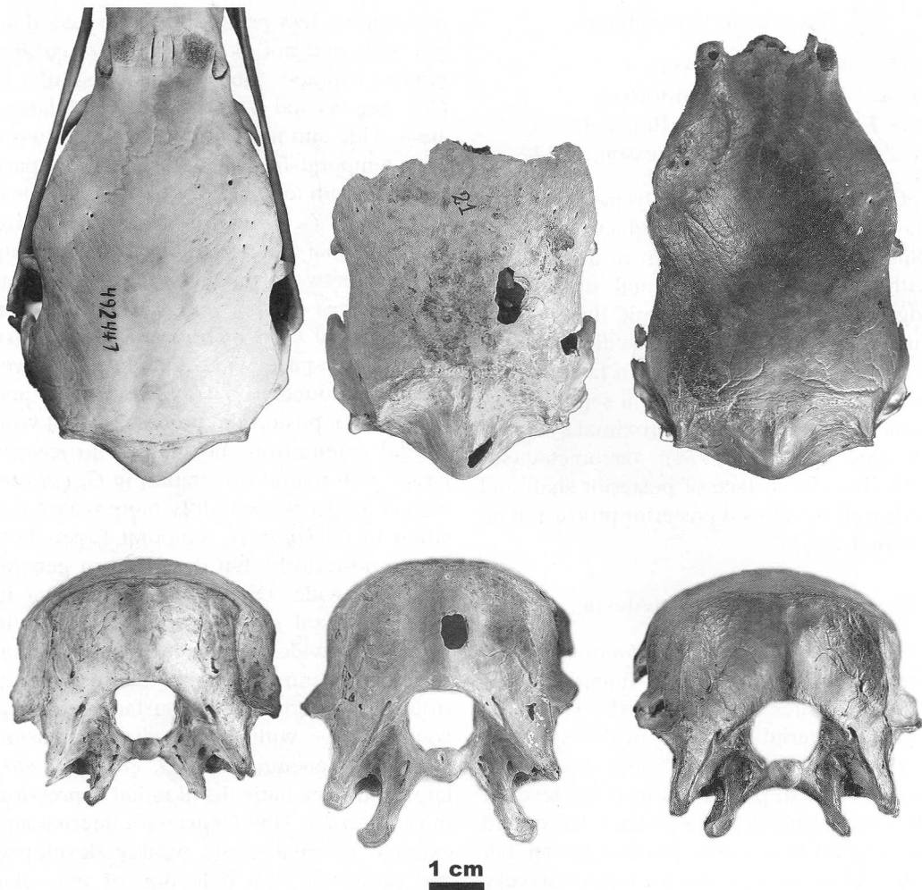
Fig. 1. Partial skull (MPSG 21) of Gymnogyps varonai (middle) in comparison with the equivalent element in fossil (right) and living (left, USNM 492447) G. californianus , in dorsal (A) and lateral (B) views. Scale bar = 1 cm.

bar, more so than in G. californianus and G. kofordi . The mandible is similar to Gymnogyps californianus except in being generally more robust, with larger and blunter articular processes. This element is not known in G. kofordi .