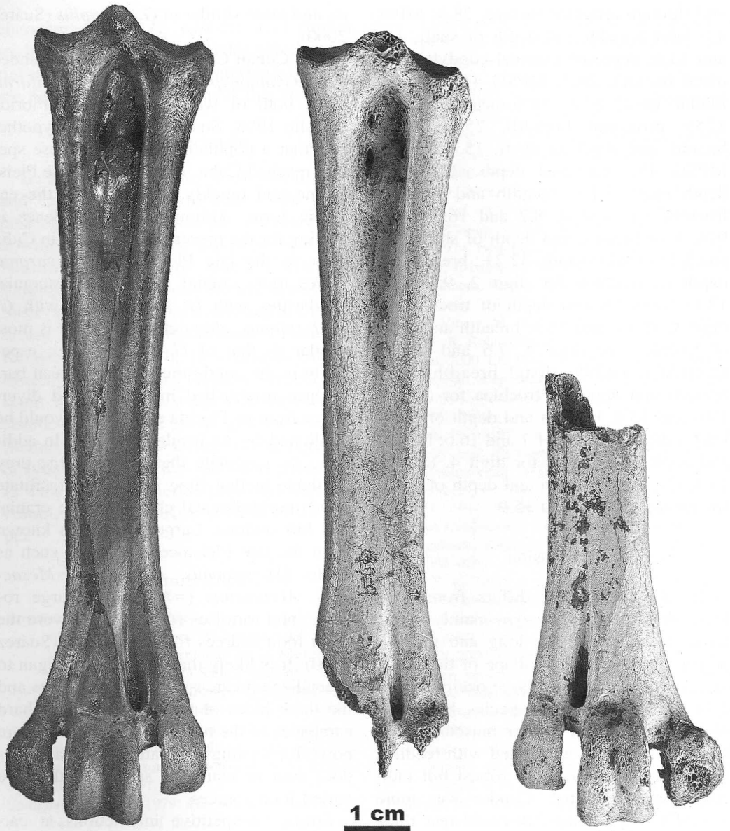
Fig. 4. Left (middle, WS 125) and right (right, WS 978) tarsometatarsi of Gymnogyps varonai in comparison with fossil G. californianus from Rancho la Brea (left). Scale bar = 1 cm.

tively; depth of head, 18.0 and 18.2; IZACC P80: least breadth and depth of shaft, 20.0 and 16.0; distal breadth and depth, 47.4 and 26.4; MSPG 32 and 33: distal breadth, 49.0 and 48.7, respectively; MSPG 33: distal depth, 25.1. Ulna (MPSG 34): distal breadth and depth, 22.9 and 23.3. Radius (MPSG 36 and 37, IZACC 400–813):