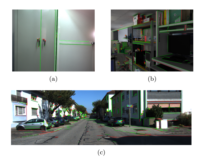
Fig. 1. (a) Texture-less scenes are challenging for traditional point-based SVO approaches.(b) Synthetic frame extracted from the Tsukuba dataset. (c) Frame extracted from the KITTI dataset, where both point and line features are abundant.

In recent years, visual odometry (VO) has gained importance in robotics applications such as ground vehicles moving on uneven terrains, or unmanned aerial vehicles (UAVs). An alternative to VO in these cases is the use of inertial measurement units (IMUs), but they are not able to cancel the gravity effects precisely. accumulating large errors over time. Traditional solutions also include wheel odometry, which cannot replace VO since it only works with smooth and planar movements, and GPS-based navigation systems, which are limited to open outdoor environments and are unable to estimate the orientation of the device they are attached to. An additional advantage of VO is that the information required (provided by cameras) can be exploited for other navigation-related tasks such SLAM [1] and scene recognition. Visual odometry can be addressed with a single camera [2] [3] [4], stereo cameras [5], or RGB-D sensors [6] [7]. Moreover, two methodologies have been considered in the literature: appearance-based and feature-based. The first group, known as dense approach,