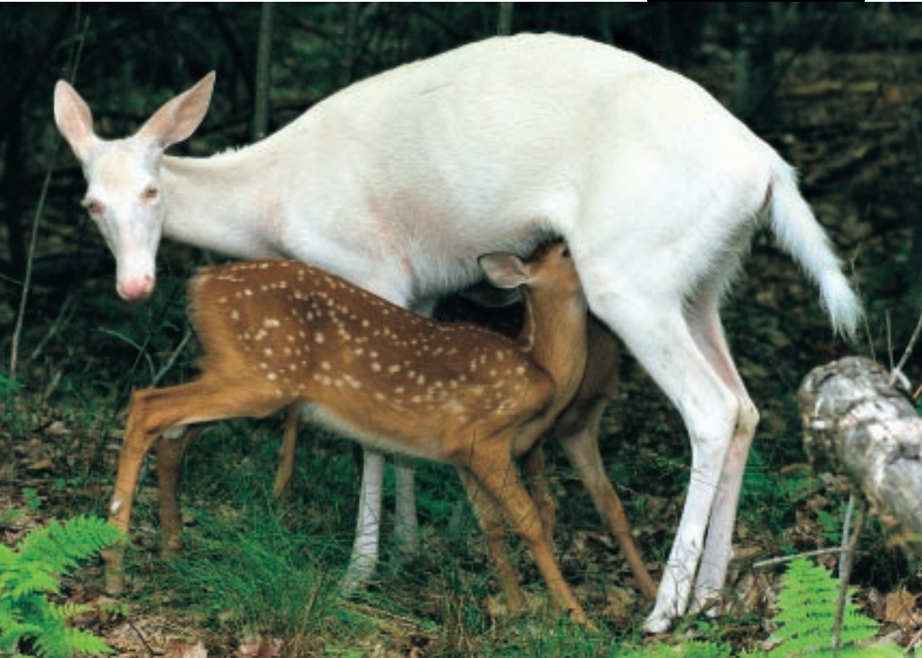
ALBINO DOE BY TOM AND PAT LEESON

Melanin is made through a complex chain of chemical reactions that occur in a specialized cell called a melanocyte . Because it is a complex process, many factors can alter the production of melanin in a melanocyte. The most critical factor in the process is the presence of a special enzyme (agent that starts and speeds up reactions) called tyrosinase : Without it, melanin cannot be made.