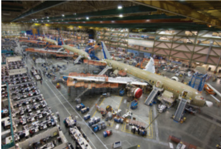
Flight test aircraft two through five for the Boeing 787 Dreamliner in the final assembly facility in Everett, Washington.

to partner stringers in the wing box (Mitsubishi). During wing flexing tests, stringer caps suffered damage including, according to reports, some laminate disbonding. Boeing had no choice but to revisit the detail design and develop a fix. Repairing and fortifying the structure on aircraft already built involves technicians accessing a very tight repair space to install titanium reinforcements, a process expected to take about three months. The fortified structure will then have to be re-tested before the six flight test aircraft can fly. A definitive structural modification is being developed for production aircraft.