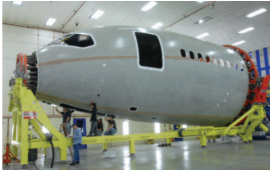
Nose section fabrication at Spirit Aerosystems facility in Wichita, Kansas.

Sonic Cruiser, an intended advanced Mach 0.98-capable airliner, had been conceived at a time when speed still held sway as a leading design driver. The re-ordered priorities of a post-'9/11' world led to the project's