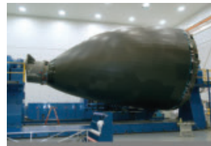
The first 787 nose section, a single composite part.

Boeing had also seemingly assembled a formidable supply chain and was leaning its aircraft manufacturing operation at Everett accordingly, encouraged by a similar system that seemed to be working for its earlier metal B737 narrowbody jet. Suppliers signed up initially included Alenia Aeronautica of Italy, Vought Aircraft Industries in the USA and Japanese suppliers Fuji, Kawasaki and Mitsubishi Heavy Industries. Also on board were two engine manufacturers; customers could choose