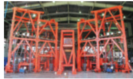
Alenia Aeronautica completes ultimate load tests on a B787 horizontal stabiliser.

But, despite these high-profile achievements, all was not well with Boeing's flagship programme, which was becoming beset with problems. The public could not know that the July roll-out had been of an aircraft which, behind a gleaming exterior, was little more than an unfinished shell. Reasons for this sham were rooted in earlier stages of the project.