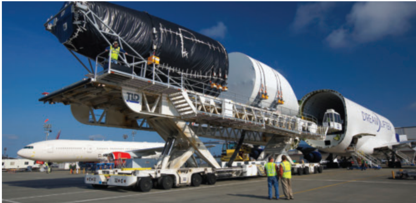
Three B787 composite fuselage sections arriving in Everett. The all-composite forward section known as section 41 (wrapped in white), manufactured by Spirit AeroSystems in Wichita, is 21 ft in diameter and 42 ft long. Sections 47 and 48 (wrapped in black) are the two aft composite sections of fuselage. They were manufactured by Vought Aircraft Industries in Charleston. Section 47 is 23 ft long and 19 ft in diameter. Section 48 is 15 ft long and 14 ft in diameter. (Picture © Boeing.)

sitting flush to the fastened surfaces, prejudicing structural integrity.