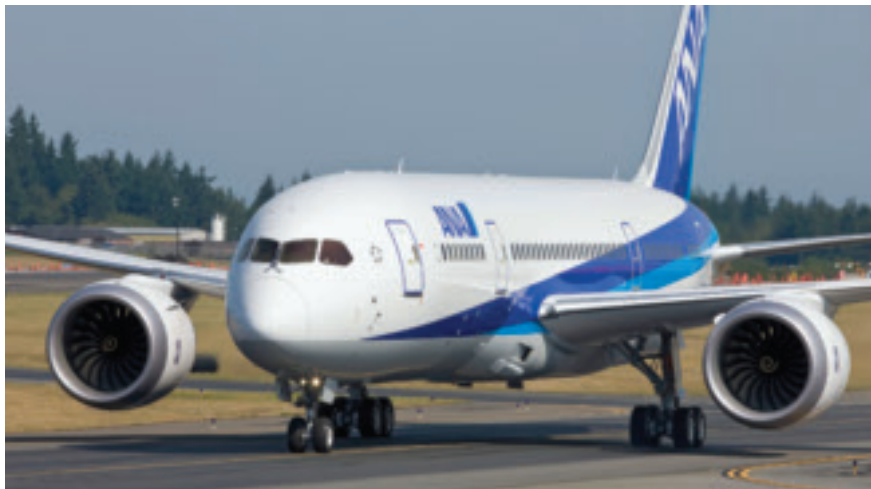
The second Boeing 787 Dreamliner, painted in the livery of launch customer ANA (All Nippon Airways), during taxi tests in August 2009. The test took place at Paine Field airport in Everett, Washington.

Although these fasteners had been painted red so that they could be identified, the task of locating and replacing several thousand of them challenged the capabilities of a leaned-down Everett. Fasteners have to be replaced very carefully since composites are more sensitive to clamping pressure and installation force than metal. This point struck home forcefully when, as well as having had to change many fasteners on partners' sub-assemblies after their arrival at Everett, technicians there found themselves having to re-install thousands more on flight test and static (ground) test aircraft that everyone thought had already been re-fastened. This happened because of damage suffered when some temporary fasteners had been removed to make way for correct replacements. Inspectors found that metal swarf produced at metal-to-composite joins when drilling oversize holes was preventing fasteners from