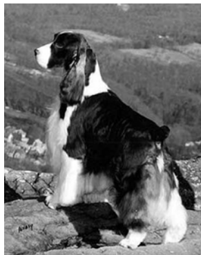
The late CH Salilyn's Condor

The English Springer Spaniel has long drooping ears, a moderately long coat, a happily wagging tail, and a talent for flushing (or "springing") birds. At maturity, females are around 19" tall at the shoulders, and weigh about 40 lbs., and males around 20", weighing about 50 lbs. They may be black and white, liver and white, or either combination with tan points (tri-colored), with or without ticking (freckles). The typical Springer is friendly, eager to please, quick to learn and willing to obey. Such traits