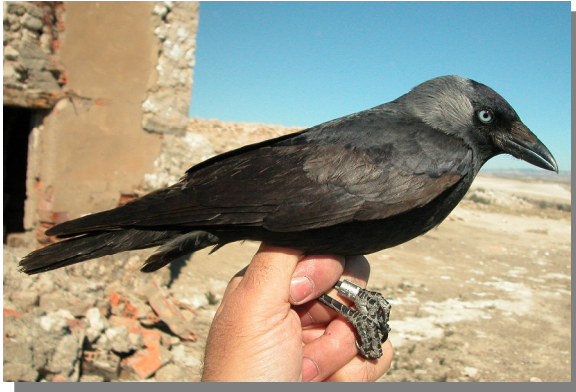
Jackdaw. 2nd year (11-III).