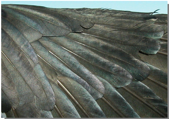
Jackdaw. Adult: pattern of alula (27-IV).