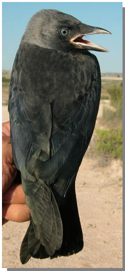
Jackdaw. Upperpart pattern: top left adult (28-V); top right 2nd year (11-III); left juvenile (28-VI)