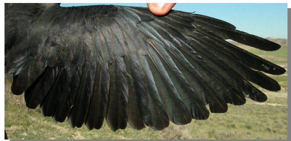
Jackdaw. Adult: pattern of wing (27-IV).