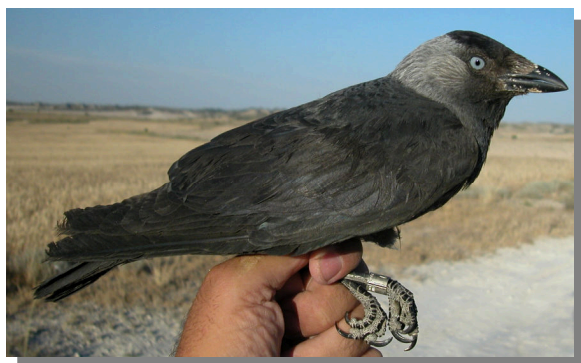
Jackdaw. Adult (28-V).