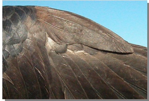
Jackdaw. 2nd year: pattern of alula (11-III).