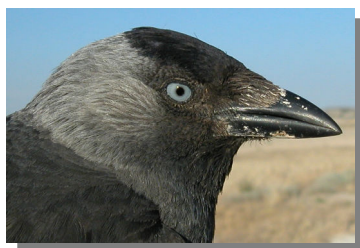
Jackdaw. Pattern of head and neck.

30-31 cm. Black plumage, with grey neck-side and nape; black bill and legs.