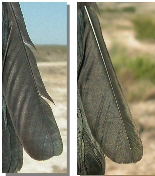
Jackdaw. Ageing. Pattern of tip of the outermost tail feather: left adult; right juvenile.

Adult with fresh and glossy black plumage on wing and tail, without moult limits; outer tail feather with forked tip; dark crown contrasting with nape.