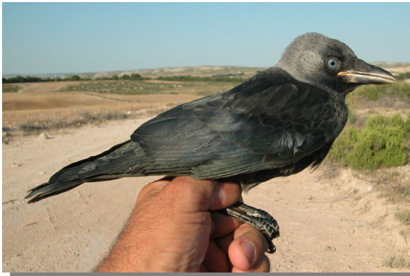
Jackdaw. Juvenile (28-VI).

Jackdaw. Breast pattern: top adult (12-VI); middle 2nd year (11-III); bottom juvenile (28-VI)