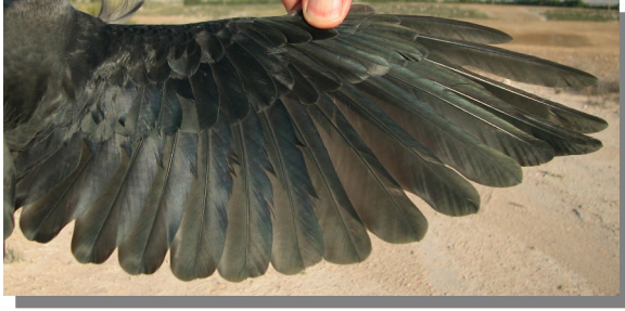
Jackdaw. Juvenile: pattern of wing (28-VI).