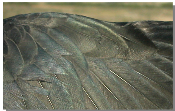
Jackdaw. Juvenile: pattern of alula (28-VI).