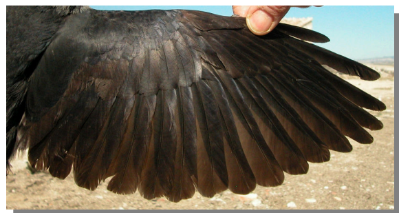
Jackdaw. 2nd year: pattern of wing (11-III).