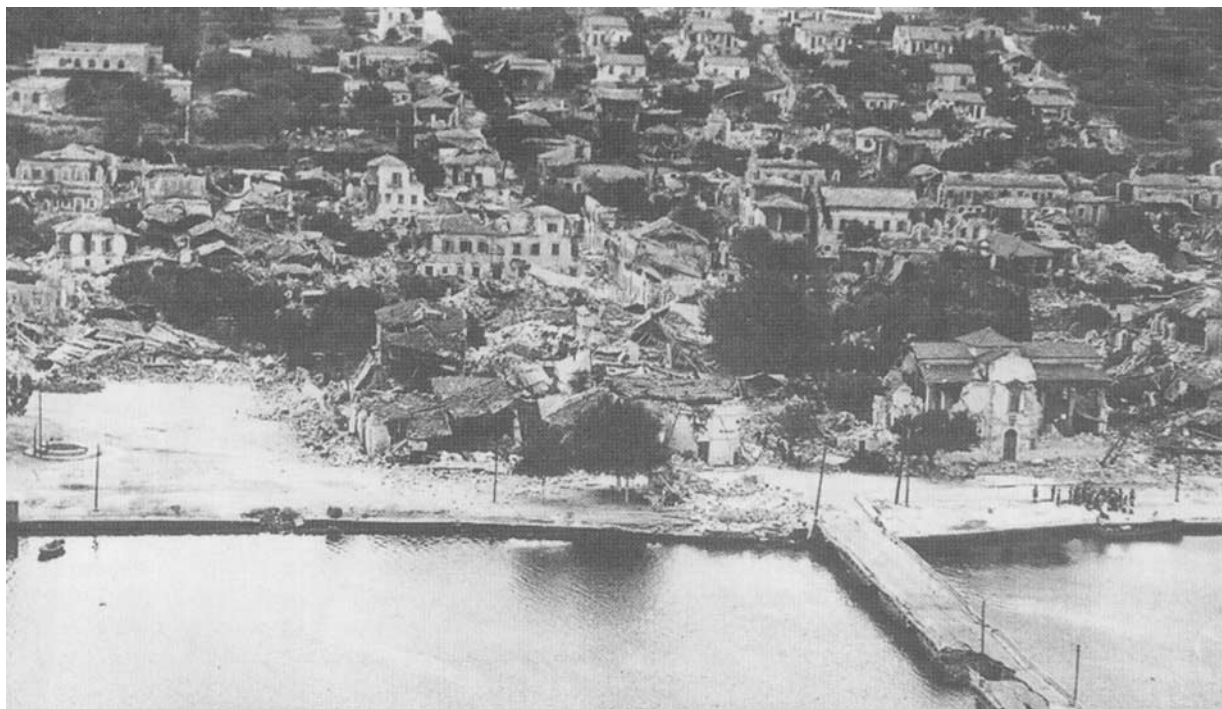
FIGURE 1.6 Argostoli after the earthquake Photographed looking west from above the town bridge. For a modern comparison see Figures 15.2 and 15.5.

supplies that I had. They turned sadly aside, and walked back to their family groups and sat down to go on waiting as they had done for days.