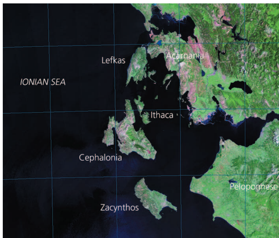
FIGURE 1.3 The southern Ionian Islands Colour interpretation: vegetation → green; water → black or dark blue; urban areas → lavender; bare soil → magenta. Grid: 50 km.

significant damage, the Greeks had long since adopted the philosophy of their ancestor Zeno and learnt to be stoic: to accept the power of nature, to endure hardship without complaint and without trying to circumvent whatever the future might hold.