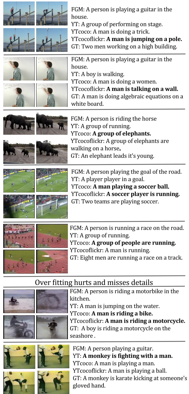
Figure 4: Examples to demonstrate effectiveness of transferring from the image description domain. YT refer to the LSTM-YT, YTcoco to the LSTM-YT coco , and YTcoco+flickr to the LSTM-YT coco+flickr models. GT is a random human description in the ground truth. Sentences in bold highlight the most accurate description for the video amongst the models. Bottom two examples show how transfer can overfit. Thus, while base LSTM-YT model detects water and monkey, the LSTM-YT coco and LSTM-YT coco+flickr models fail to describe the event completely.